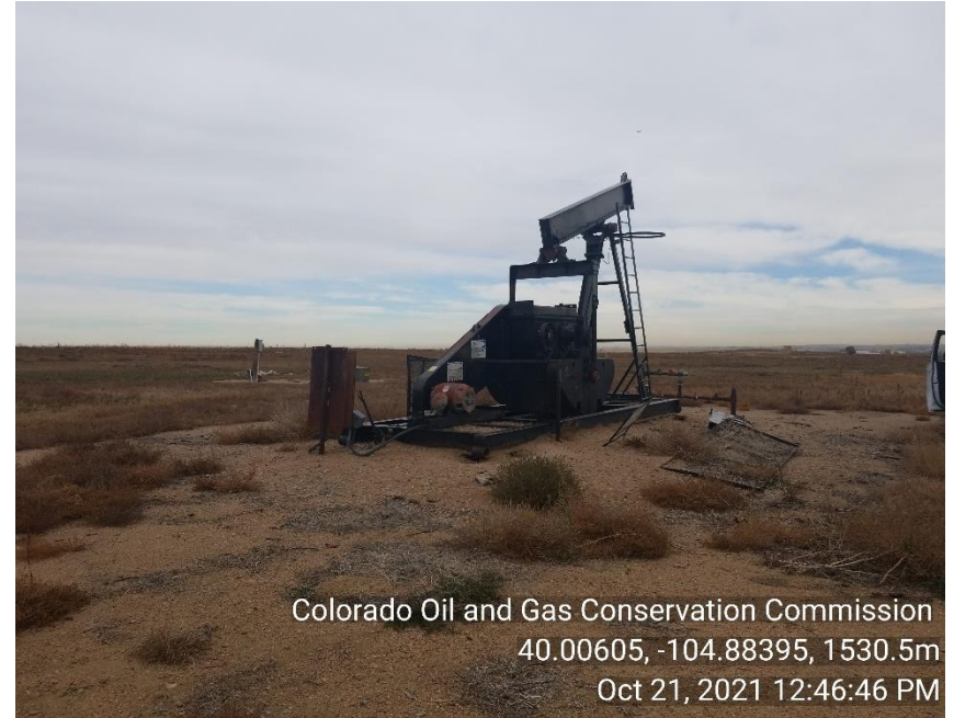
Photo 8 Loc pic of unused equipment.