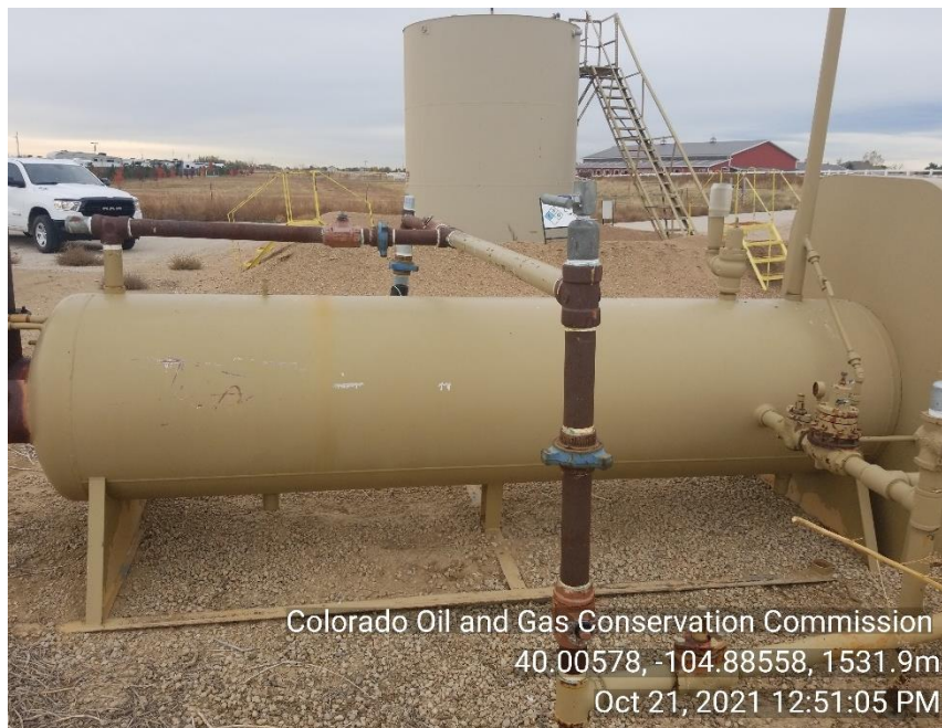
Photo 13 Supply line for HOZ Sep in closed position.