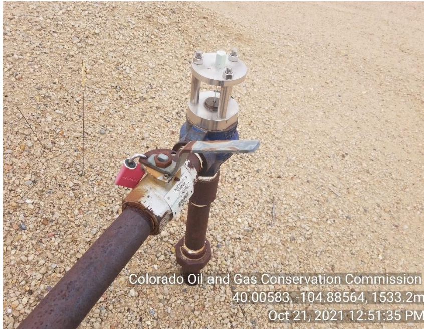
Photo 15 Gas sales line outlet from meter LOTO