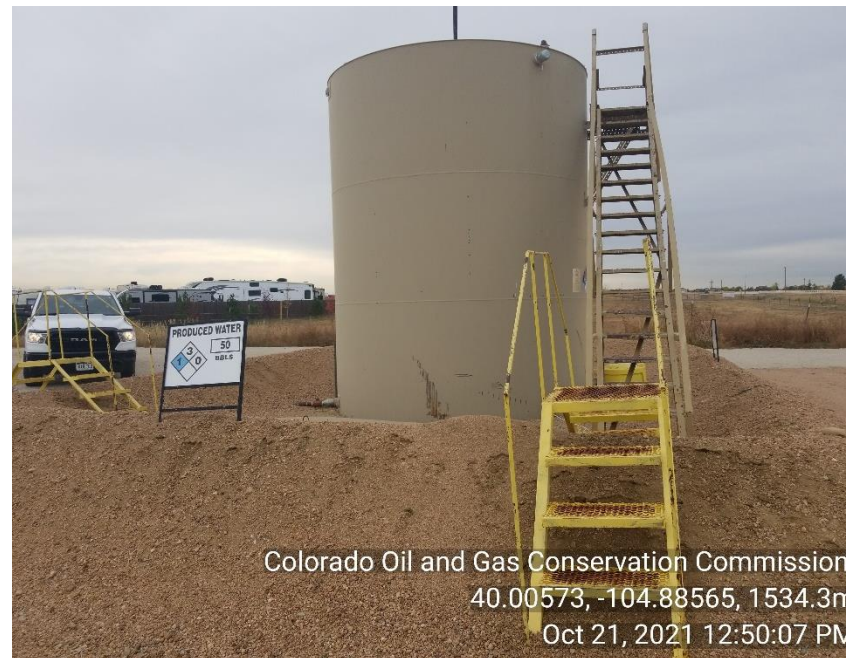
Photo 10 TNK BTRY