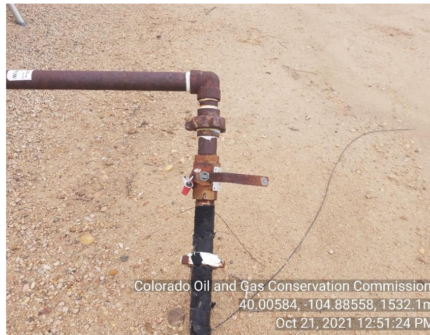
Photo 14 Gas sales inlet to meter is LOTO