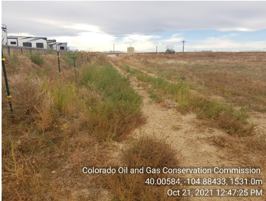
Photo 7 Debris: dead weeds on access road. Road not properly maintained.