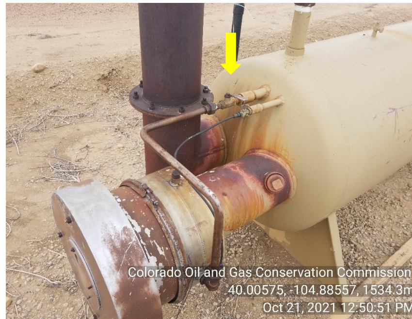
Photo 12 HOZ Sep not in use fuel gas line is in closed position.