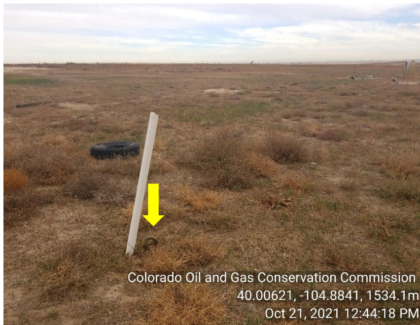
Photo 5 Guyline anchor not properly marked.