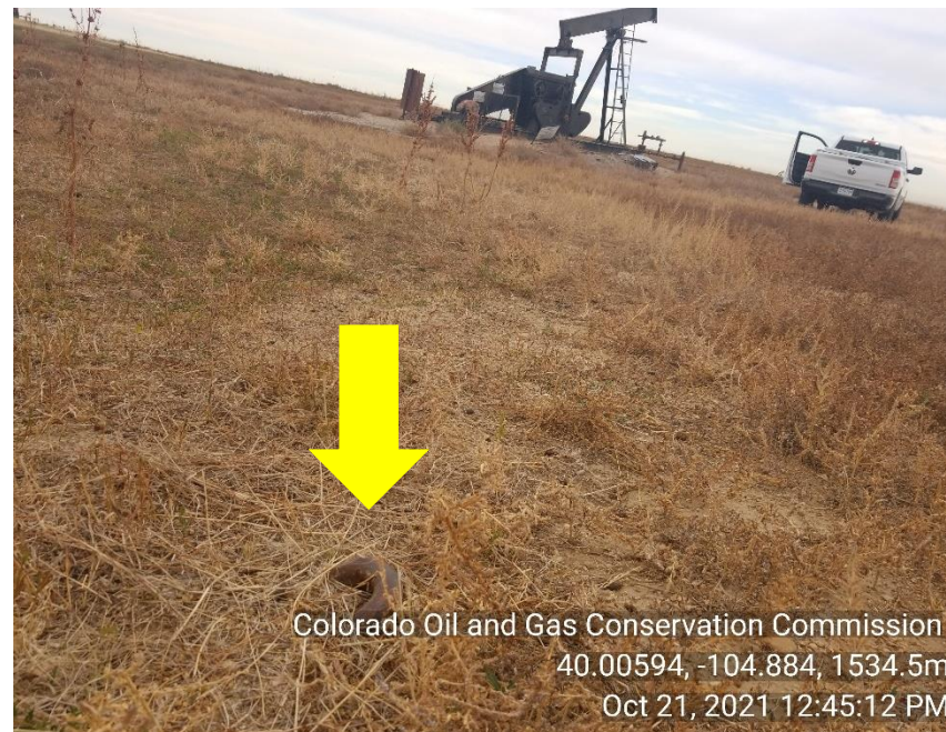
Photo 6 Guyline anchor not properly marked.