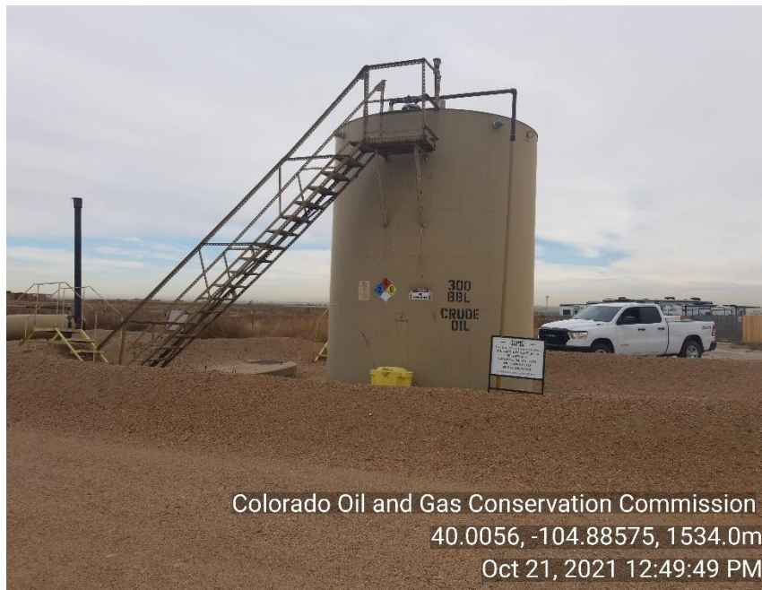
Photo 9 TNK BTRY