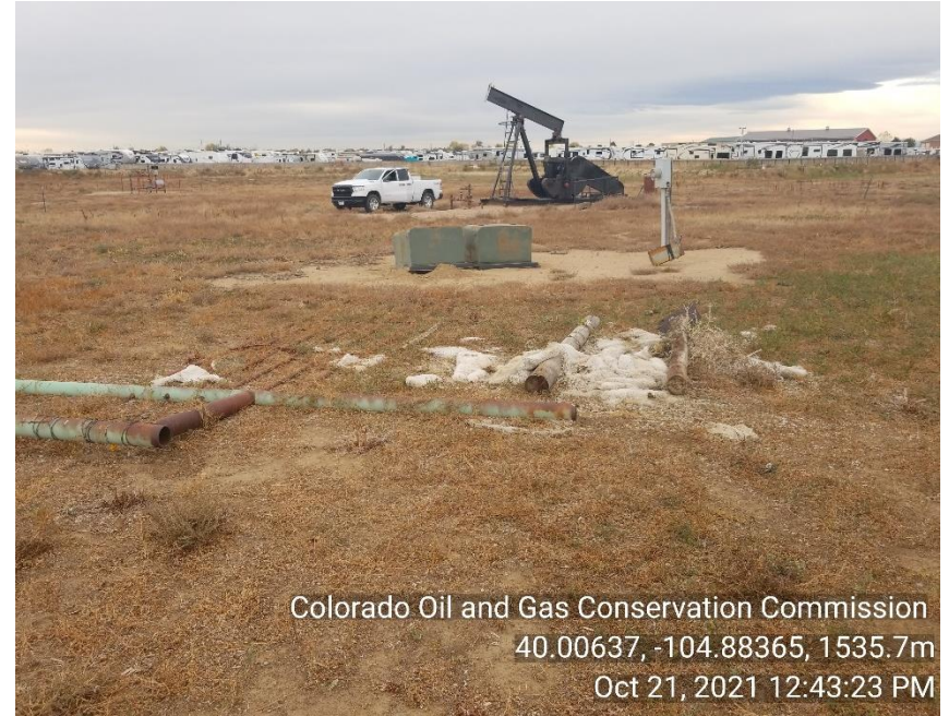
Photo 4 unused equipment fencing and gate. Trash and debris.