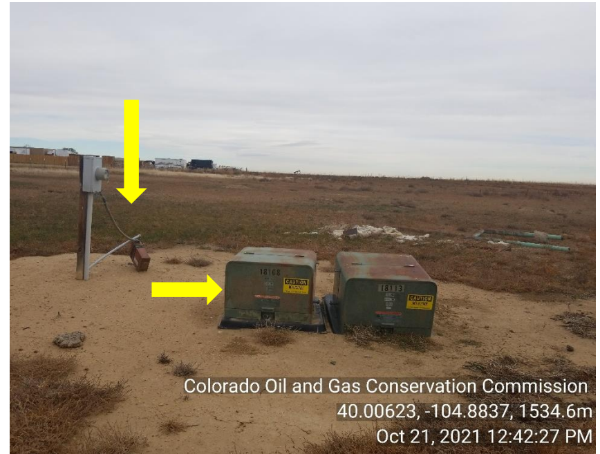
Photo 2 Unused equipment electric meter and electric panel.