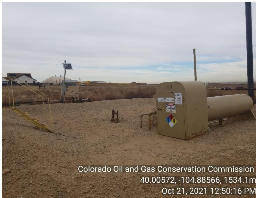
Photo 11 Production equipment