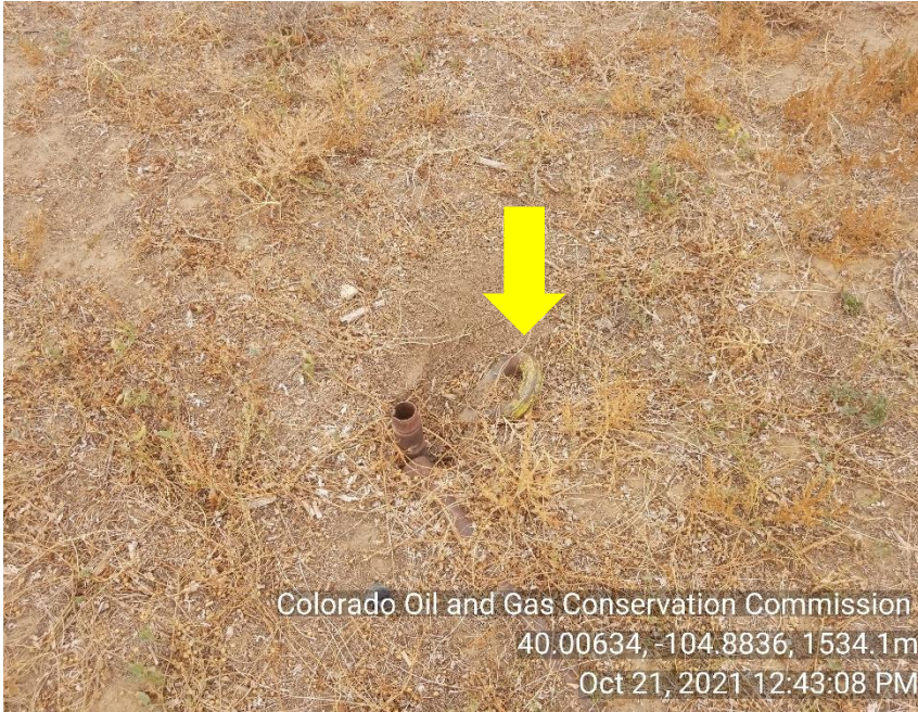
Photo 3 Guyline anchor not properly marked.