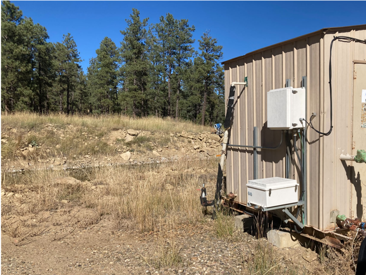
PHOTO 2: MAINTENANCE HAS BEEN PERFORMED TO EQUIPMENT. THE IMPACTED SOIL WAS REMOVED AND PROPERLY DISPOSED IN ACCORDANCE WITH THE OGRIS OPERATING WASTE MANAGEMENT PLAN.

HILL RANCH 10-02V API# 05-071-07146 – OGRIS OPERATING OGCC OPERATOR NUMBER 10758 - DATE: OCTOBER 14, 2021 CORRECTIVE ACTIONS COMPLETED REGARDING COGCC FIR DOCUMENT # 695104898