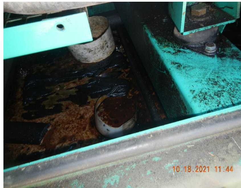
Stained floor inside of generator unit.