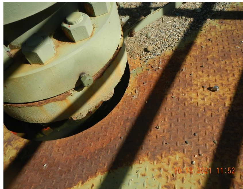
Cellar full of fluid.