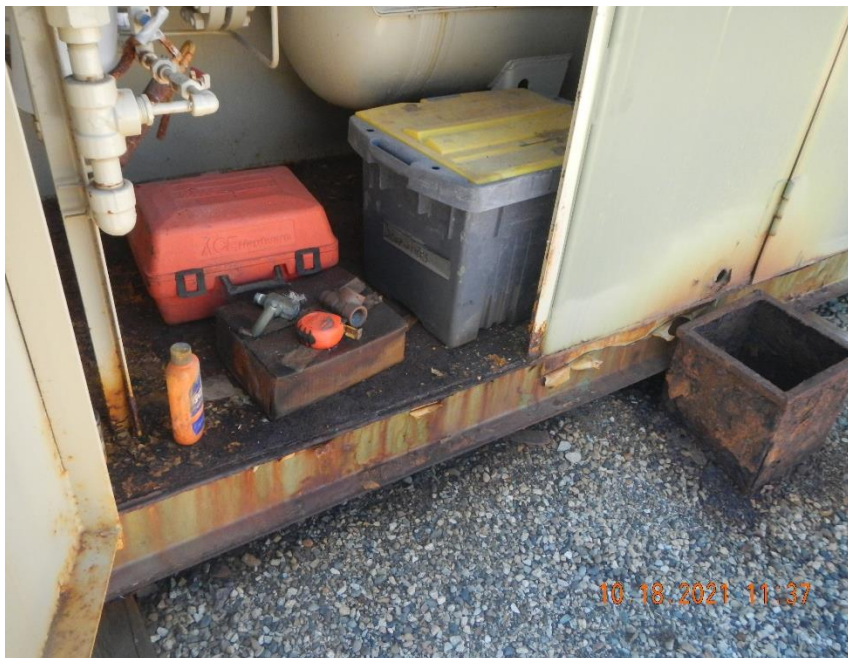
Stained floor inside of separator unit. Stained ground under front of separator unit.