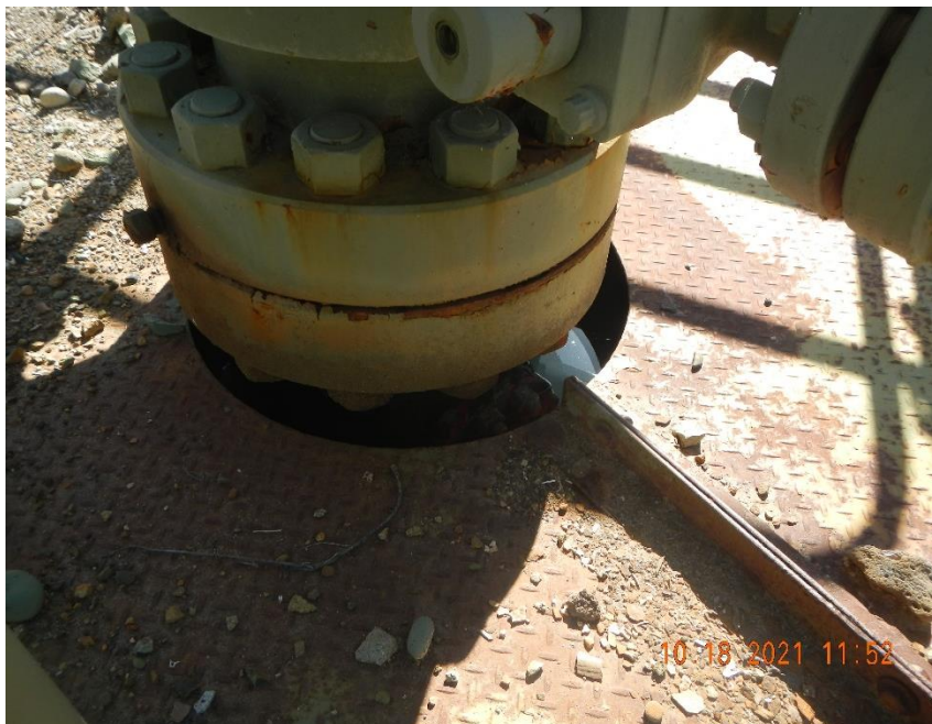
Cellar full of fluid.