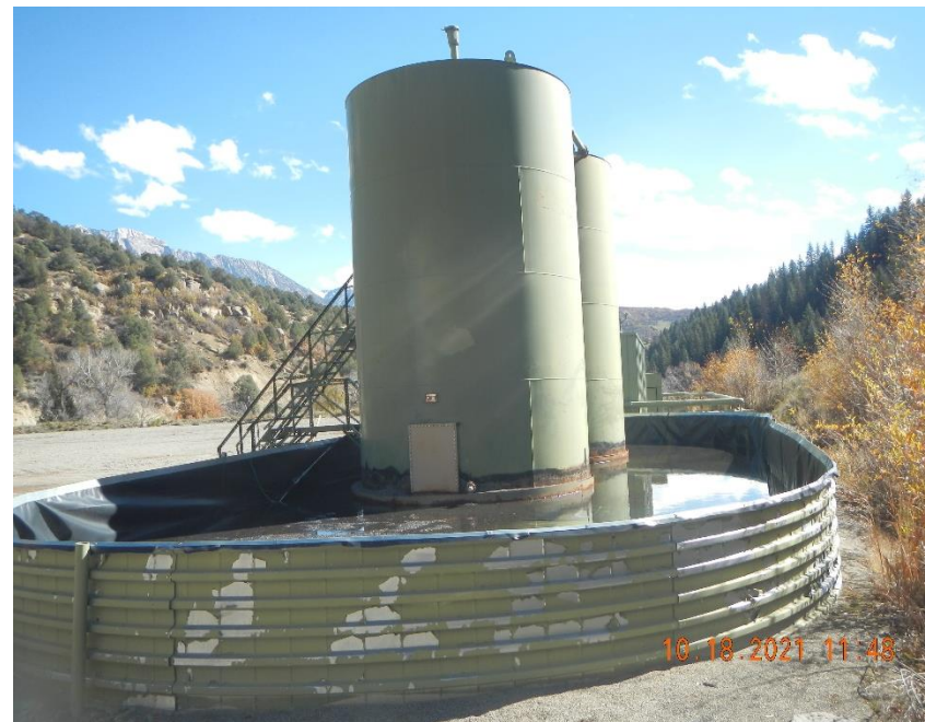
Storm water in tank berm.