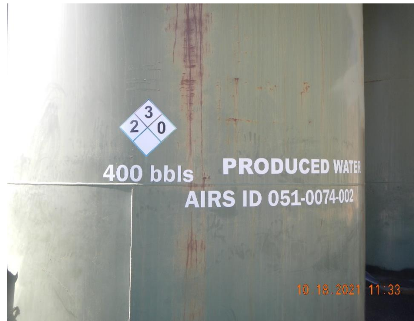
NFPA label colored diamonds are faded.