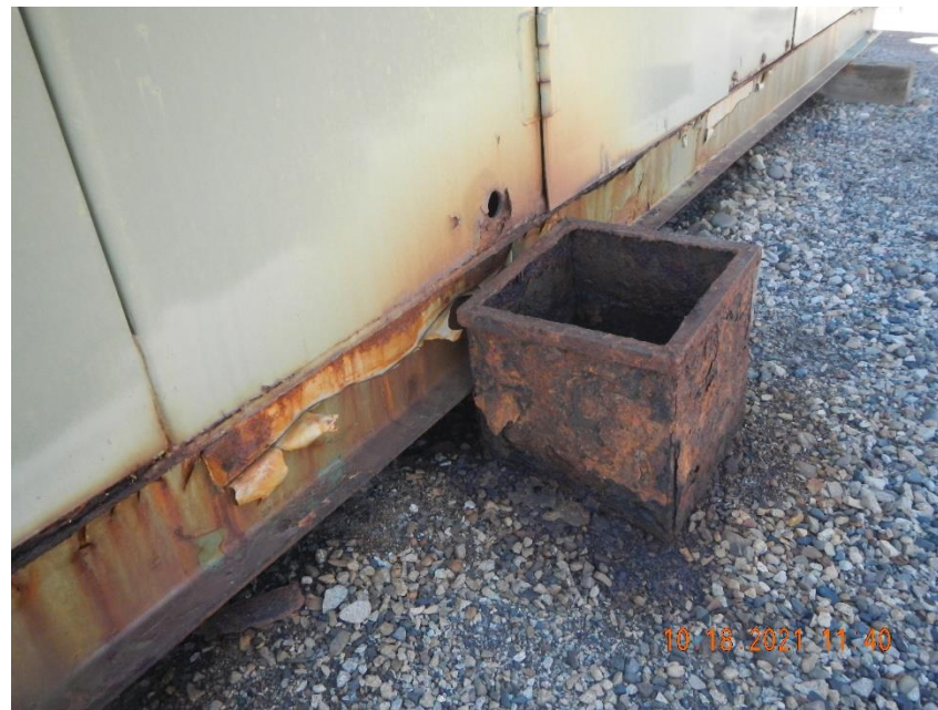
Square metal catch container in front of separator is rusted and deteriorating.