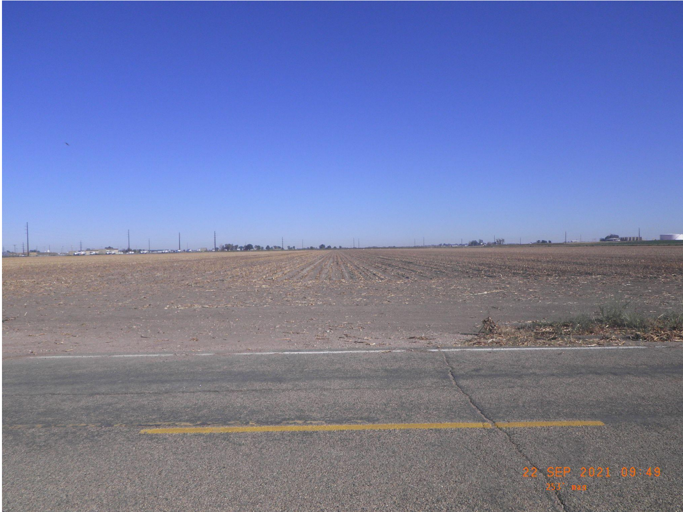
Photo 2. Ground photo of the tank battery and well pad field. Photo shows that the crop has been harvested and will need to be re-inspected during the next growing season.