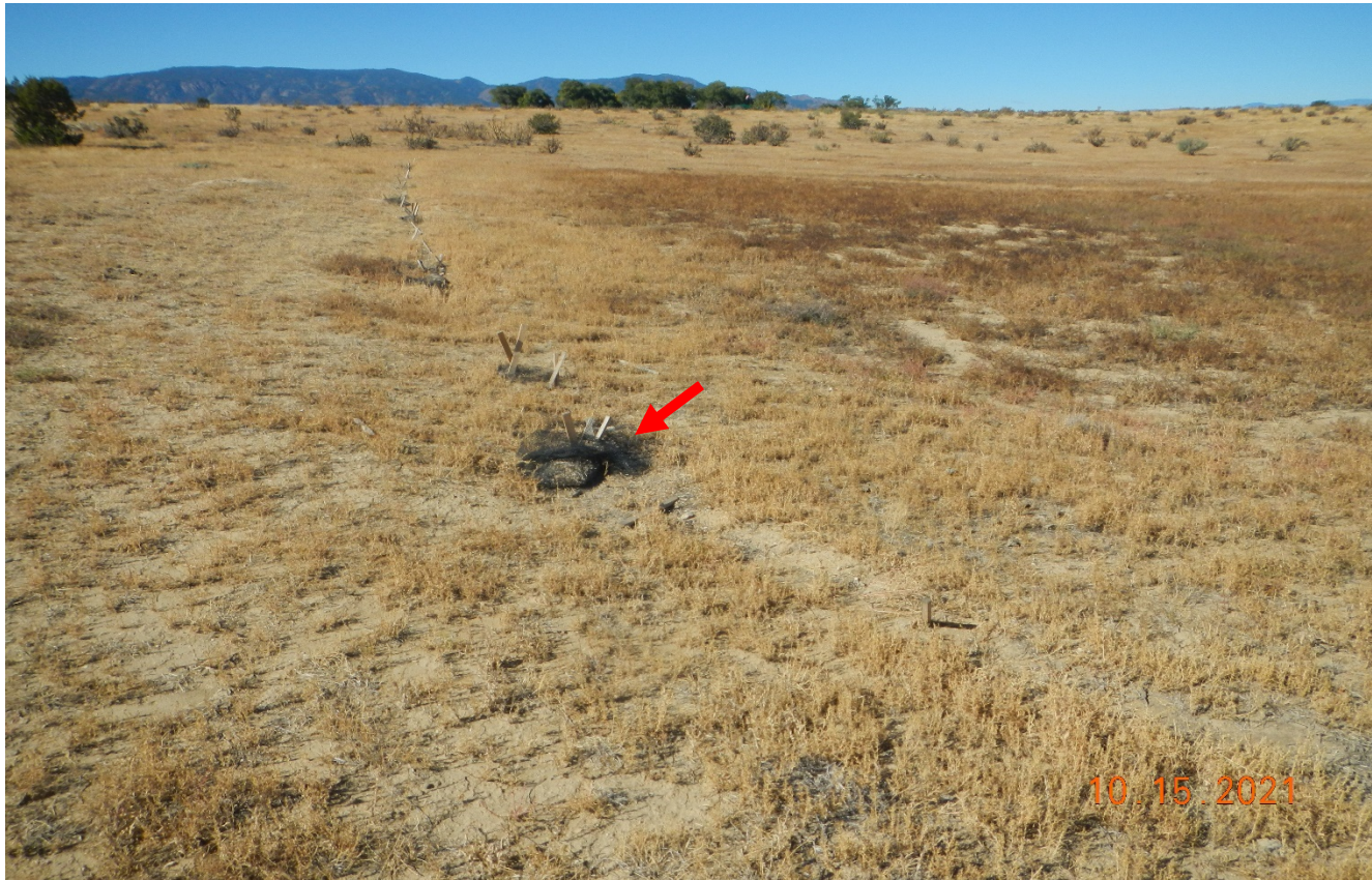
Photo 3. Facing west. The wattles around the perimeter were never repaired and removed. The stakes and netting debris still remain shown at red arrow.