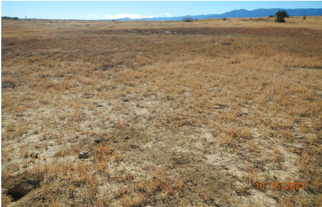
Photo 5. Center of the location facing south.