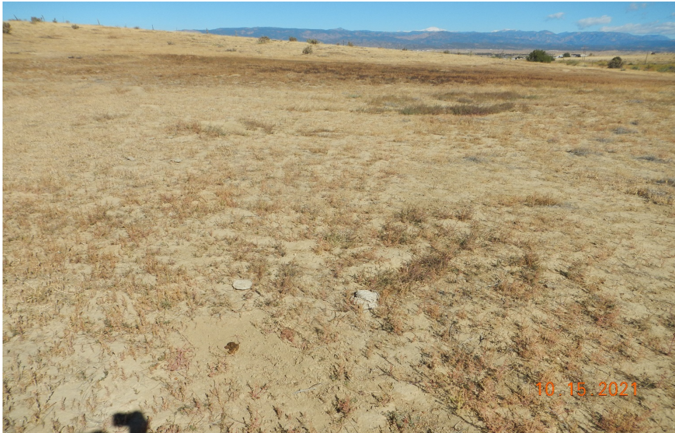
Photo 4. Center of the location facing north.