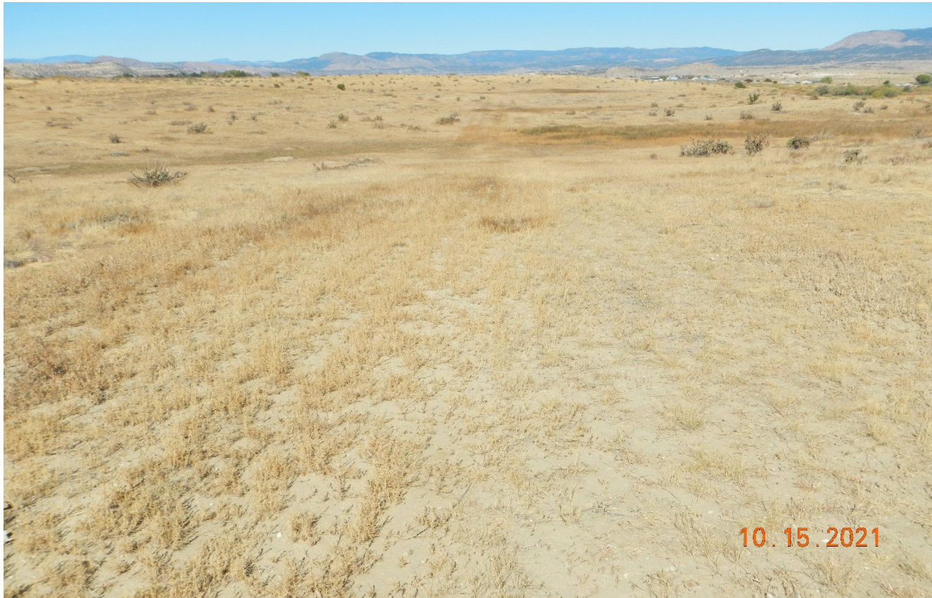
Photo 1. Facing northwest along the access road. Perennial vegetation has not re-established and there are undesirable weeds along the former road.