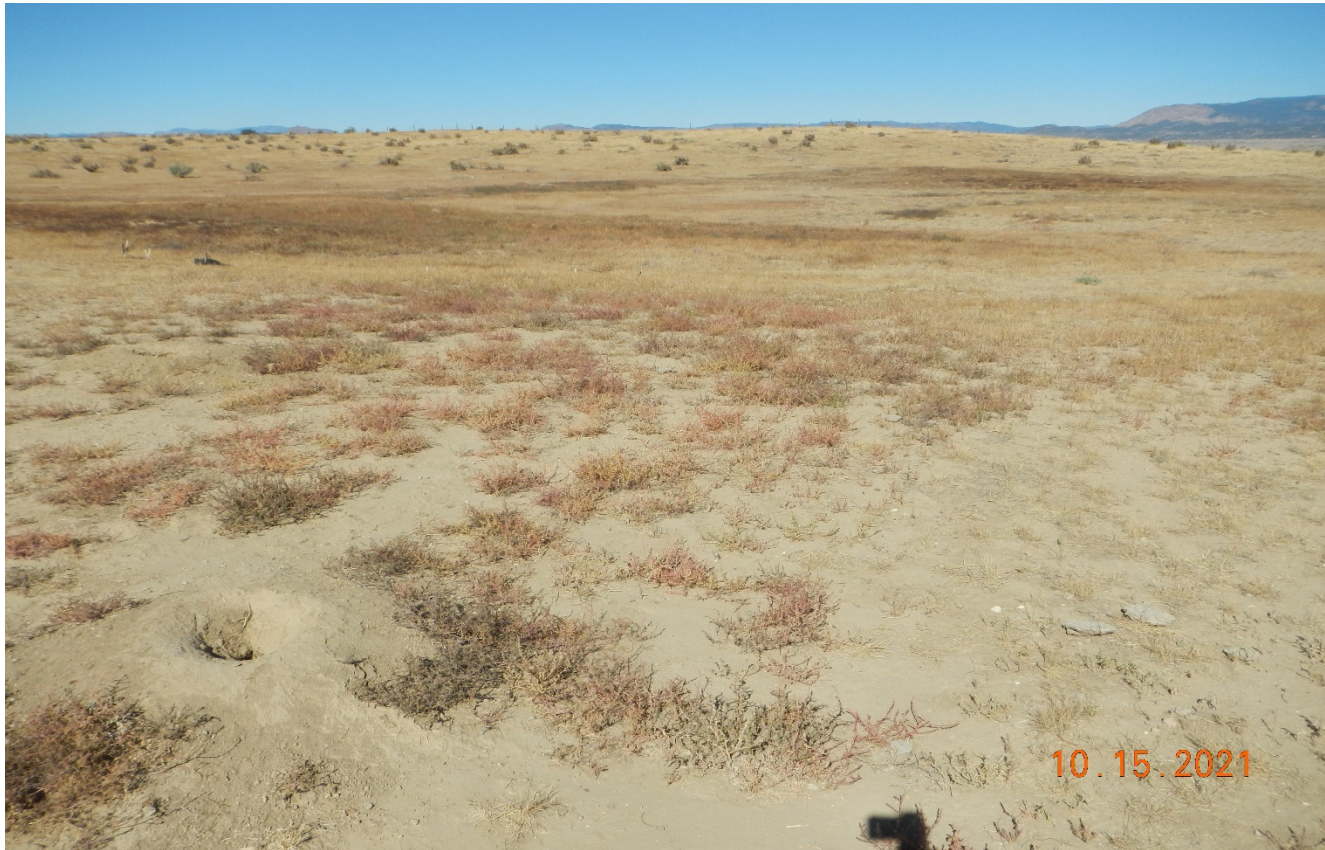
Photo 2. Facing northwest toward the location. The location consists of mostly undesirable weeds.