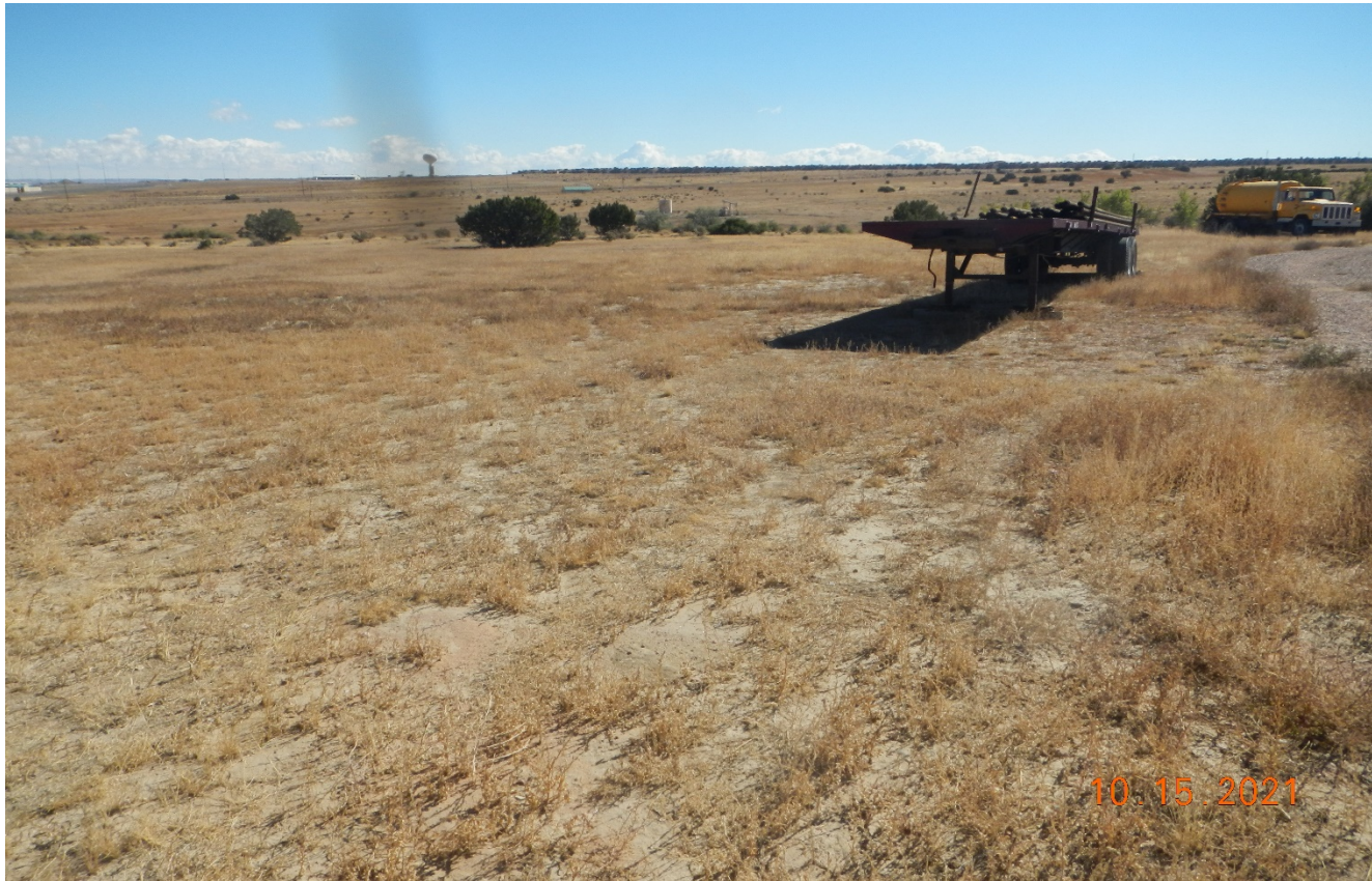
Photo 2. Facing southwest toward the location. Trailer remains in the same position as observed in previous inspection last year.