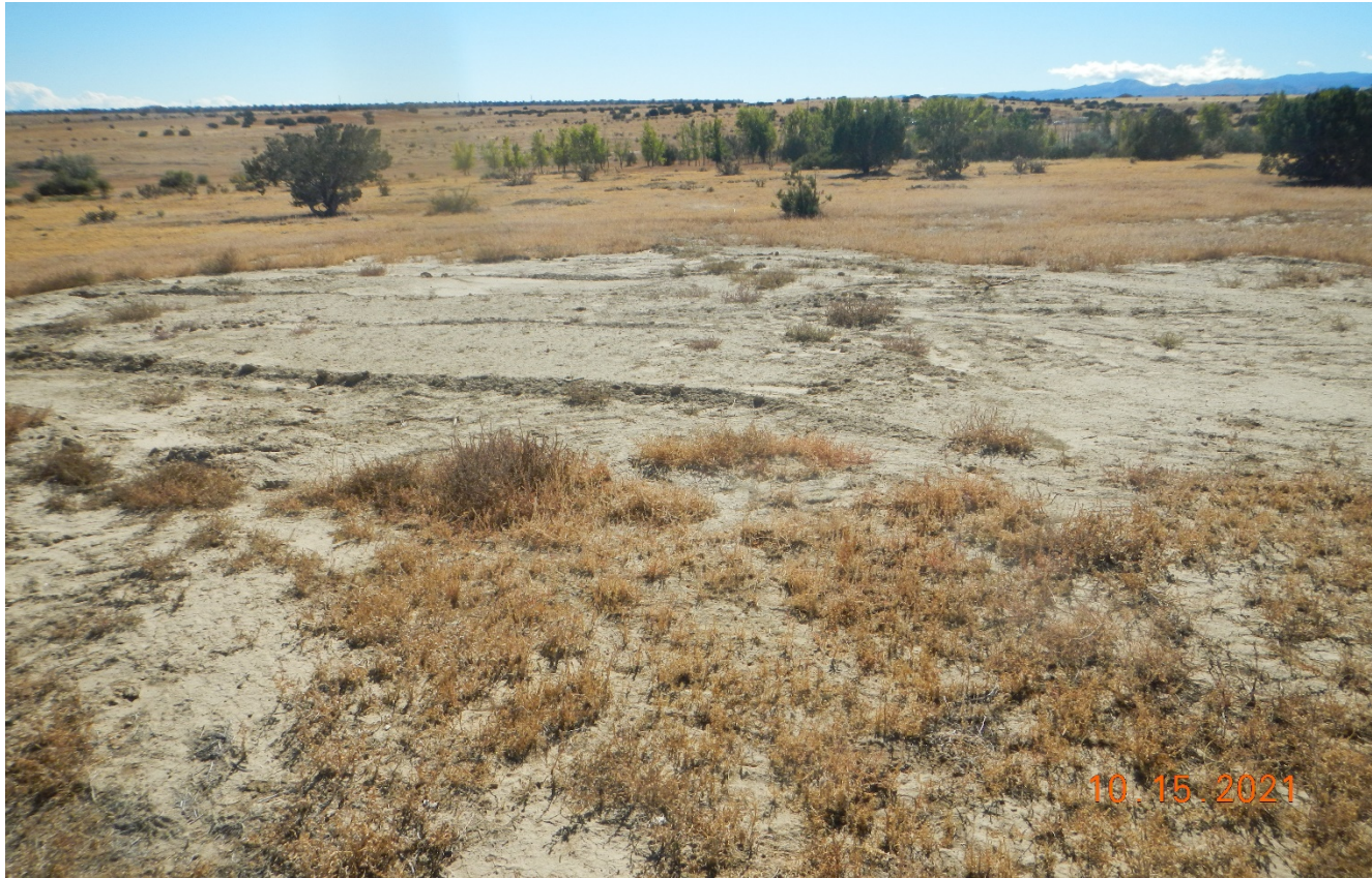
Photo 5. Facing southeast. This is where soil pile was previously observed which has been removed. This area has not been reclaimed and is susceptible to erosion.