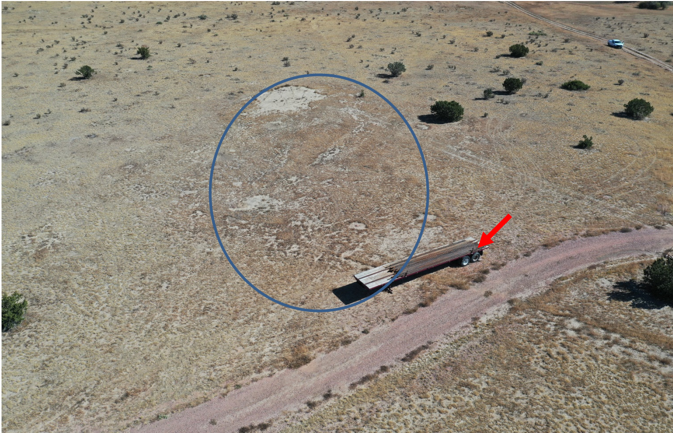
Photo 1. Drone aerial photo facing east toward the abandoned well site. The trailer is still parked on the well site shown at red arrow. The disturbance area circled consists of mostly undesirable weeds.