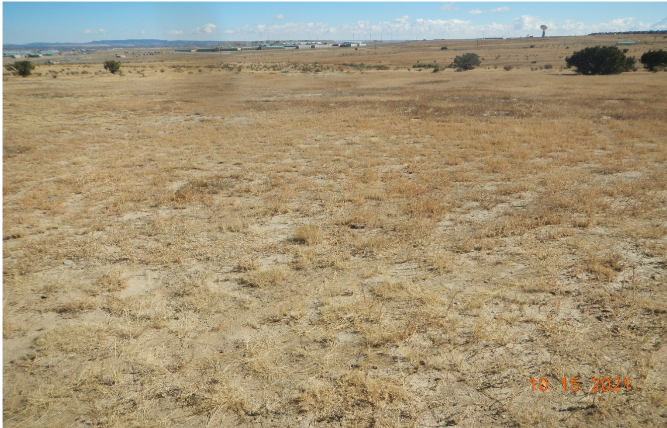
Photo 3. Facing west toward the location which consists of undesirable weeds (Kochia, Russian thistle).