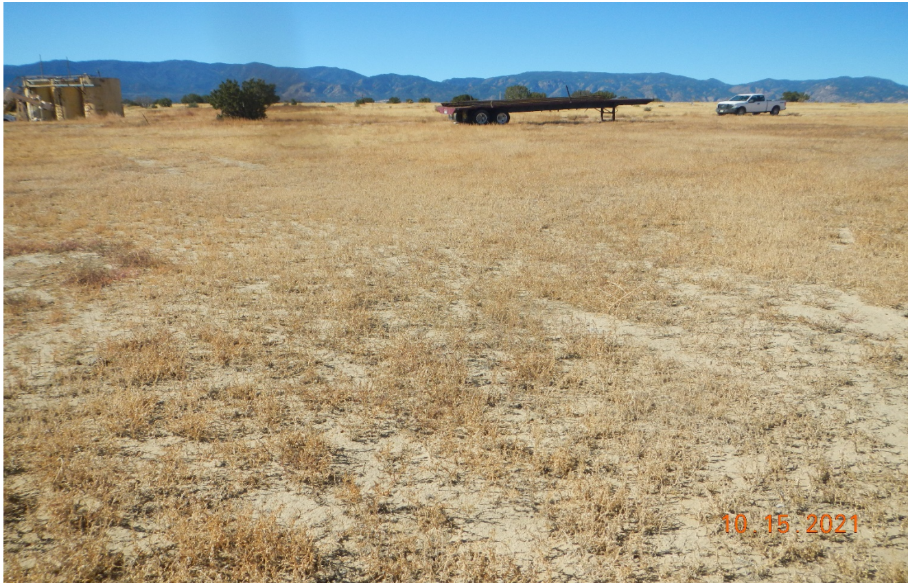
Photo 7. Center of the location facing west. The location has not been reclaimed and consists of undesirable weeds.