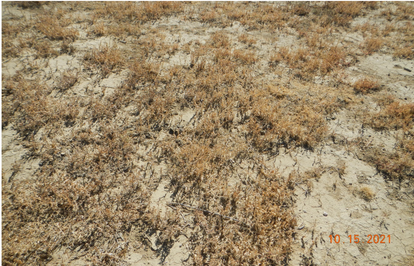
Photo 4. View of ground cover shows undesirable weeds observed throughout the location.