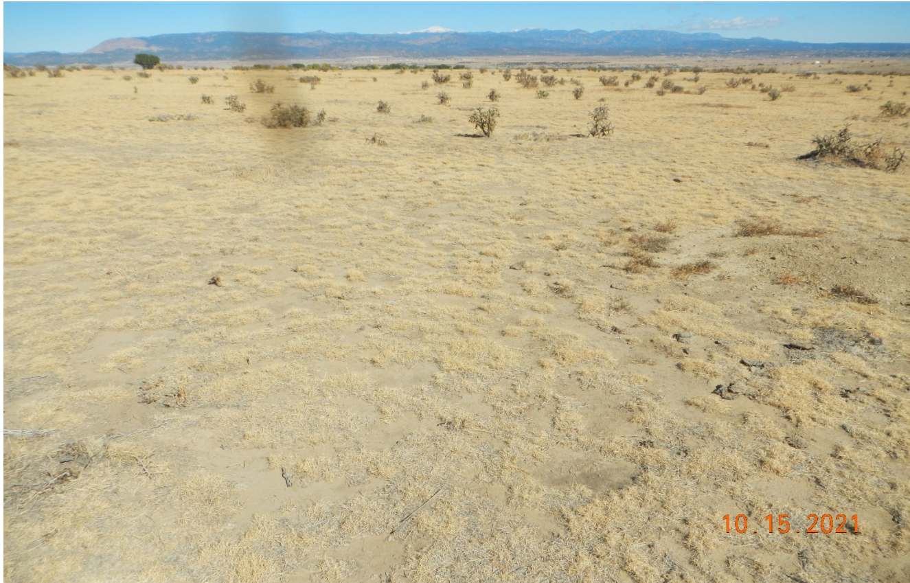
Photo 8. Facing north toward the surrounding undisturbed reference area.