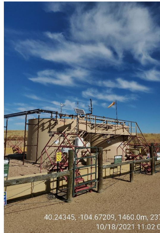
Photo 6 Battery