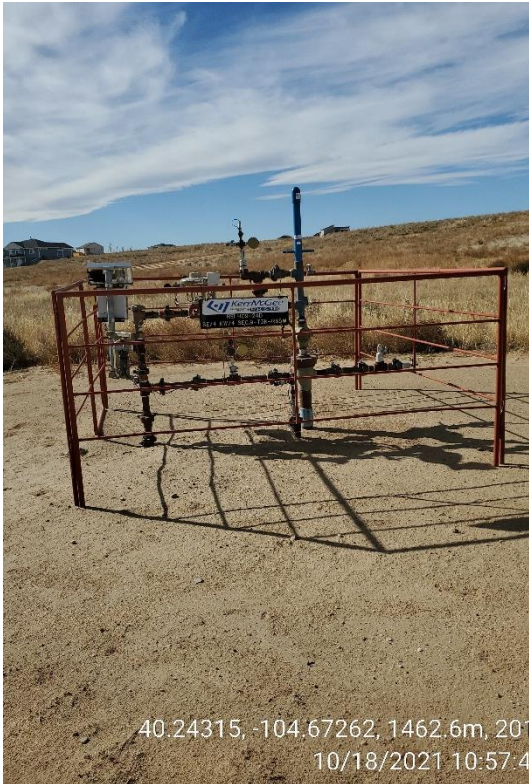
Photo 1 05-123-35040 REI H 09-24D