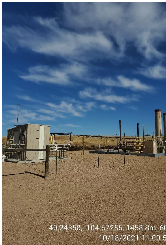
Photo 5 Battery