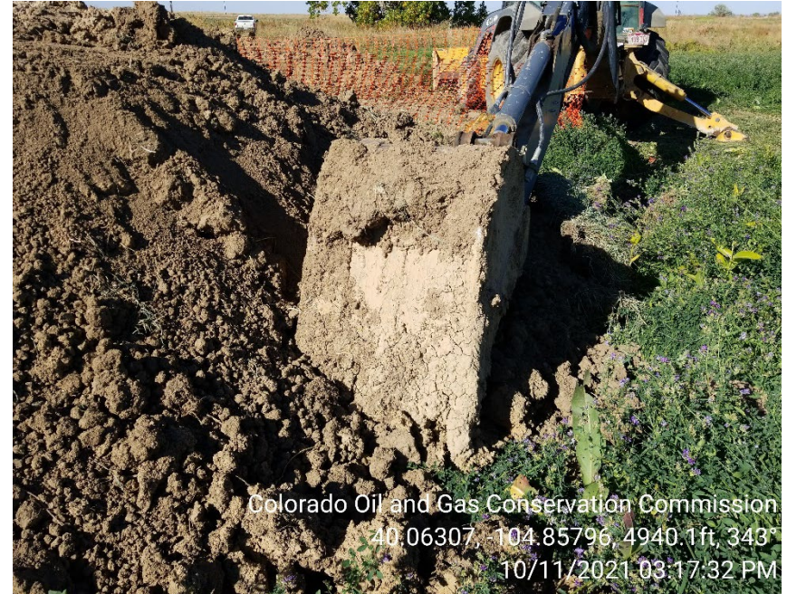
Photo 10 – Soil stored on location. No stormwater BMPs or lining present beneath soils pile. Excavated soils were dry.