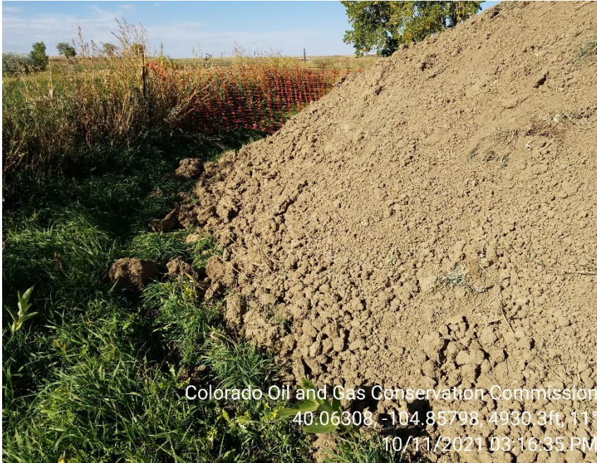
Photo 7 – Soil stored on location. No stormwater BMPs or lining present beneath soils pile. Excavated soils were dry.