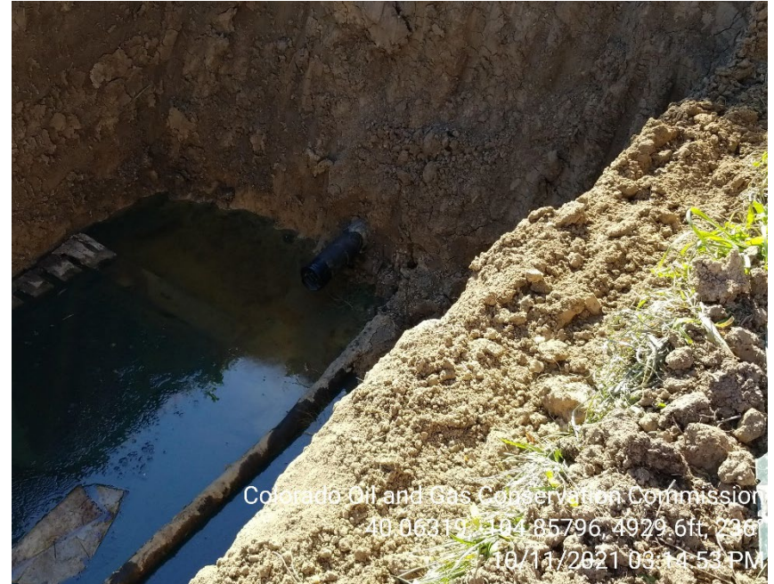
Photo 4 – Spill excavation. Tape placed over cut end of flowline. Leak observed from western end of cut flowline.