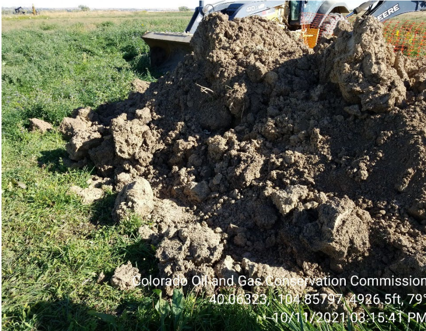
Photo 9 – Soil stored on location. No stormwater BMPs or lining present beneath soils pile. Excavated soils were dry.