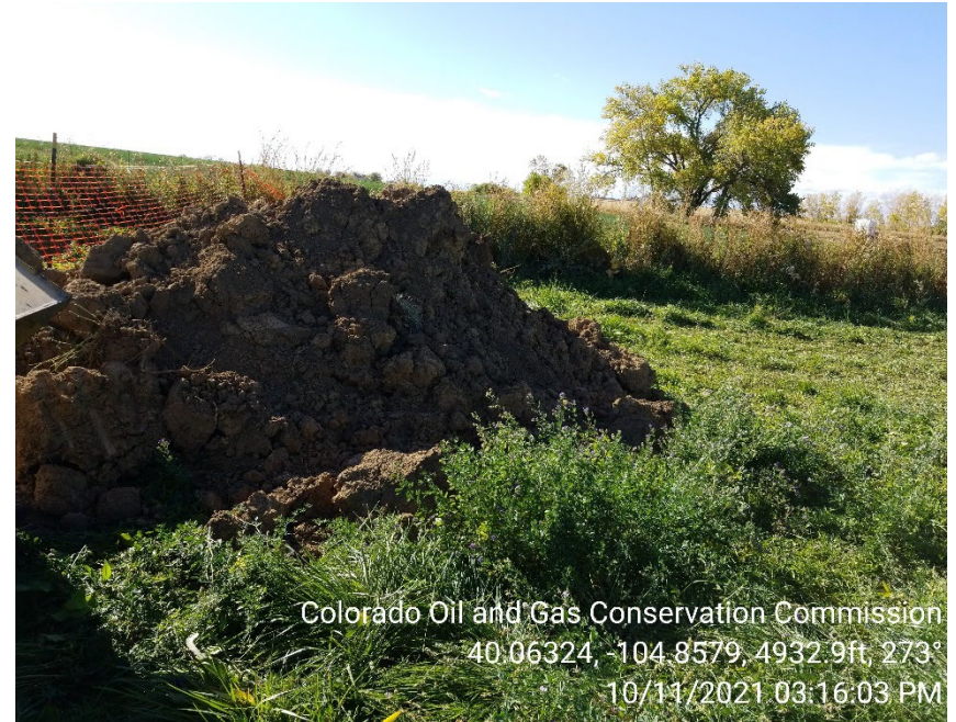
Photo 8 – Soil stored on location. No stormwater BMPs or lining present beneath soils pile. Excavated soils were dry.