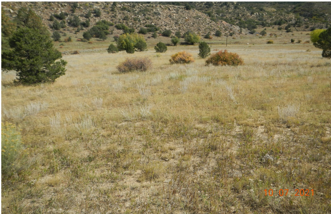
Photo 5. Facing east toward the surrounding undisturbed area.