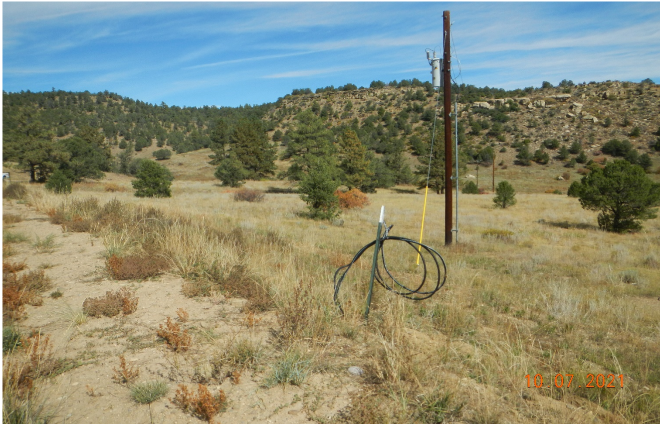
Photo 3. The electric utilities remain and the cable are unsecured.