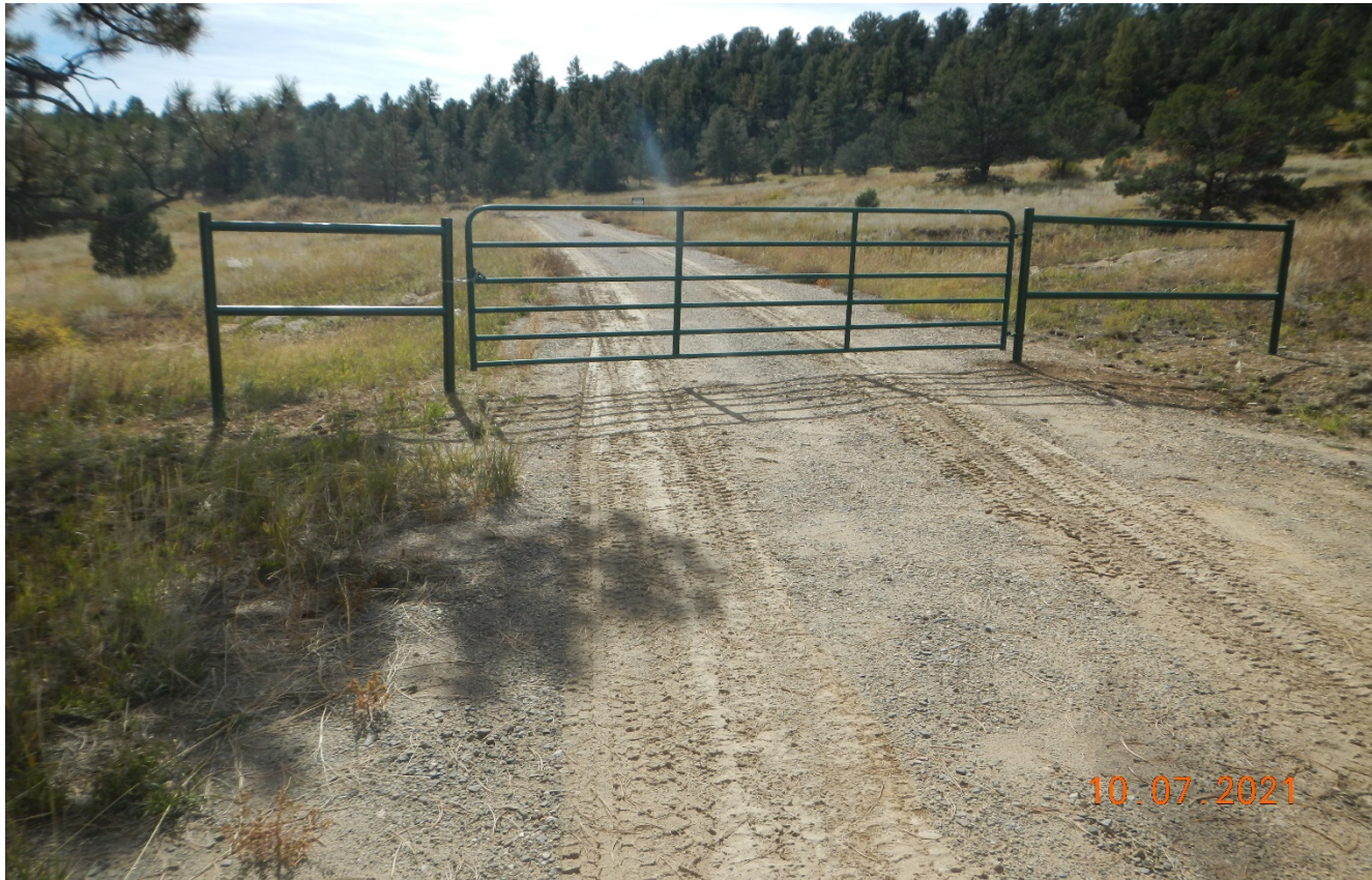
Photo 1. Facing southwest toward the access road.