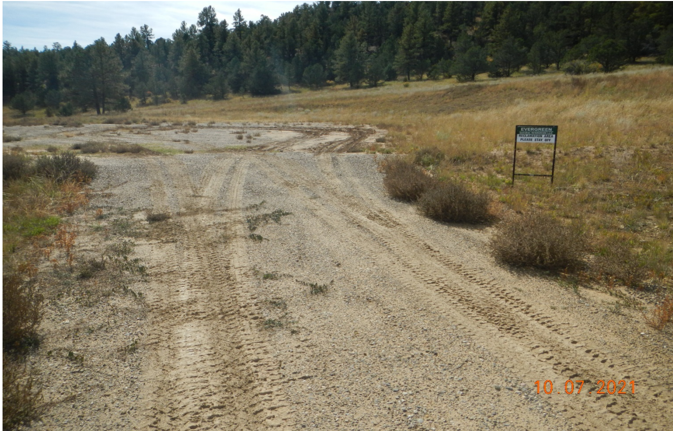
Photo 2. Facing southwest toward the location which has not been recontoured and reclaimed.