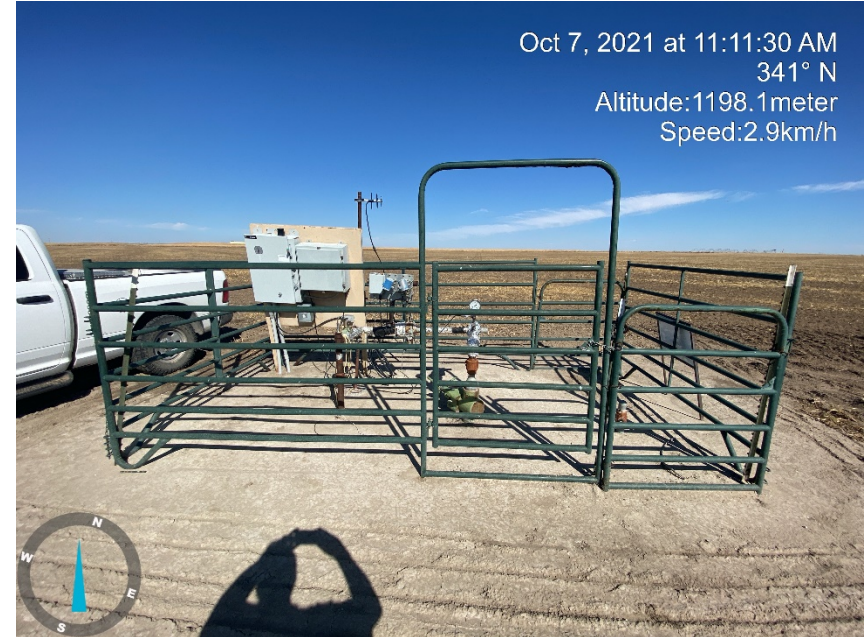
2. Wellhead Equipment