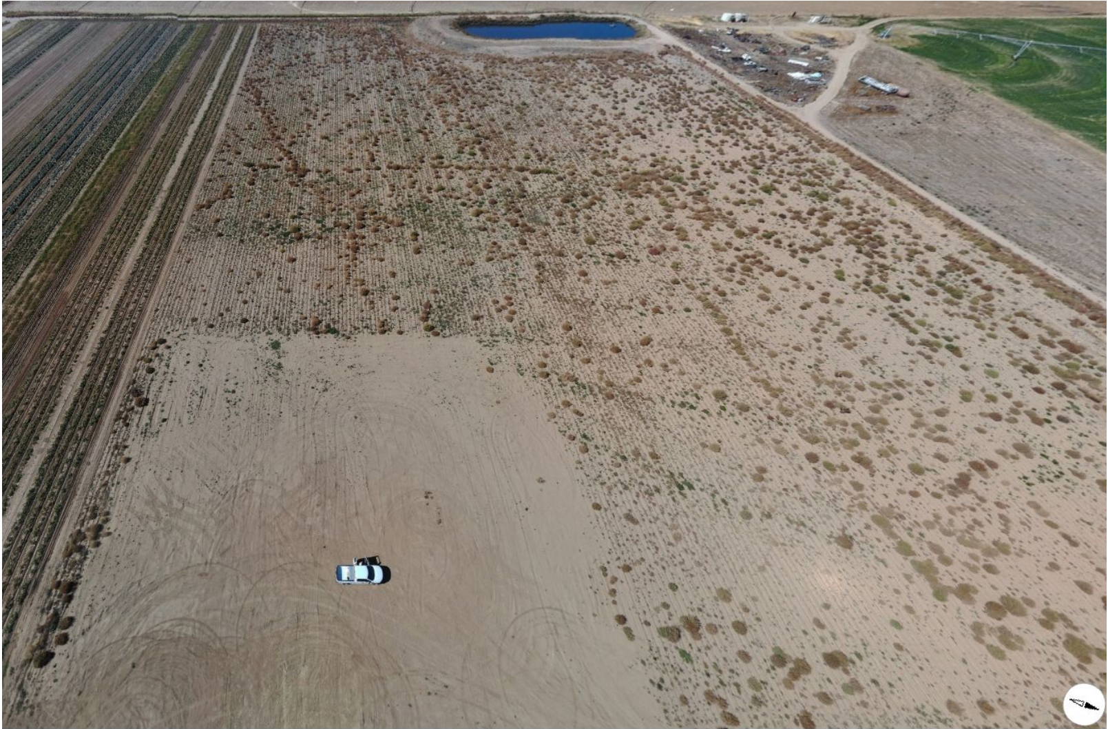
Photo 3. Drone aerial imagery taken on 10/6/2021 illustrates the ~10 acre area where plugging operations interfered with agricultural activities and also illustrates the agricultural field was prepared for agricultural activities with the evidence of furrows.