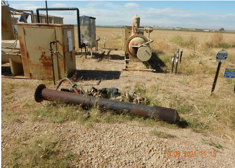
Photo 8. Photo taken from the tank battery, facing West. Photo illustrates unused equipment.