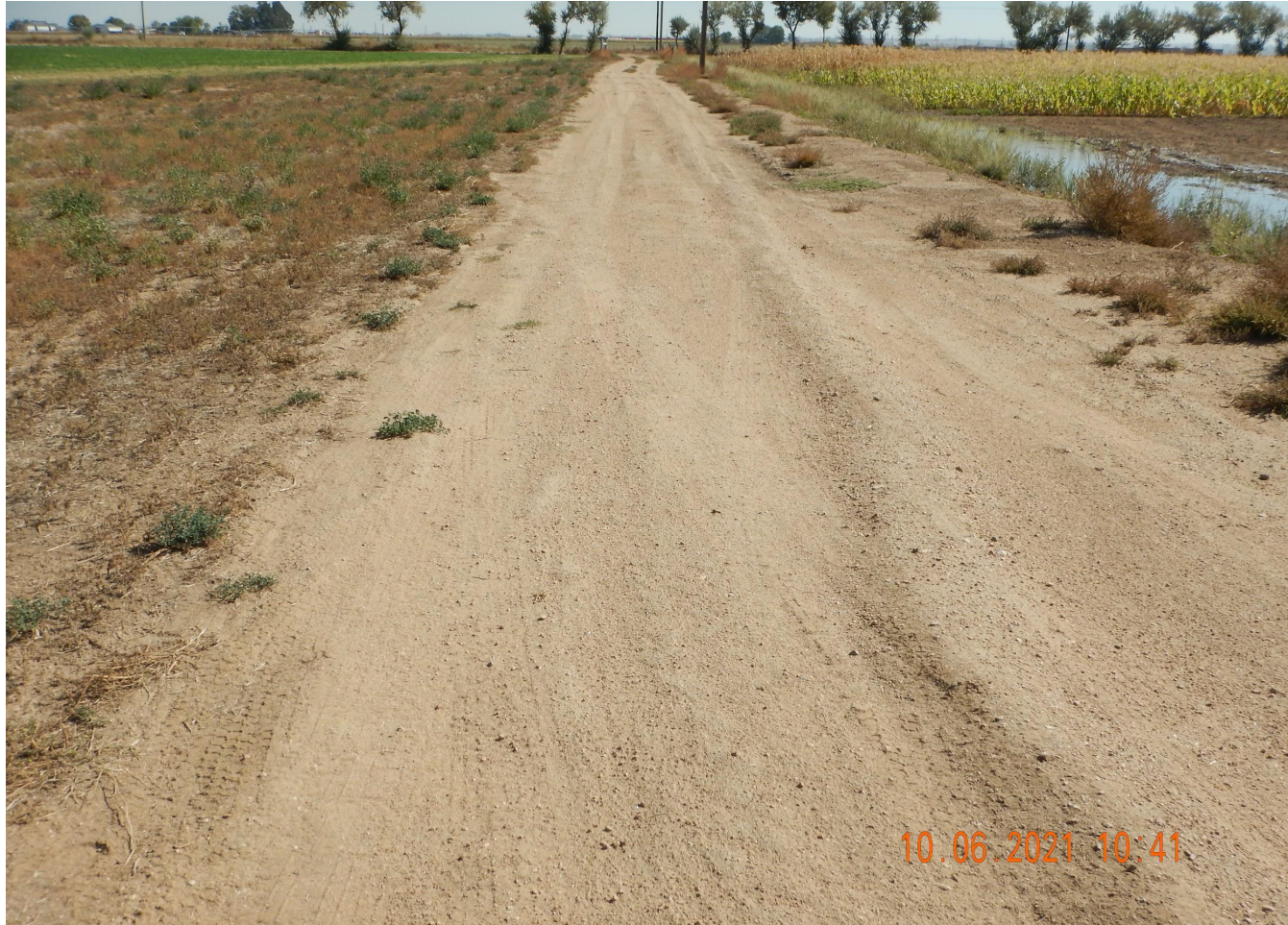
Photo 5. Photo taken from the northeastern well location access road, facing East. Photo illustrates some observed vehicle rutting that the complainant stated was due to oil and gas operations.