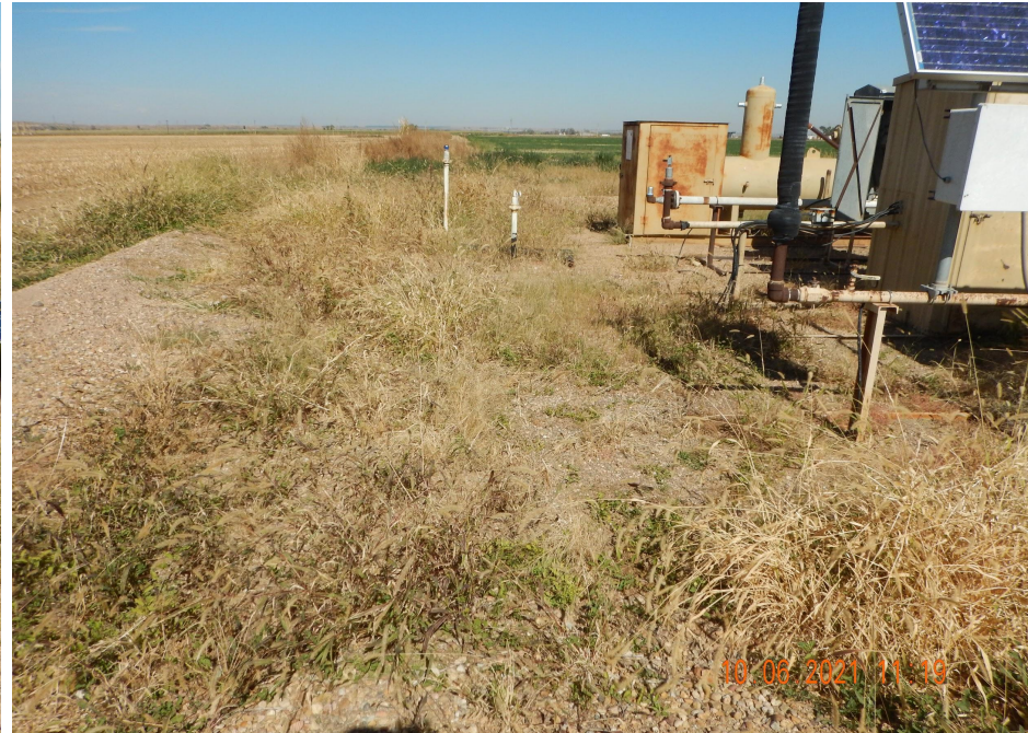
Photo 9. Photo taken from the tank battery, facing North. Photo illustrates unmanaged weeds.