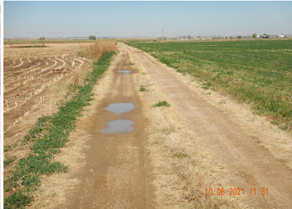
Photo 7. Photo taken from the northwestern well location access road, north of the tank battery facing North. See comments under Photo 5.