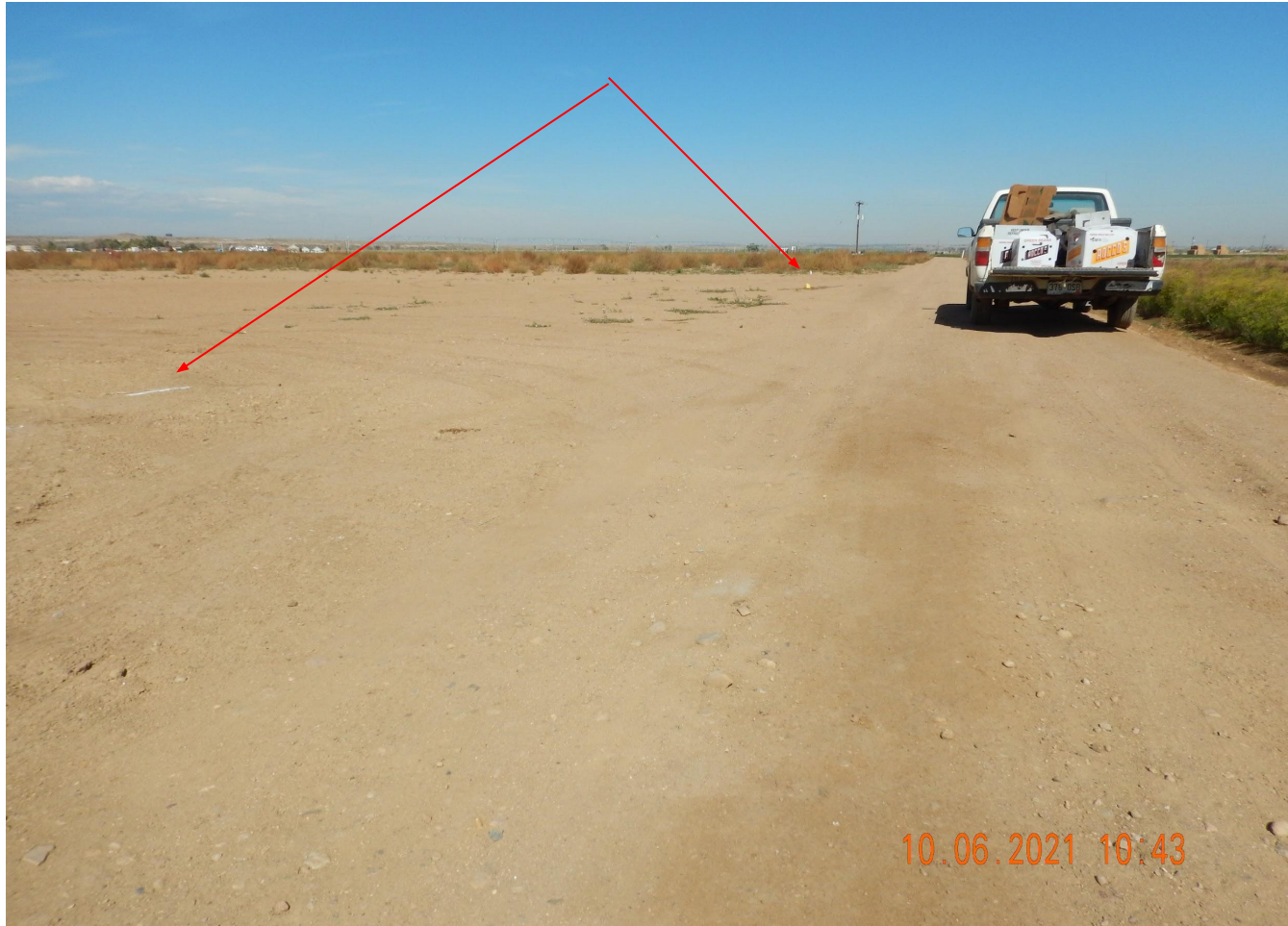
Photo 4. Photo taken from the well location, facing North. Photo illustrates flowline markers.