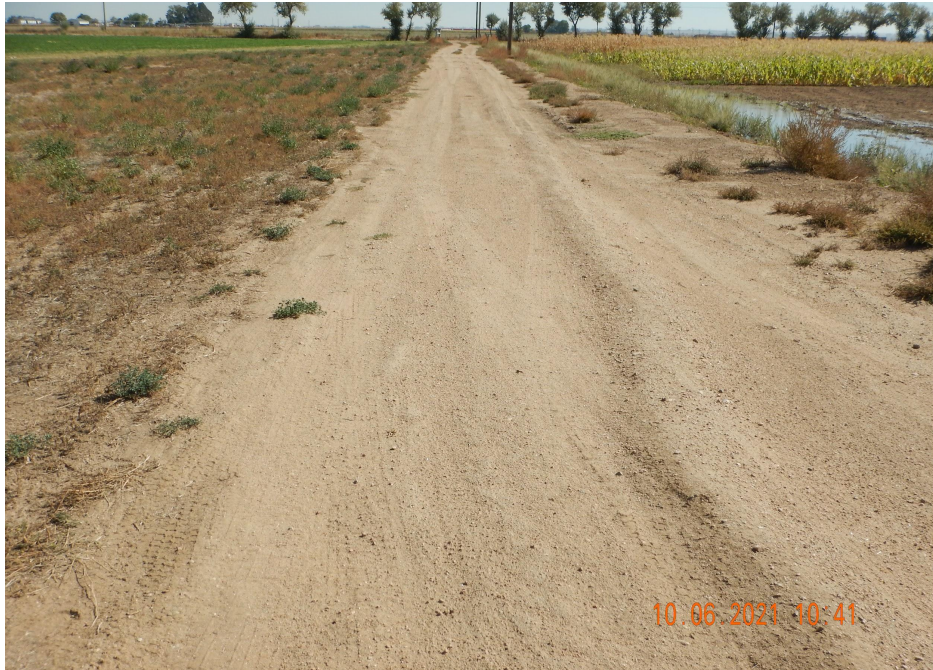
Photo 6. Photo taken from the northeastern well location access road, facing East. See comments under Photo 5.