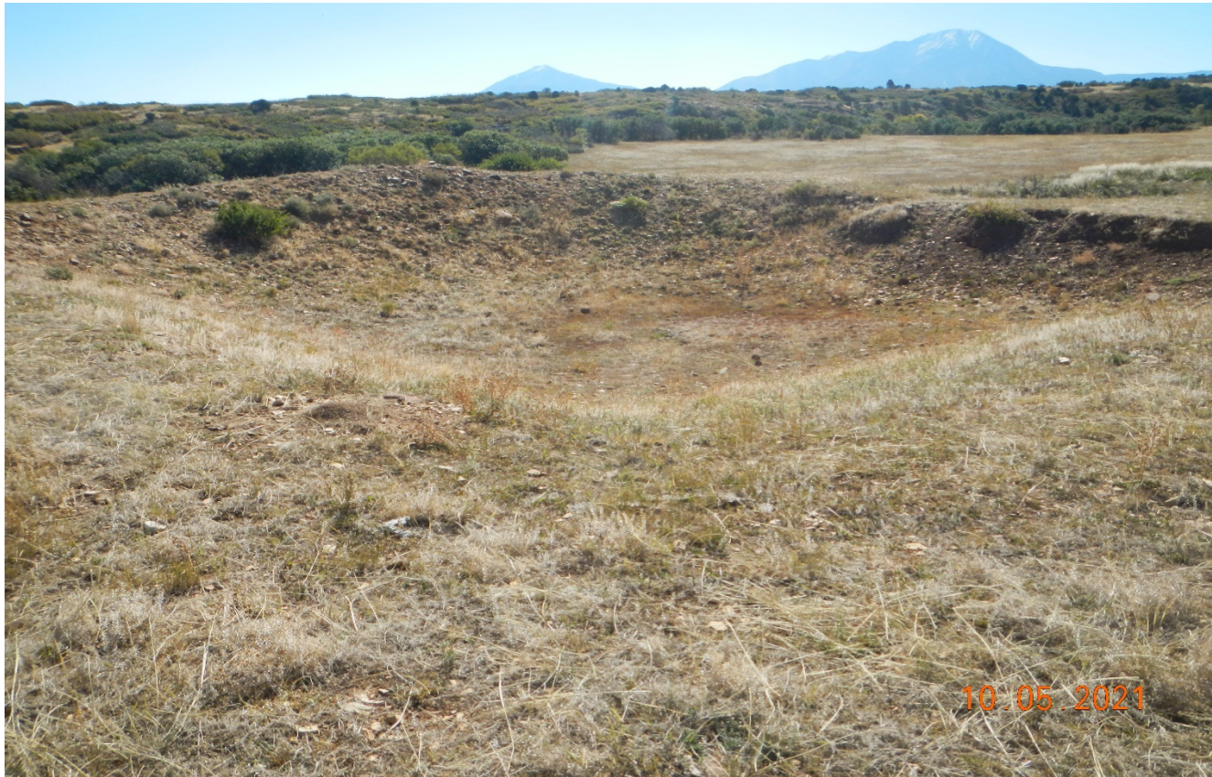
Photo 4. Facing southeast toward the pit which is approximately 100'x100' in size.