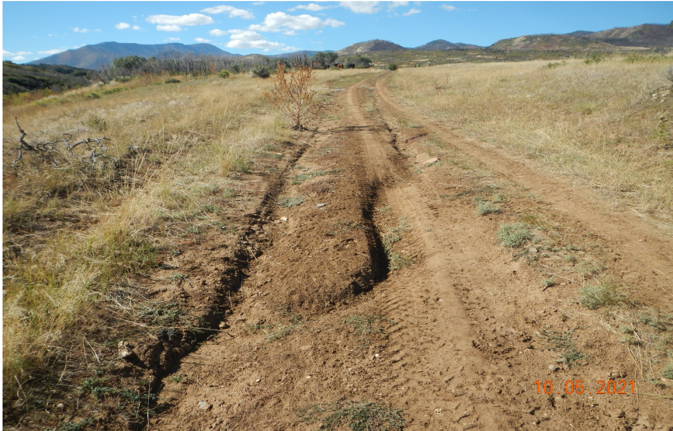
Photo 1. Facing southwest along the former access road which appears to be mostly pre-existing. There is erosion occurring along areas of the road which need to be stabilized. Previous corrective action was not performed.