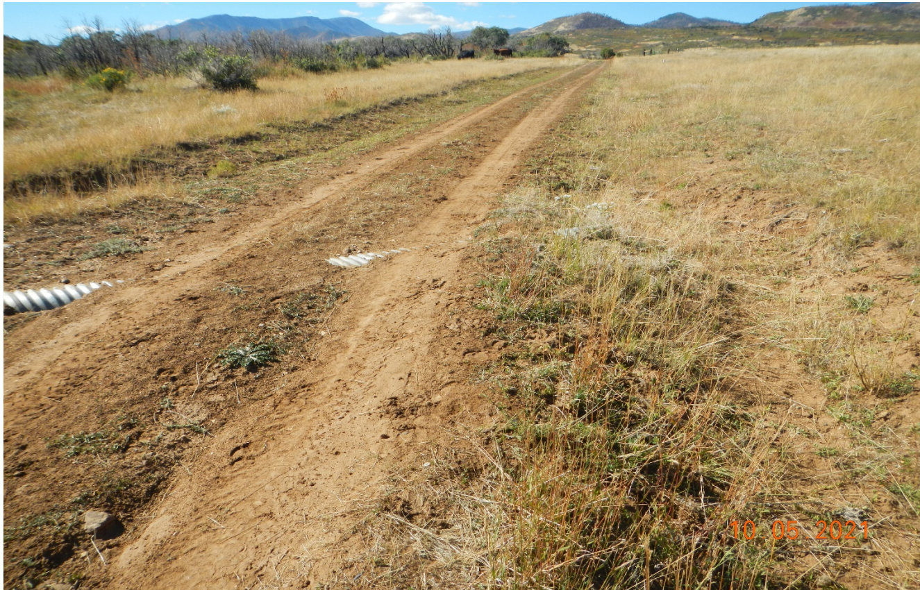
Photo 2. The culvert installed along the access road is not maintained and stormwater is bypassing the culvert. Lat/Long:37.50521,-105.07444.