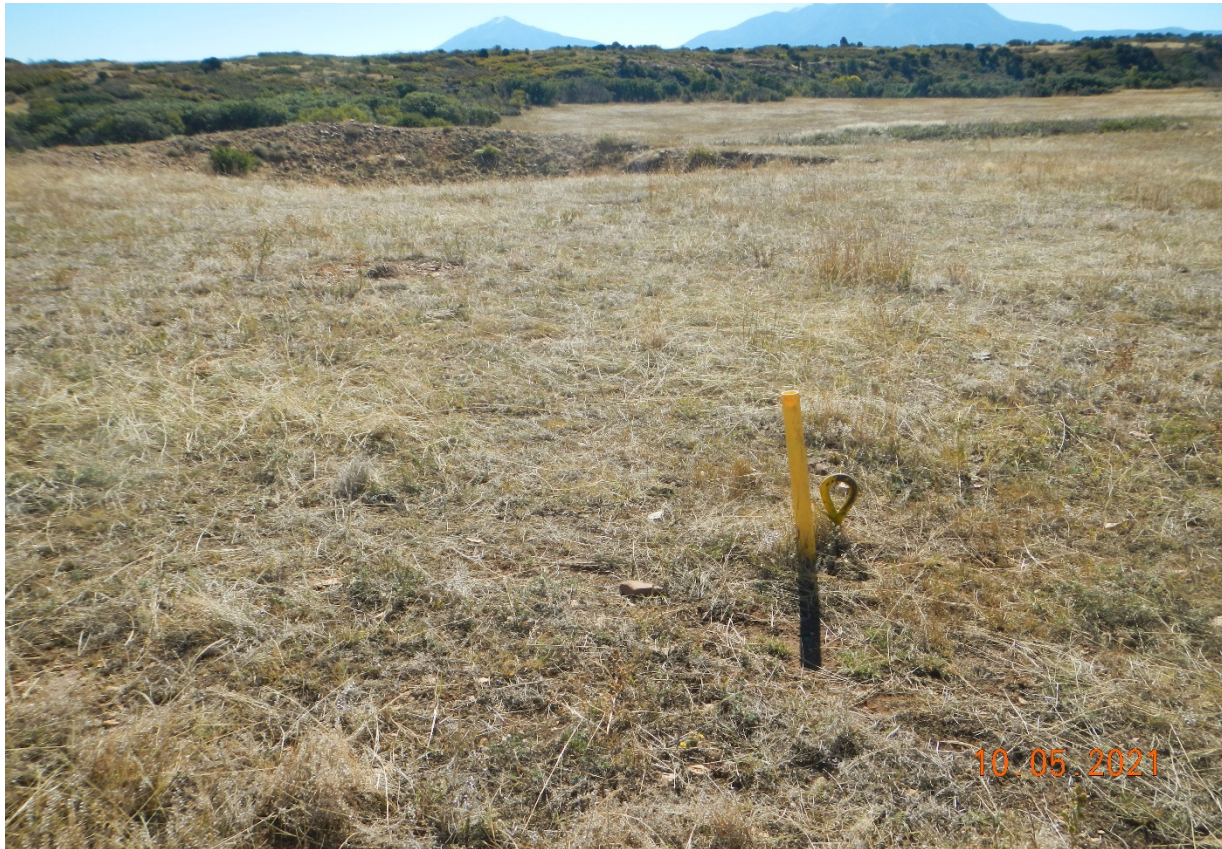
Photo 3. Facing southeast toward the location which was never recontoured and reclaimed per 1004 Rules. There are four guyline anchors that remain and the pit was not backfilled and reclaimed.