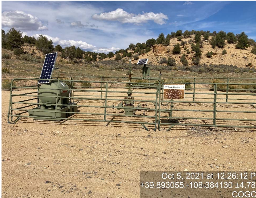
Location/well head signage is not legible