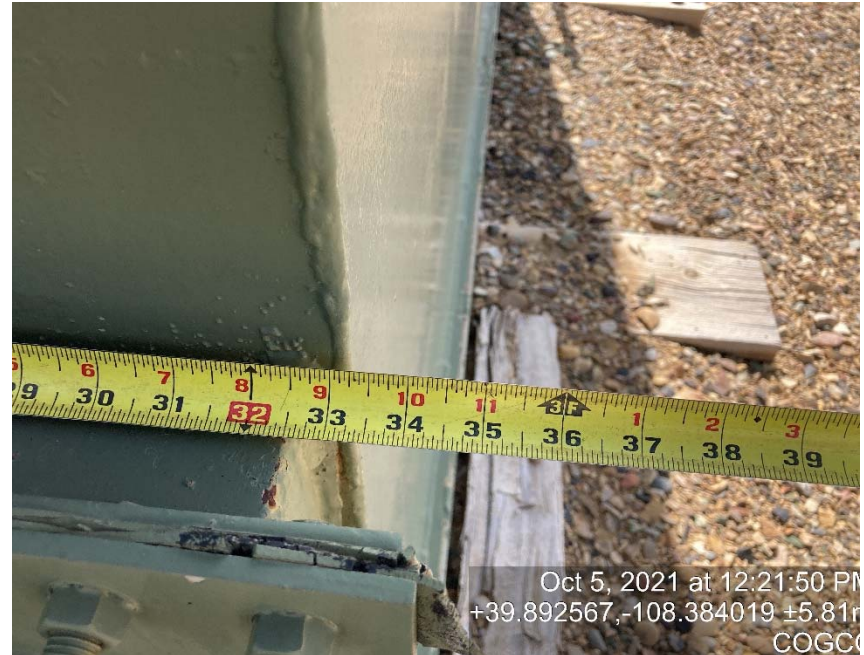
Glycol vessel dimensions