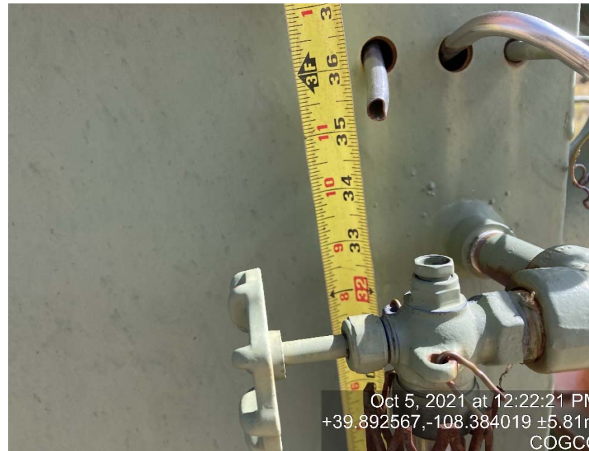
Glycol vessel dimensions