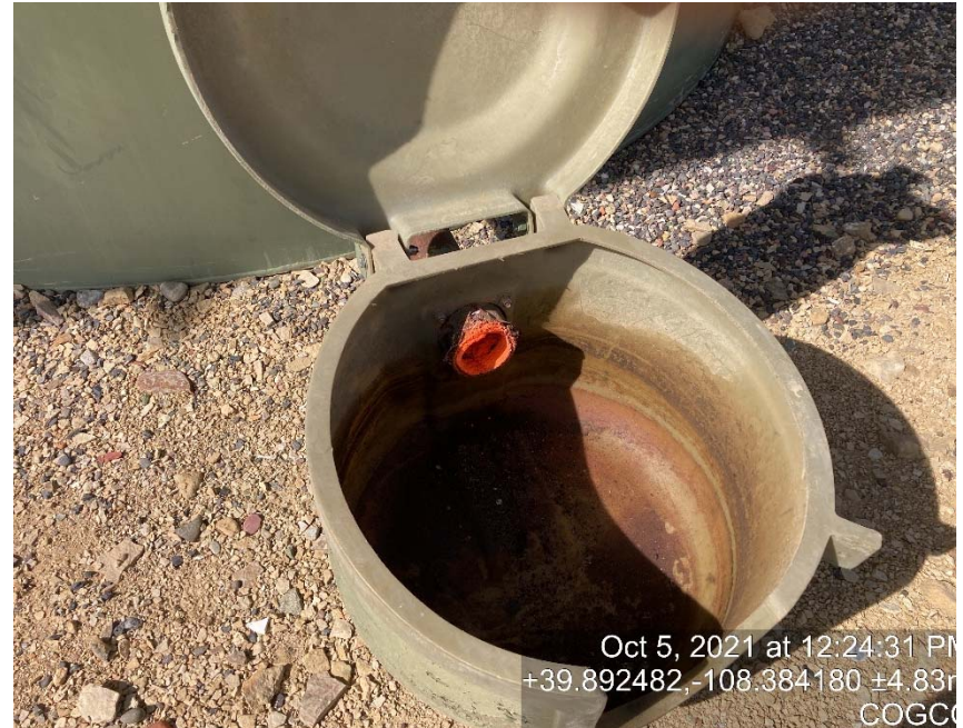
Lack of bull plug/cap on one load out line