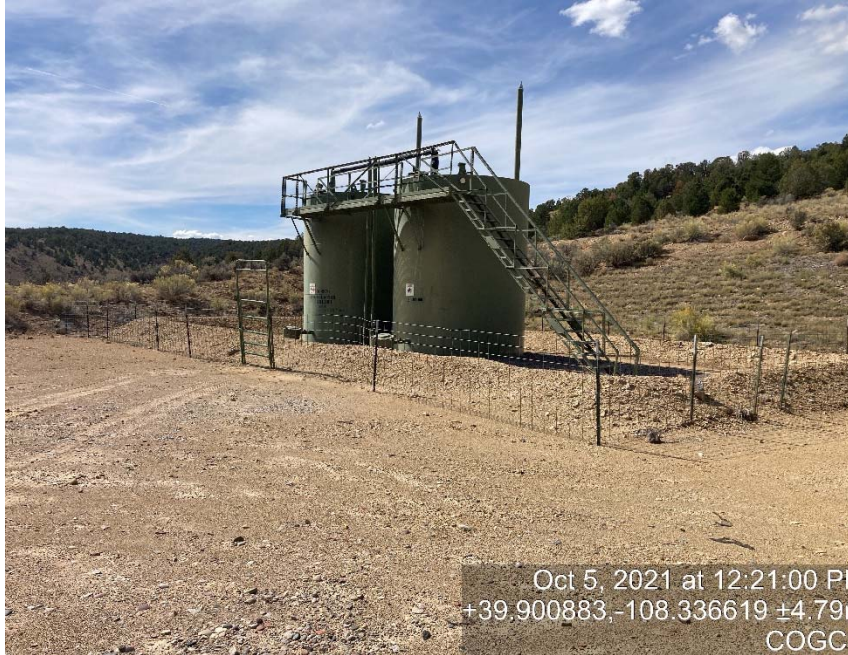
Location/ lack of battery signage