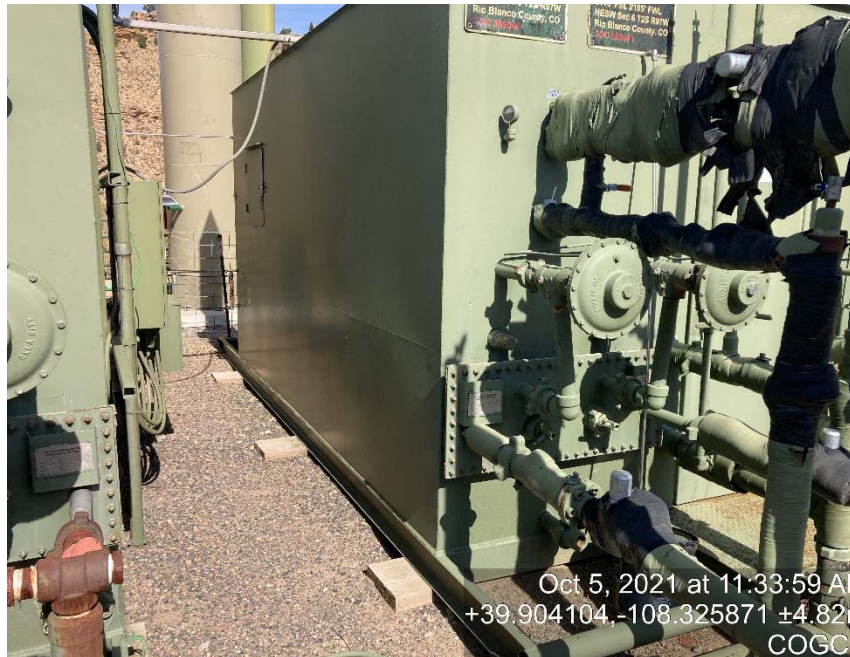
Lack of labeling on glycol vessel