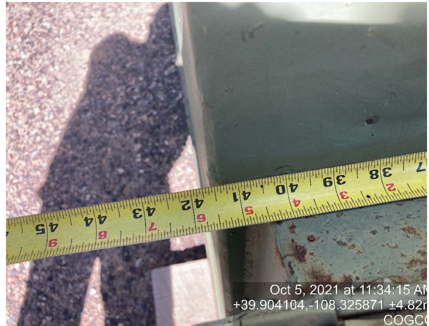
Glycol vessel dimensions