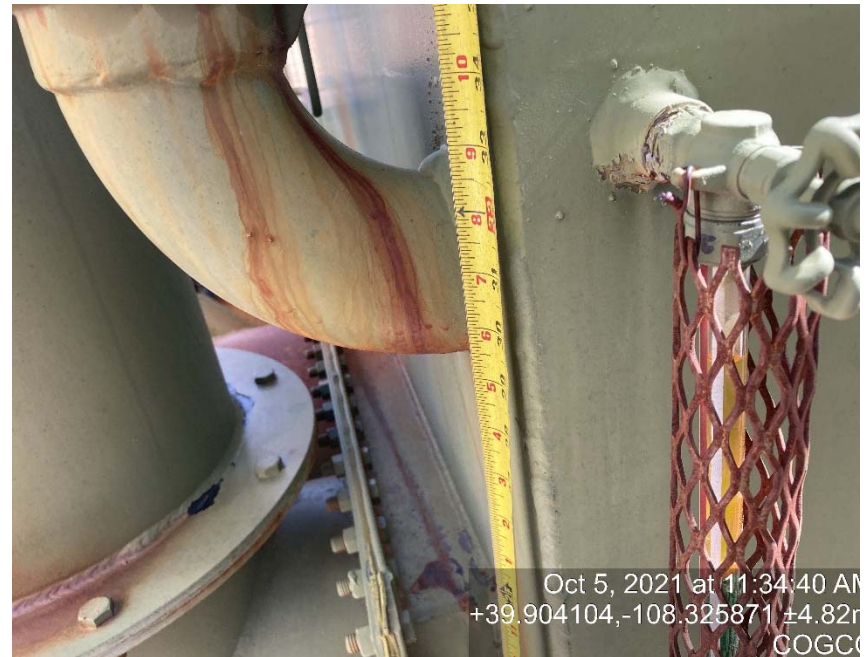
Glycol vessel dimensions