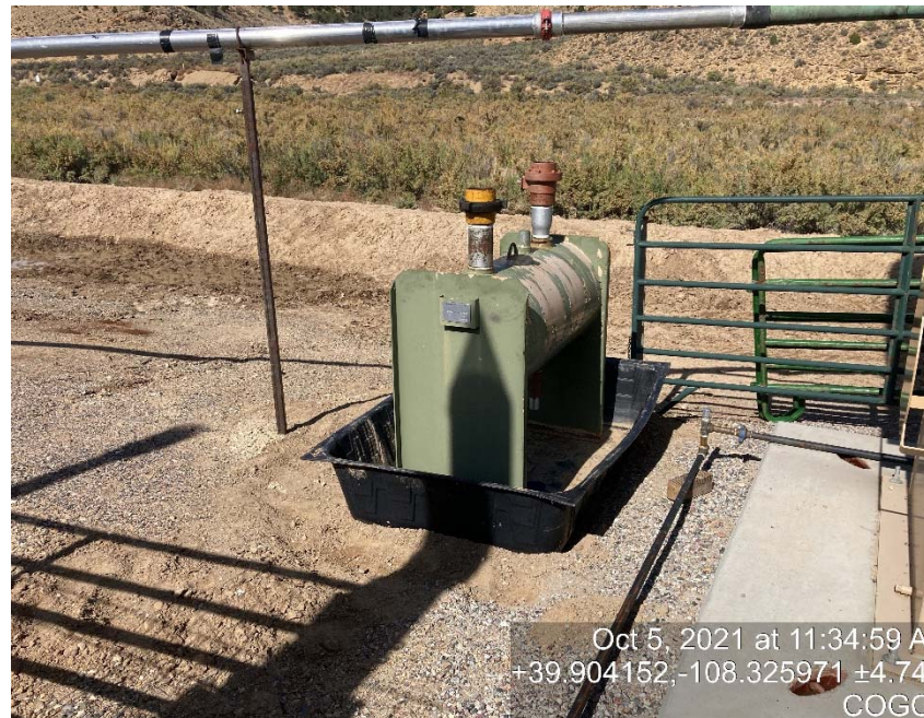
Unused knock out vessel