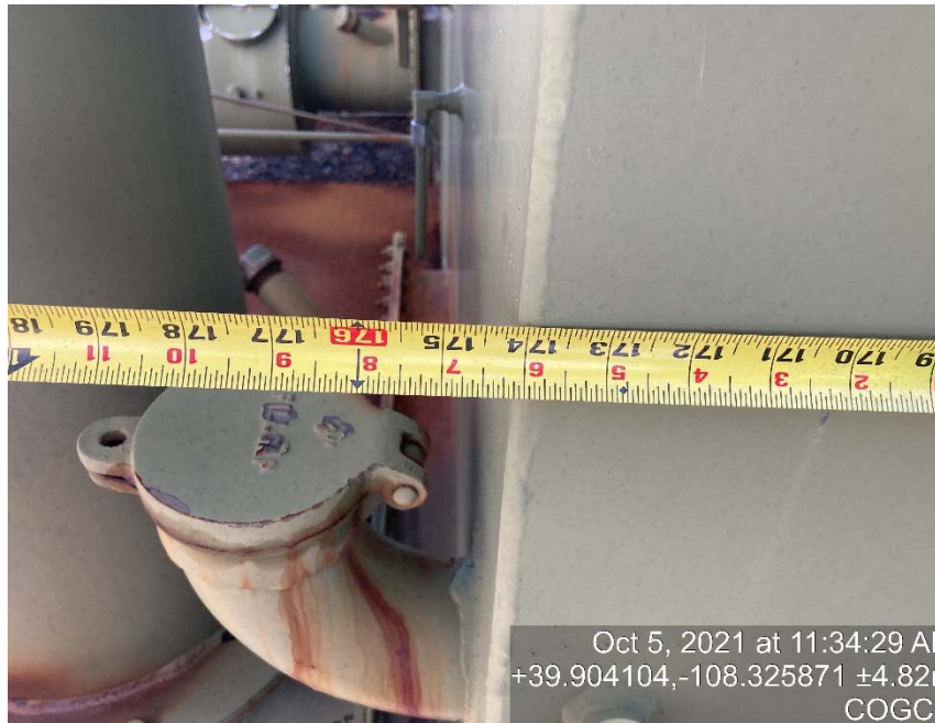
Glycol vessel dimensions