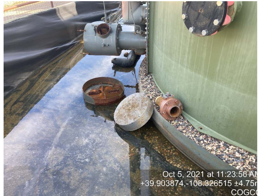
Debris and components to burner assembly