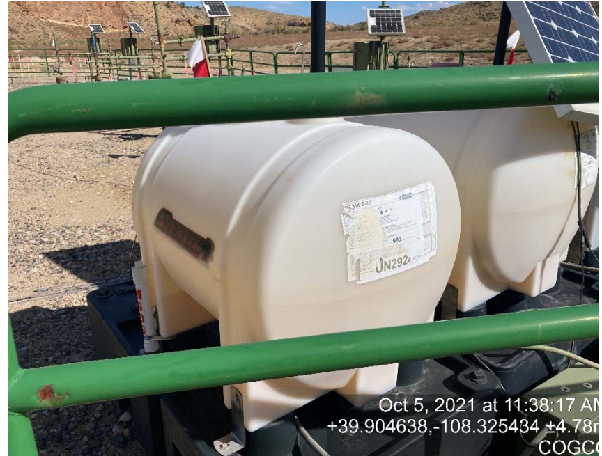
Label is not legible