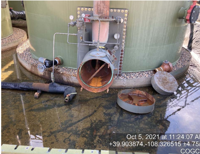
Open tank burner for wildlife to enter/debris