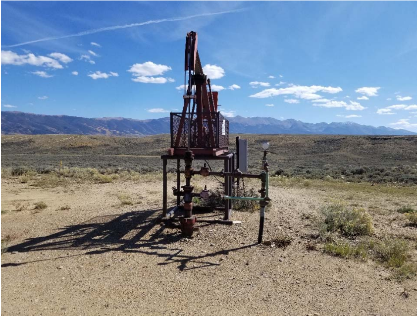
Photo 1. Overview of location taken facing southeast.