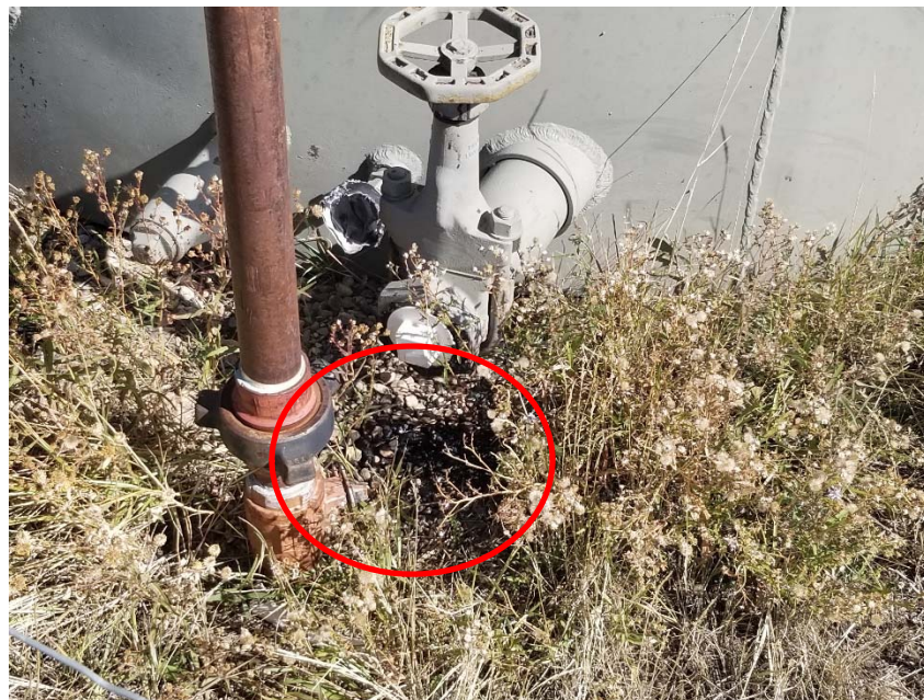
Photo 4. Stained soil on location.