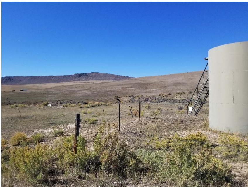
Photo 1. Overview of location taken facing southwest.