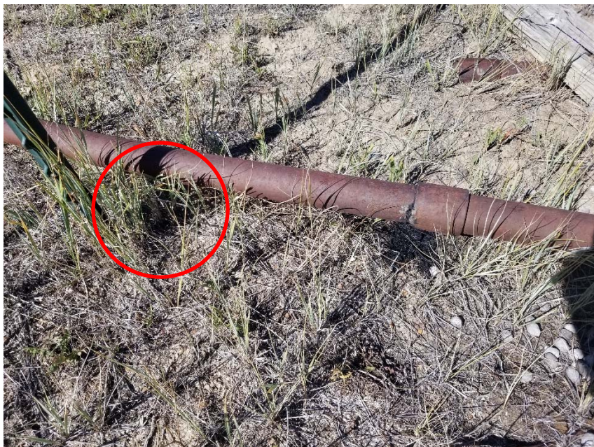
Photo 3. Stained soil on location.