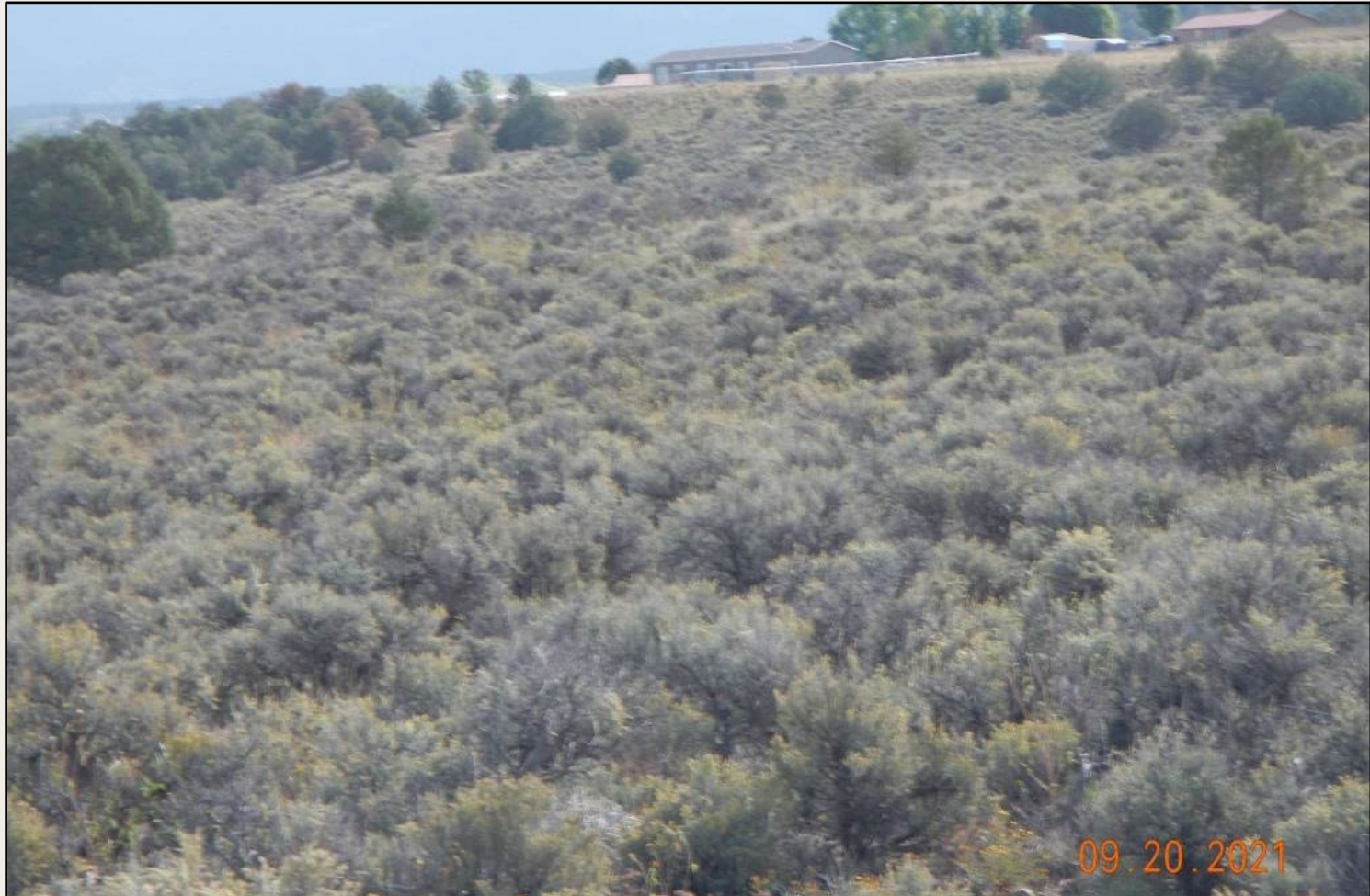
Photo 6. View of reference area comprised of sagebrush shrubland with snakeweed, James galleta, buckwheat, and penstemons in the understory.