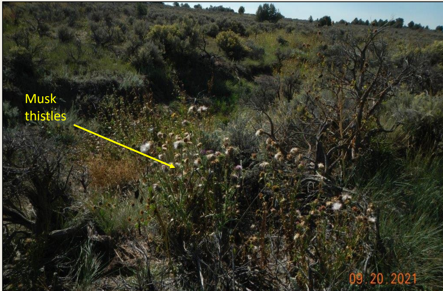
Photo 3. View of seeding musk thistles within the southern project area, need to be removed. Approximately 30 individuals observed.