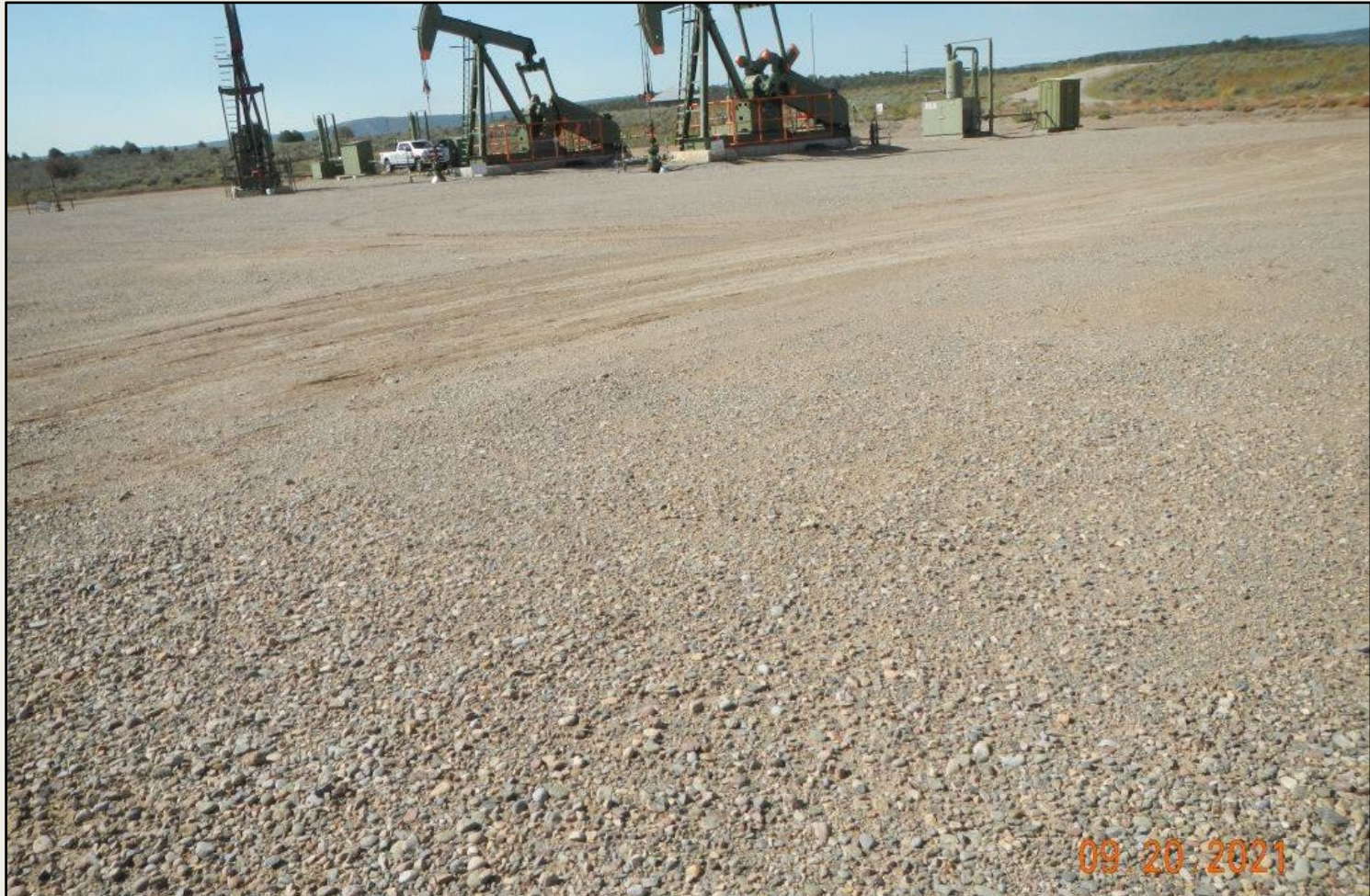
Photo 1. View of the project area from the northeastern corner facing center.