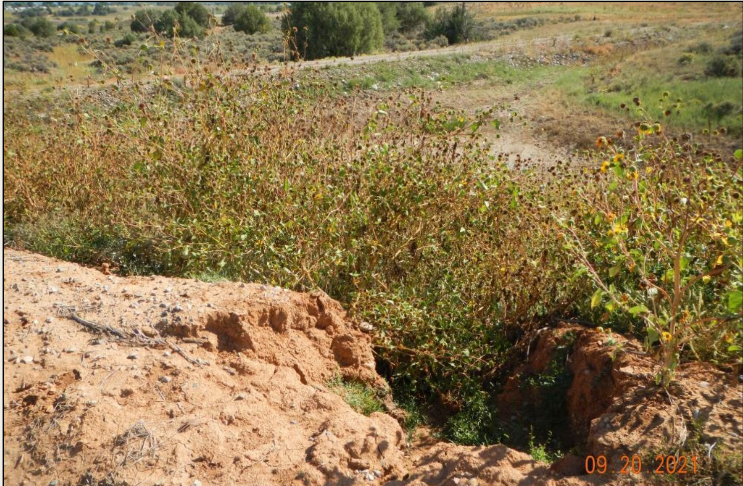
Photo 4. View of area in the eastern fill slope where stormwater erosion (approx. 3 ft wide and 2ft deep channel) is occurring due to oversaturation in the slope. Stabilization is needed here.