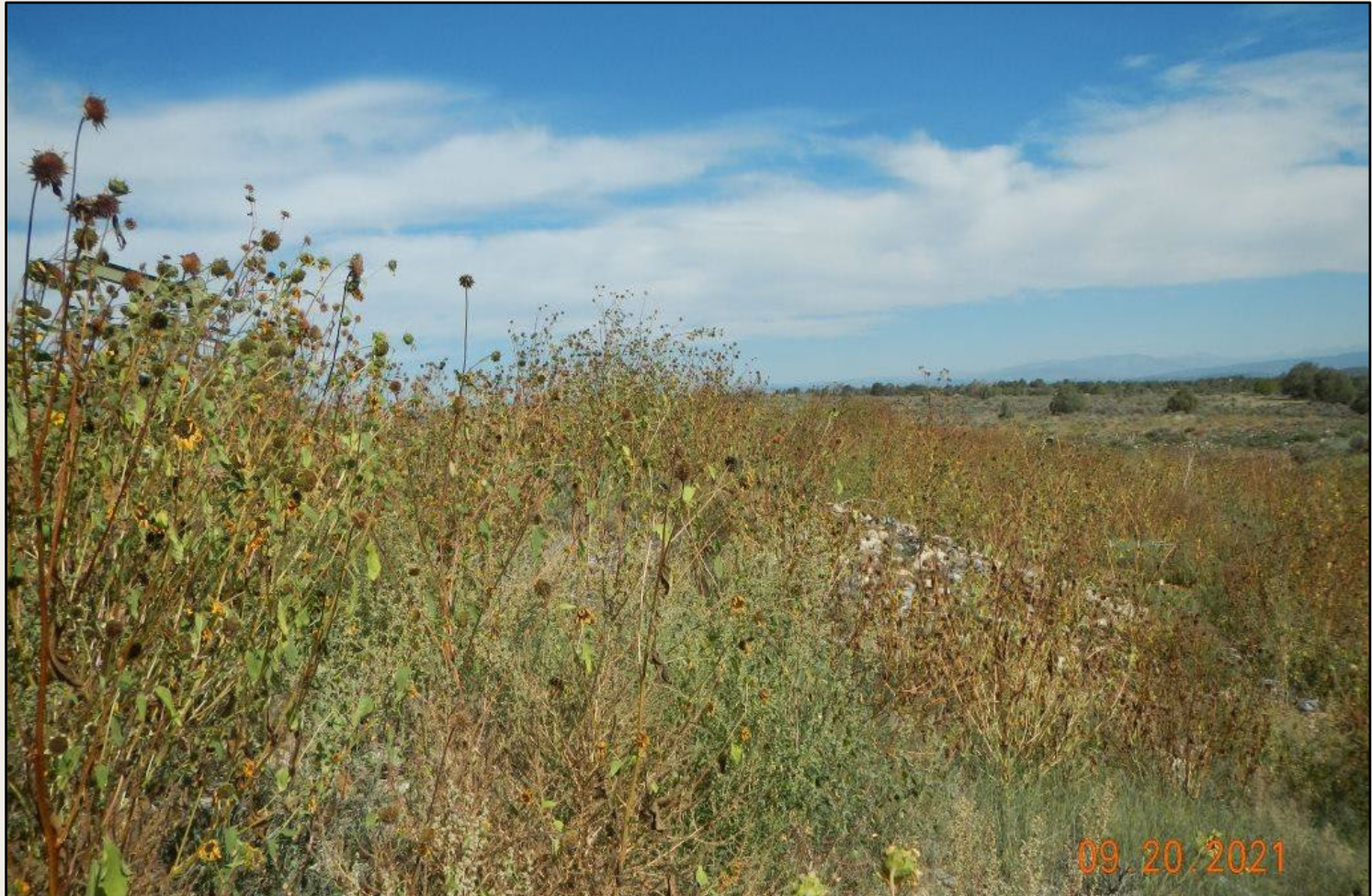
Photo 2. View of the eastern project area from the southeastern corner facing northward. Revegetation is progressing with smooth brome, western wheatgrass, and sunflowers.