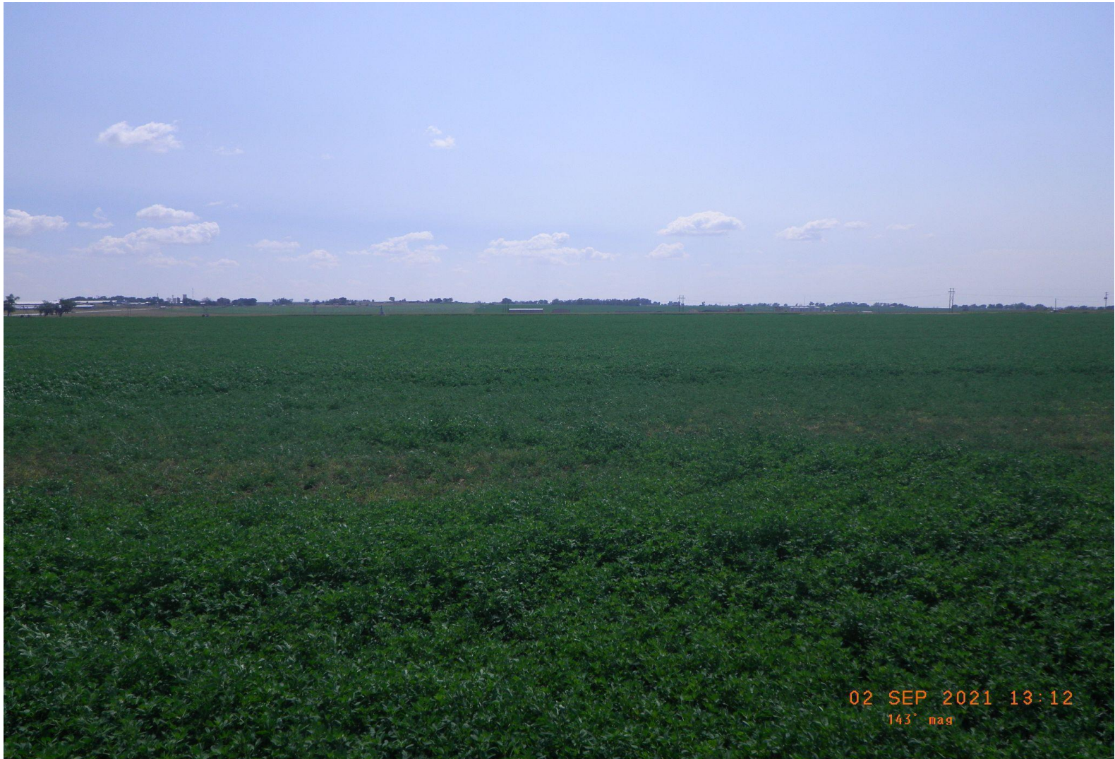
Photo 3. Ground photo taken from north of the well pad looking south down the access road.