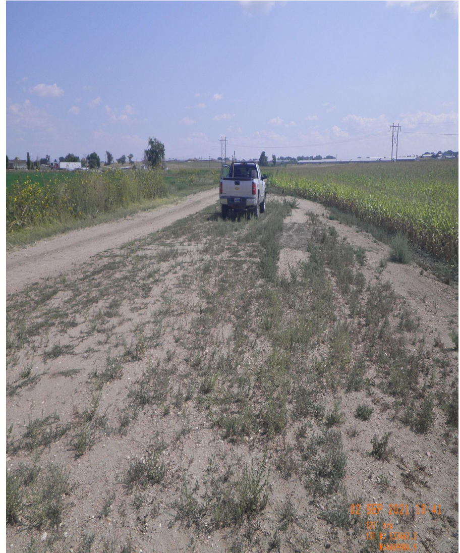
Photo 5. Ground photos taken from the middle of the tank battery, Left photo is facing north and right photo is facing east.