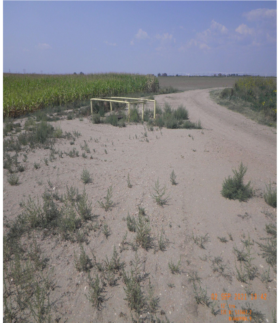
Photo 6. Ground photos taken from the middle of the tank battery, Left photo is facing south and right photo is facing west. Note: tank battery still remains with gravel and dominated by kochia.