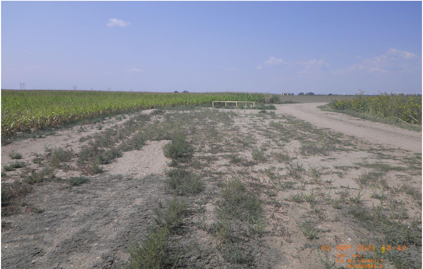
Photo 4. Tank battery overview photo taken from the southern edge of the tank battery looking west. Note: Equipment in background is not associated with oil and gas operations.