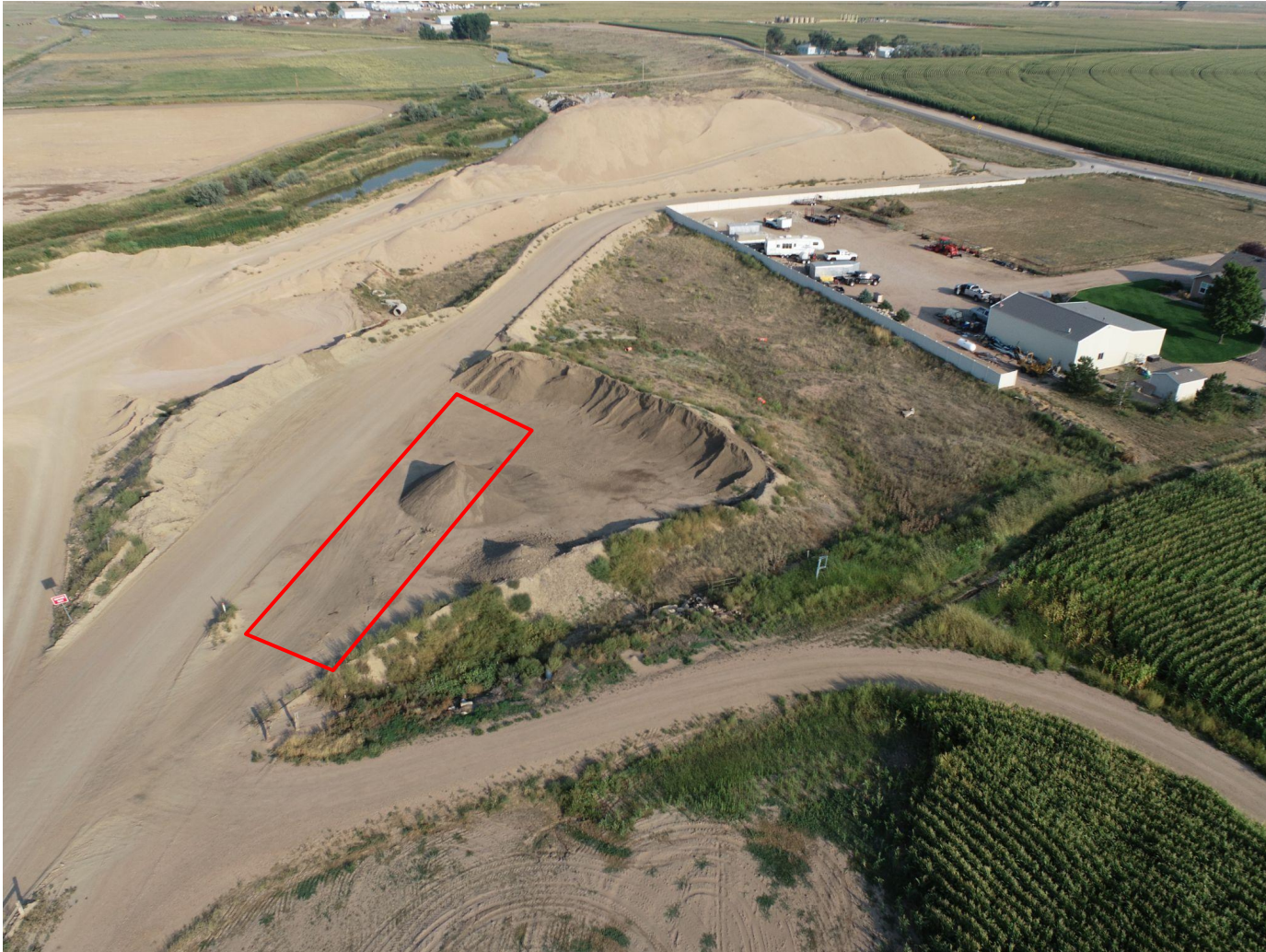
Photo 5. Close-up photo of tank battery area taken northwest of tank battery, looking southeast using a drone. Photo shows that the tank battery location is now being used for storing soil/gravel.