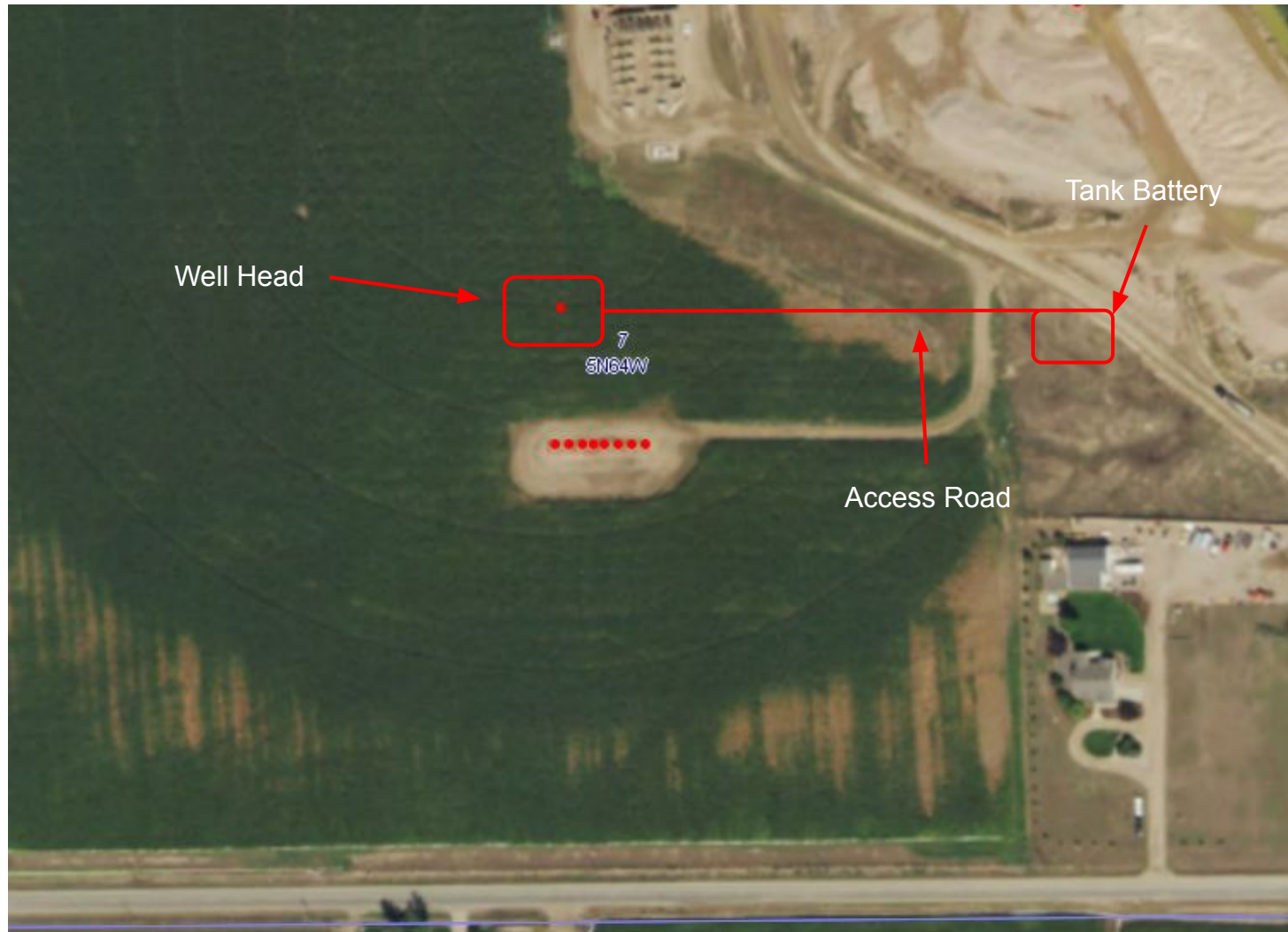
Photo 1. 2019 aerial imagery shows the well head, tank battery, and associated access road (north is up).