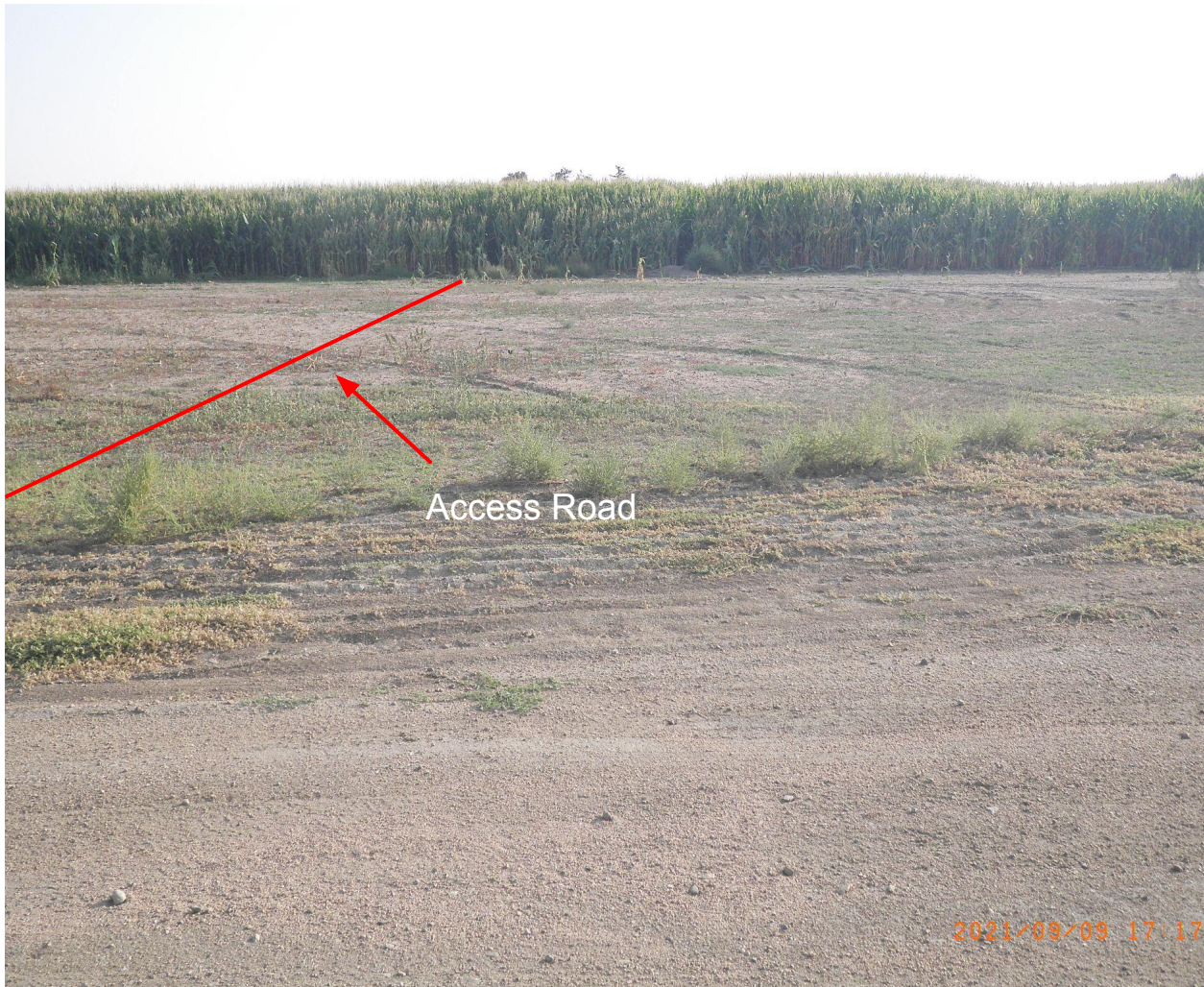
Photo 4. Looking southwest at the well head access road. The corn height was consistent with the reference area. The unseeded portion of the access road was recontoured and stabilized.