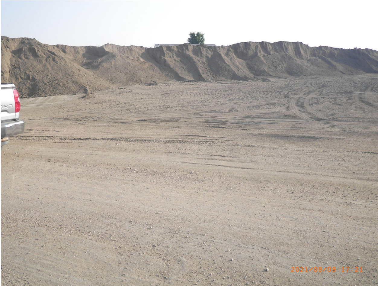
Photo 6. Looking southwest at the tank battery location. The area is now being used to store soil/gravel.