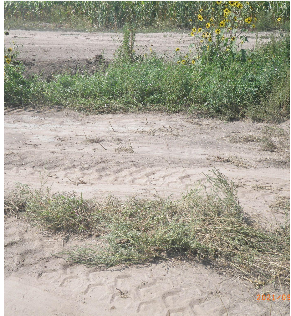
Photo 6. South and west photos taken at ground level from the middle of the tank battery.