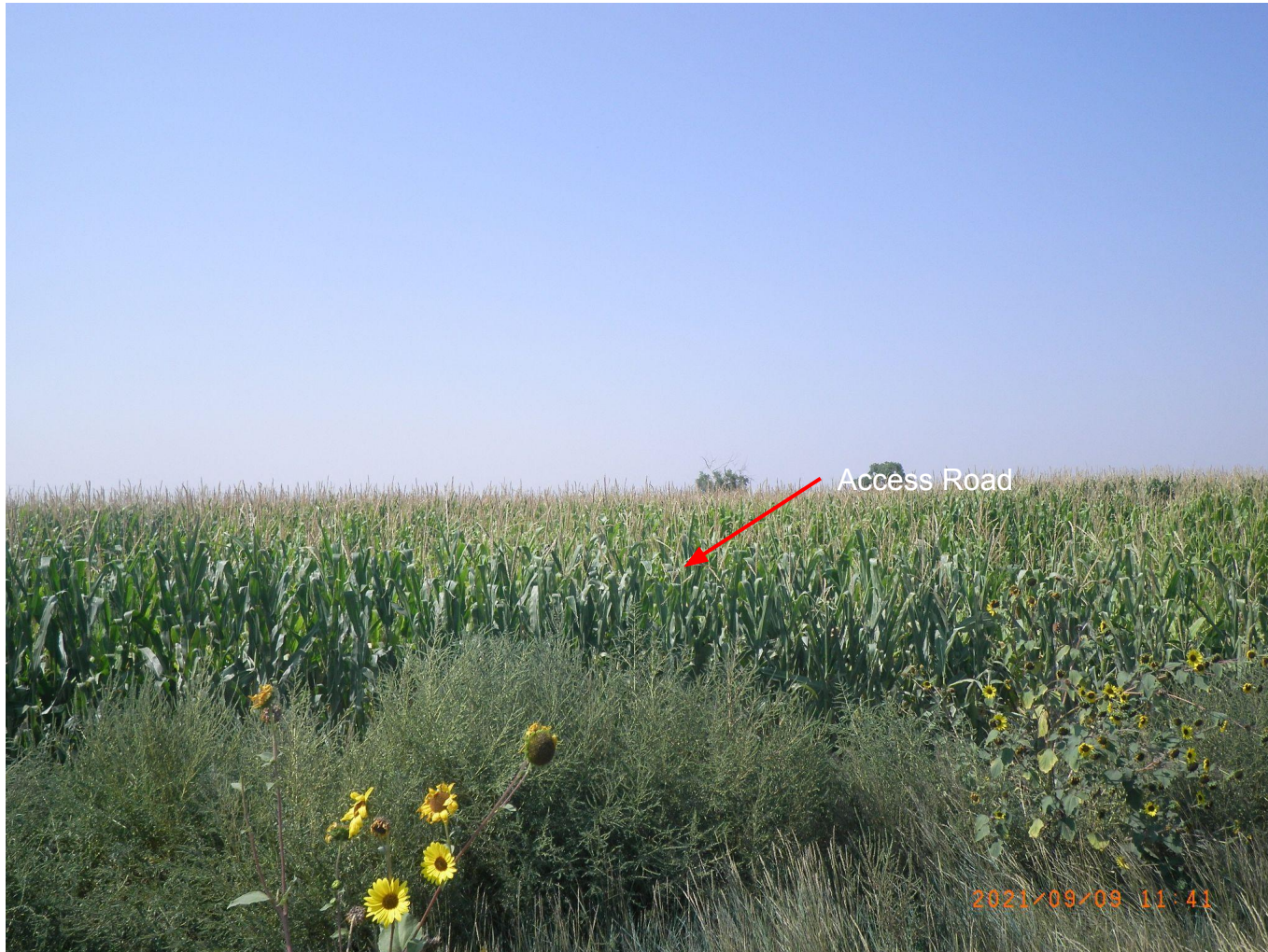
Photo 3. Ground photo of well head access road from highway, looking west. Note: the weeds in the front of the picture are associated with the highway/crop field edge, not oil and gas operations.