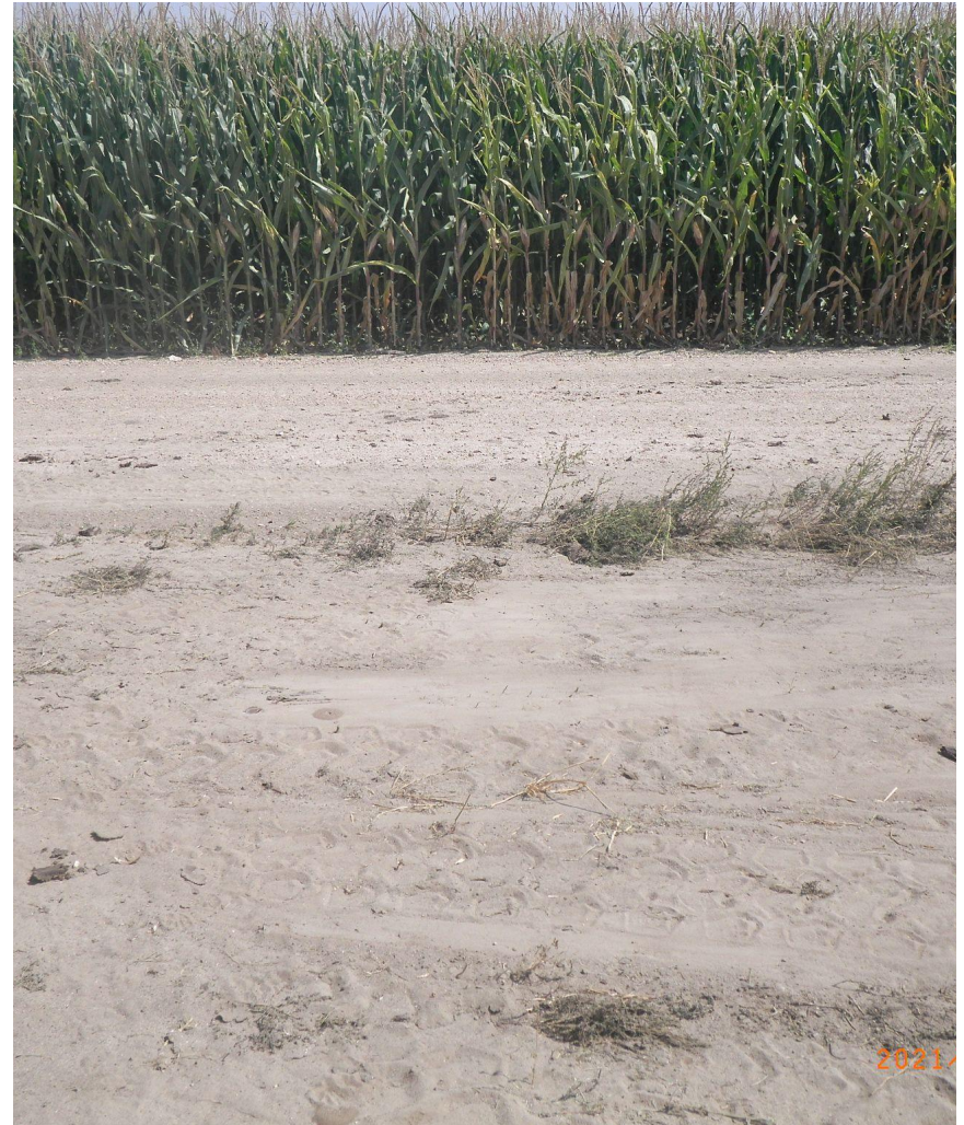
Photo 5. North and East photos taken at ground level from middle of tank battery.