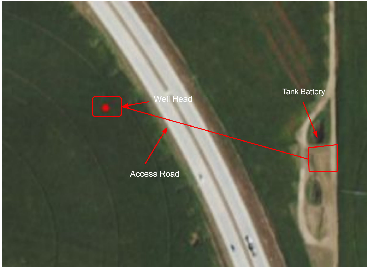
Photo 1. 2019 aerial imagery shows the well head, tank battery and associated access road (north is up). Note: the access road was built prior to the highway getting built.