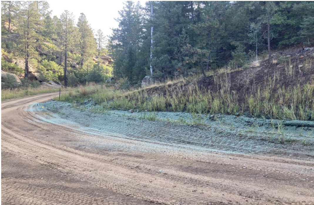
Installed and repaired required BMPs per Rule 1002.f.(2)C