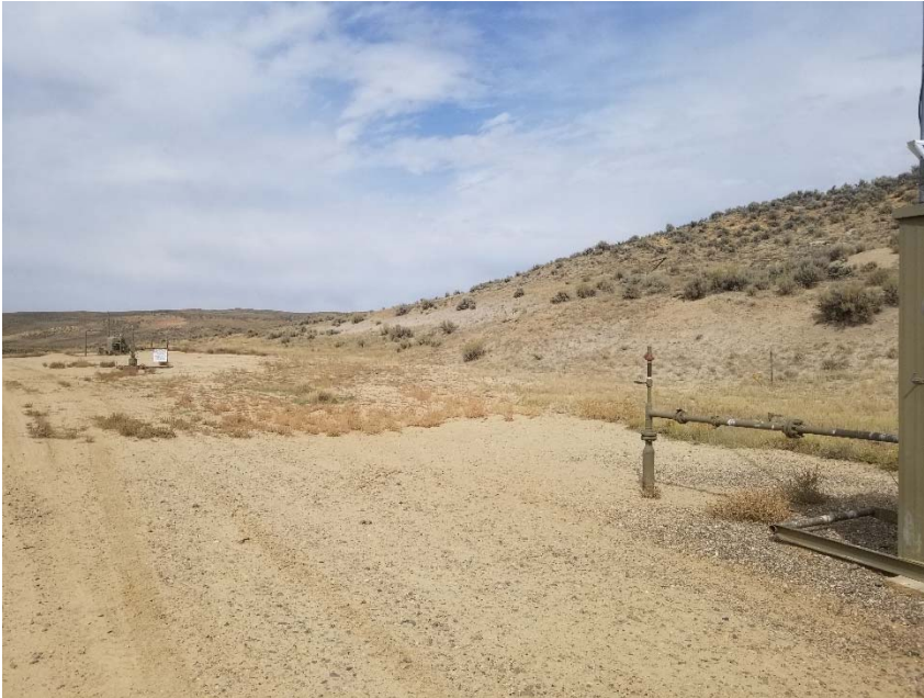
Photo 1. Overview of location taken facing north. Annual weeds on location.