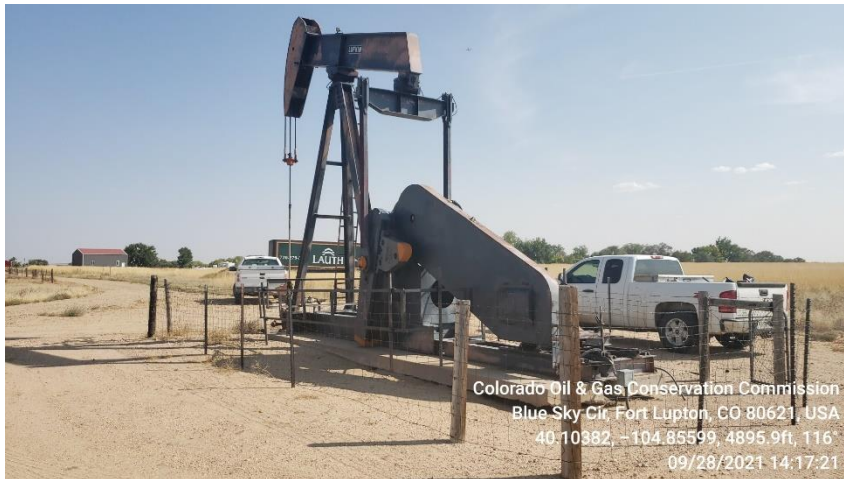
Photo 3 Pump Jack