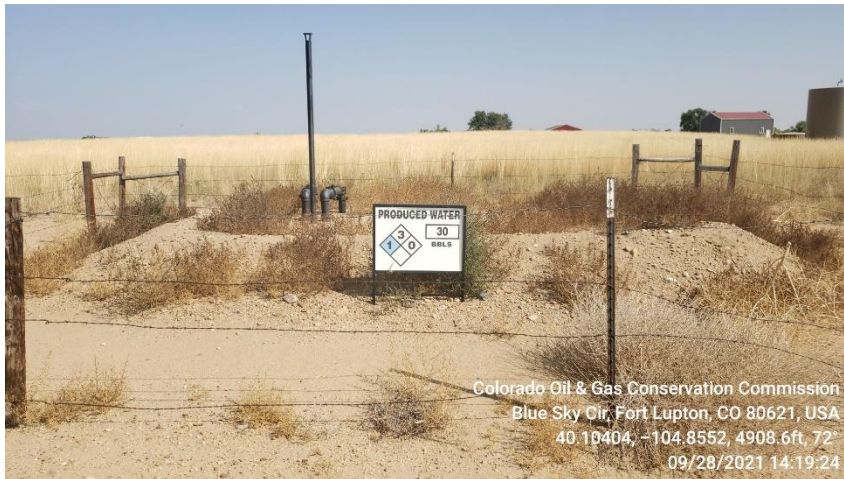
Photo 9 PW vessel