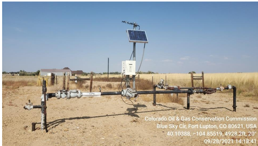
Photo 7 Gas Meter Run