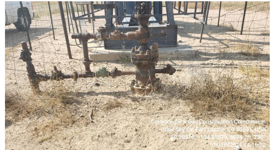
Photo 1 weeds growing under WH sign