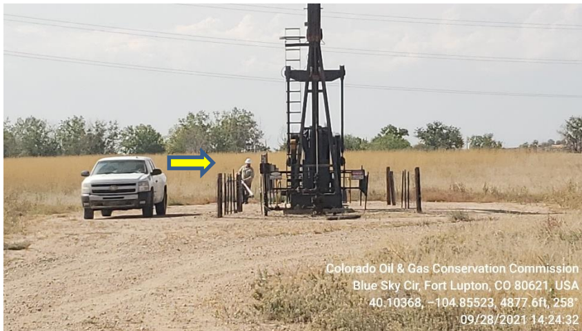
Photo 5 lease operator cutting weeds