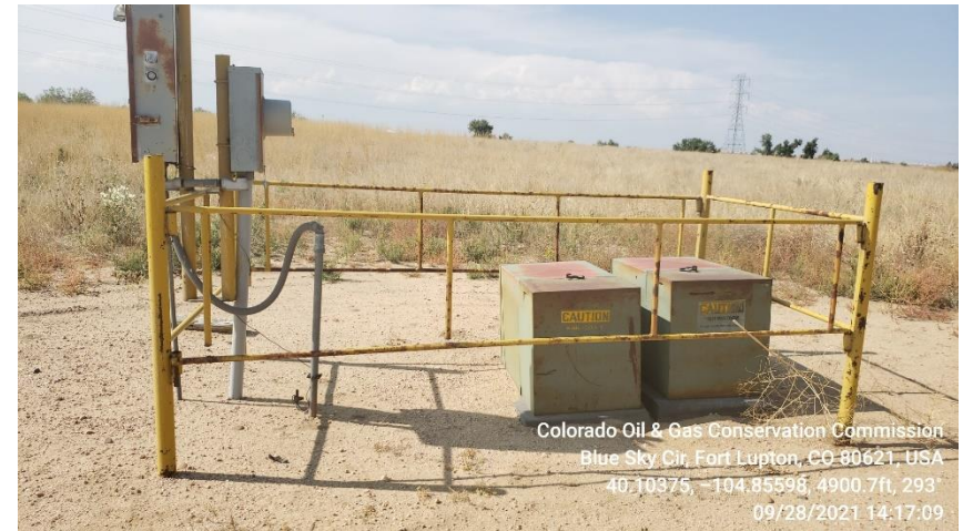
Photo 4 ancillary equipment