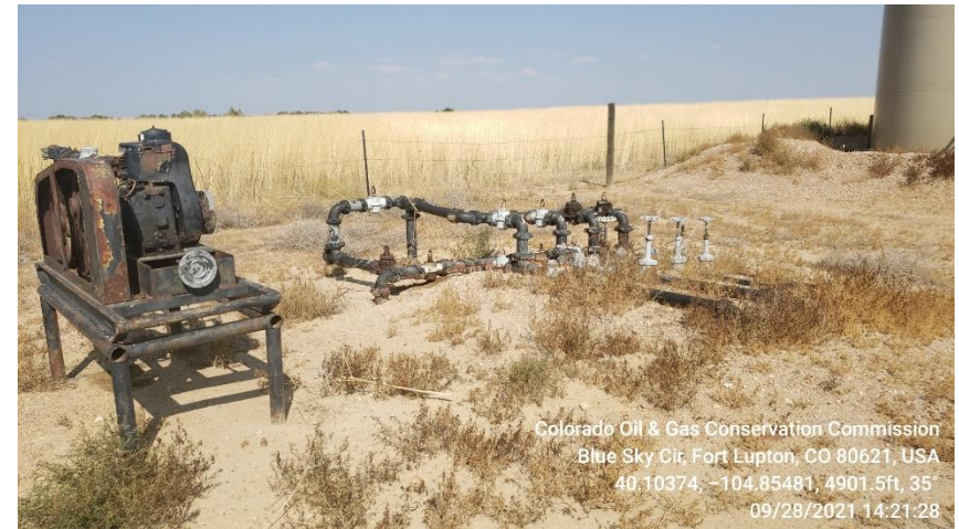
Photo 10 Aux motor and flow line manifold