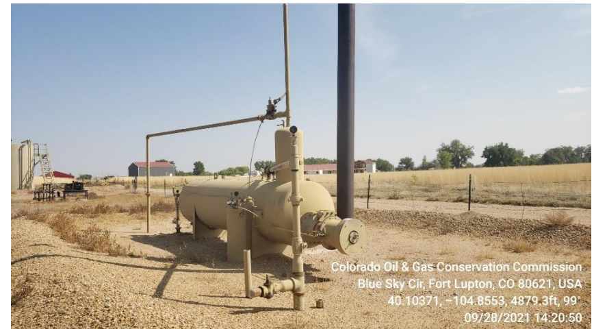
Photo 6 Horizontal Heated Separator