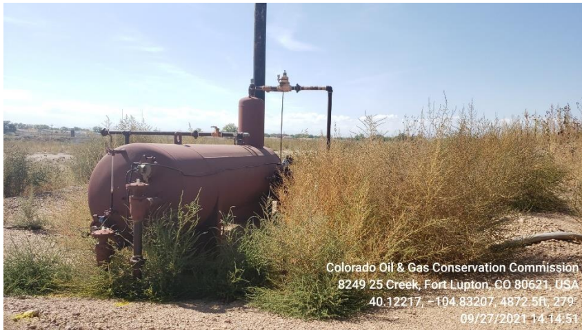
Photo 9 Dead weeds around Horizontal Heated Separator