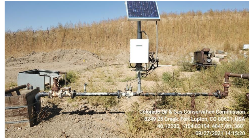
Photo 12 Gas Meter Run