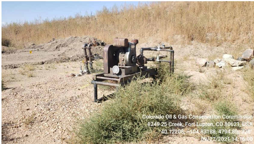
Photo 11 Dead weeds around Aux flow line engine