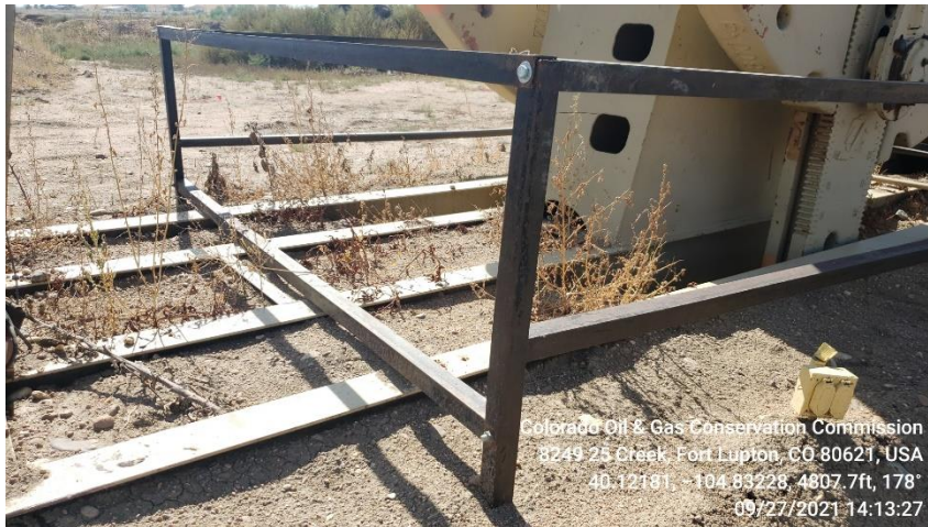
Photo 5 Dead weeds in Pump Jack base