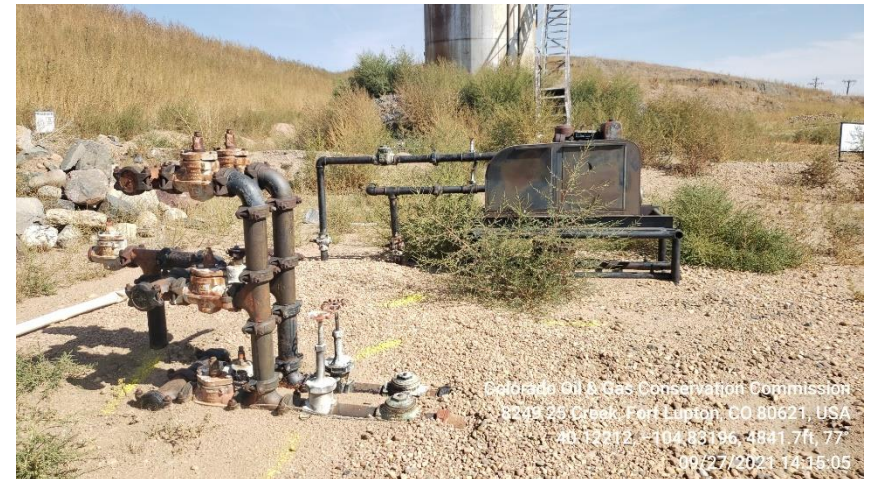
Photo 10 Flow line manifold