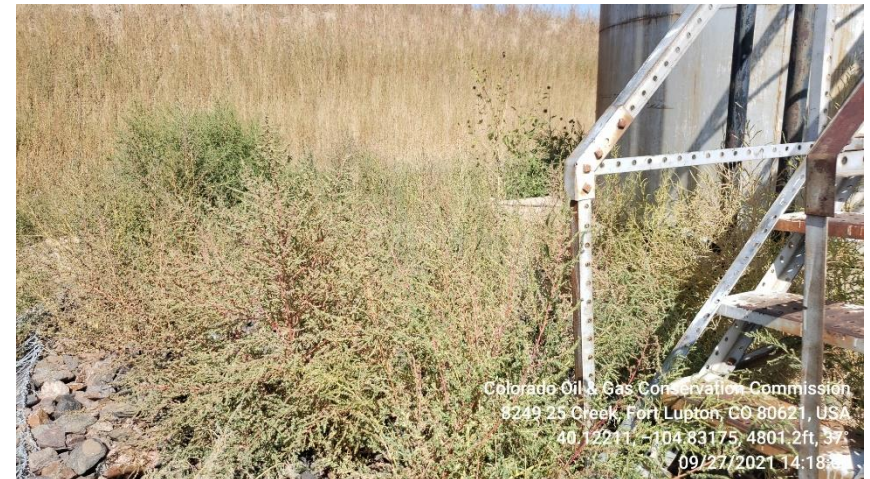
Photo 17 Dead weeds in and on tank battery berm