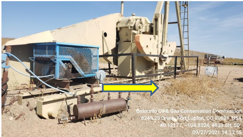
Photo 7 Dead weeds in and around Pump Jack base