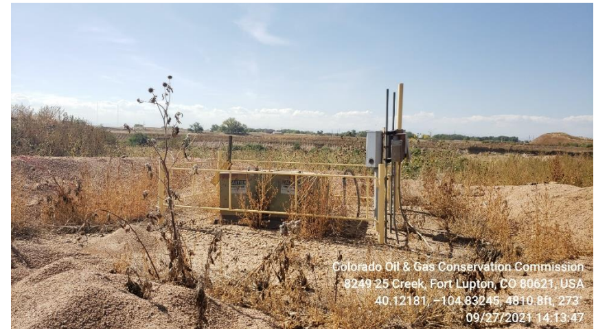
Photo 4 Ancillary equipment