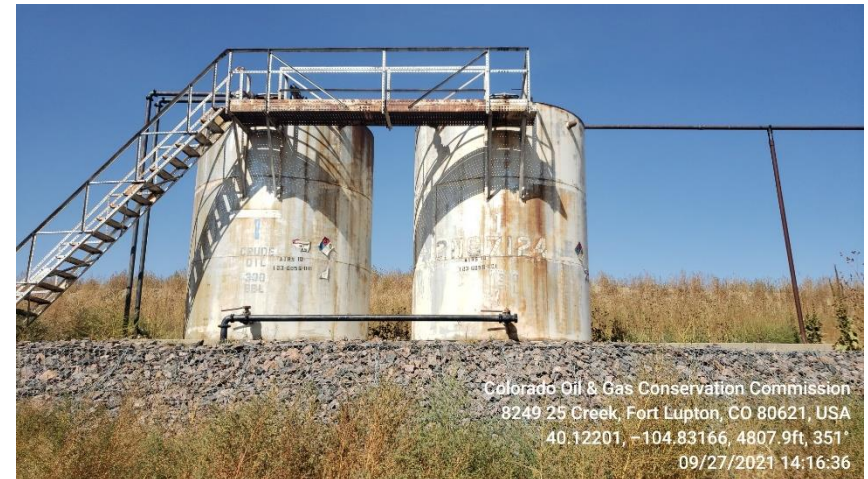
Photo 15 Dead weeds in and on tank battery berm