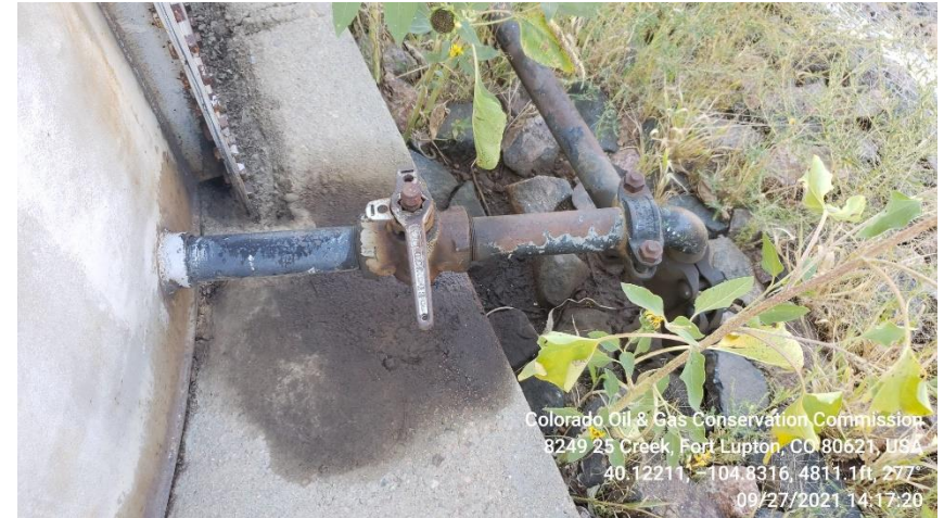
Photo 22 Stained concrete by Crude tank