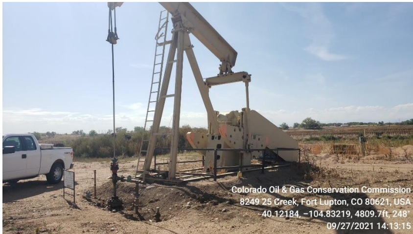
Photo 3 Pump Jack