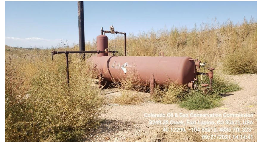
Photo 8 Dead weeds around Horizontal Heated Separator