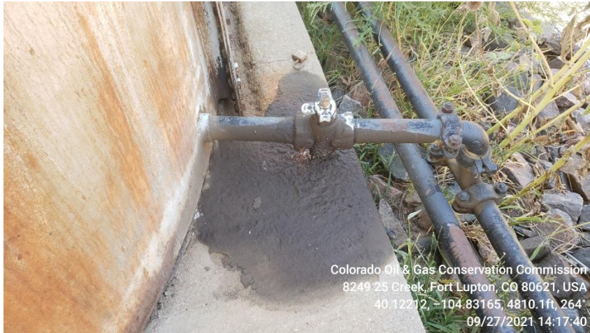
Photo 21 Stained concrete by Crude tank