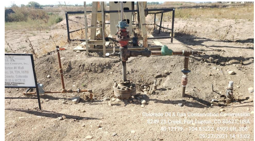
Photo 2 WH