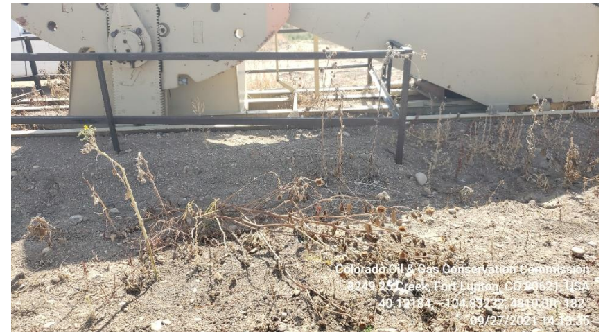
Photo 6 Dead weeds around Pump Jack base