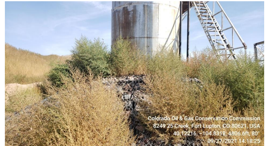
Photo 19 Dead weeds around PW vessel