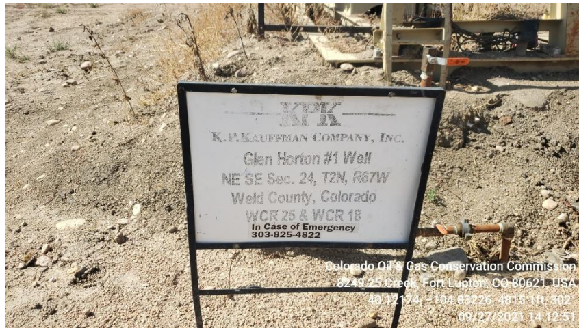
Photo 1 WH sign