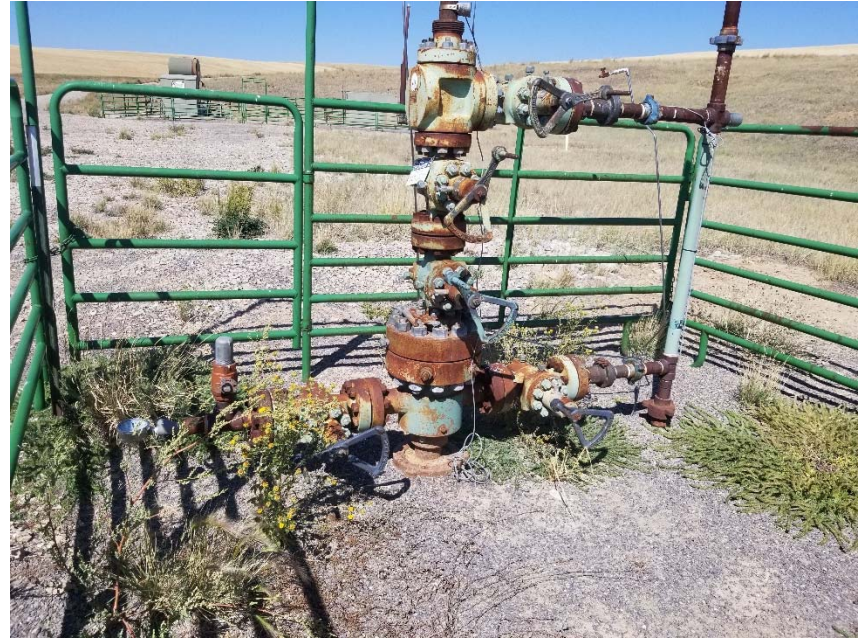
Photo 2. No bradenhead access apparent.