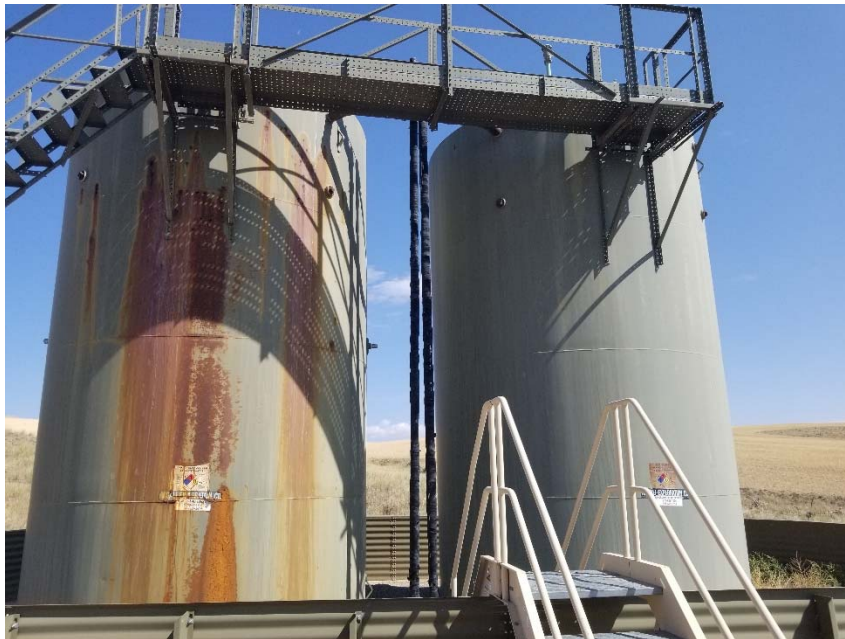
Photo 3. Holes in tank on left side labeled with 300 BBL capacity.