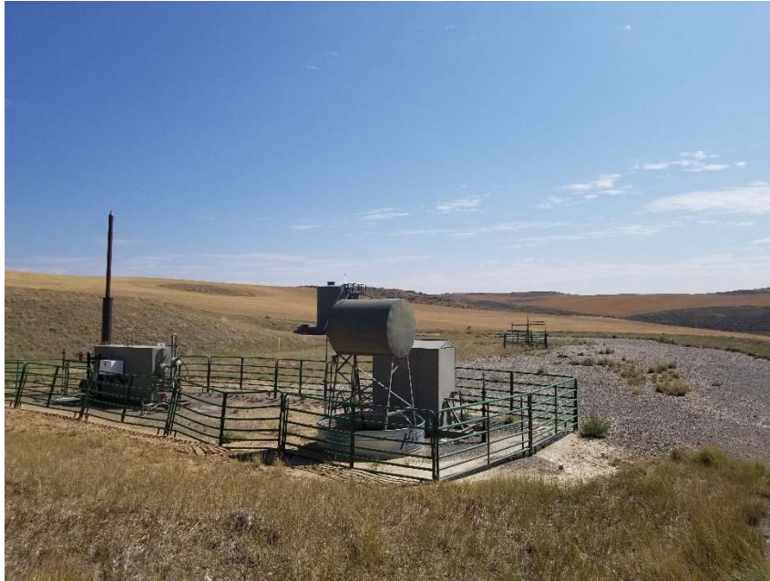
Photo 1. Overview of location taken facing southeast.