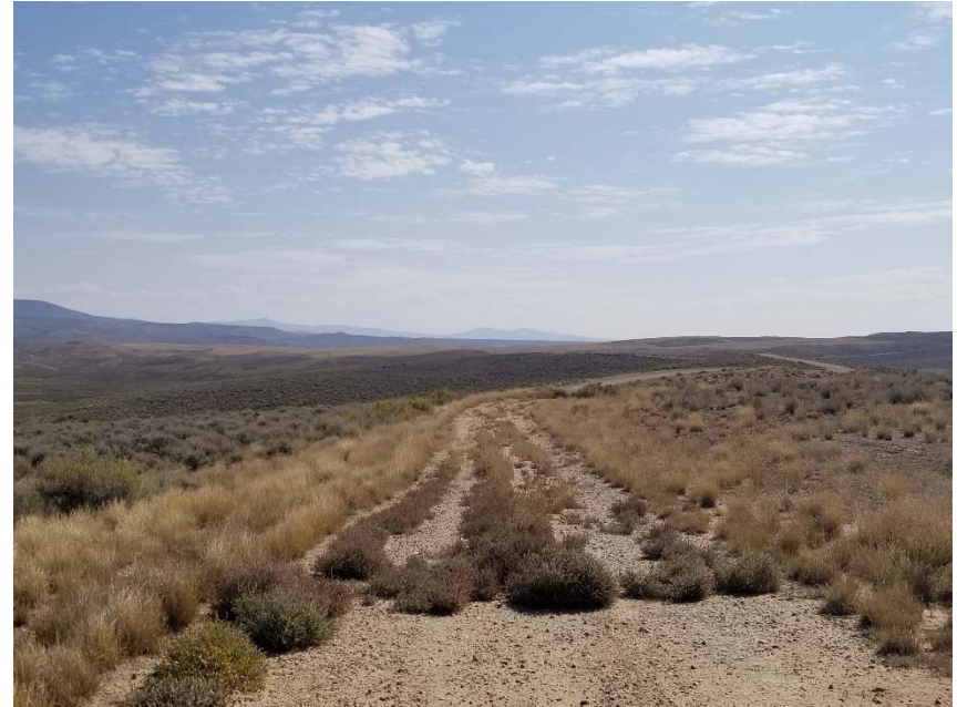
Photo 4. Annual weeds on access road.