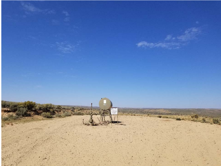
Photo 1. Overview of location taken facing west.