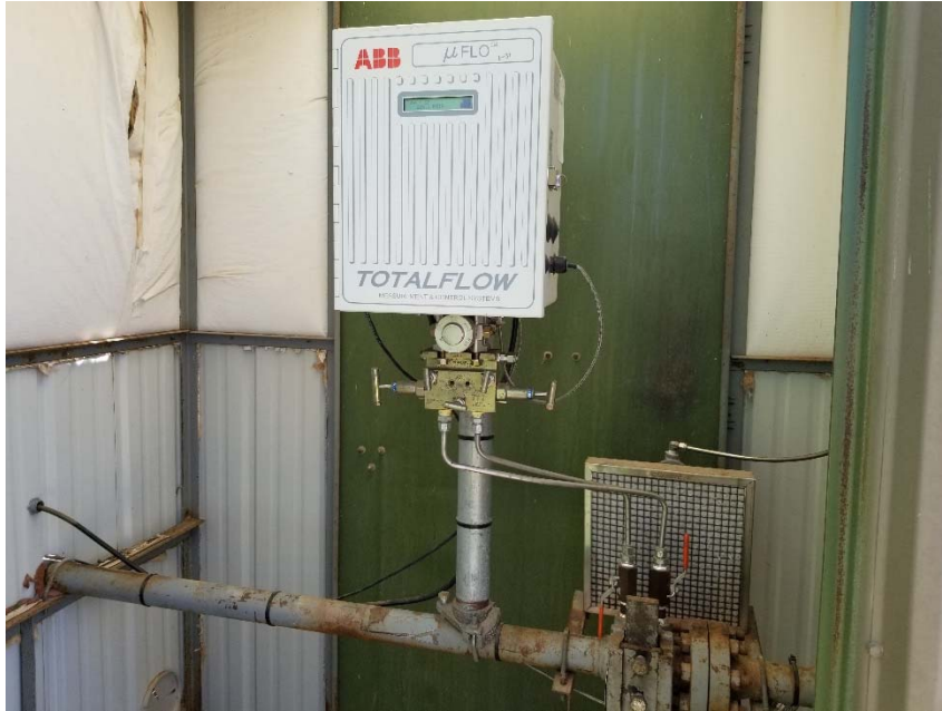
Photo 3. No calibration information in gas meter run.