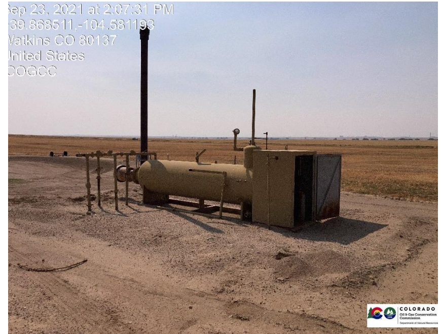
Pic 2 separator