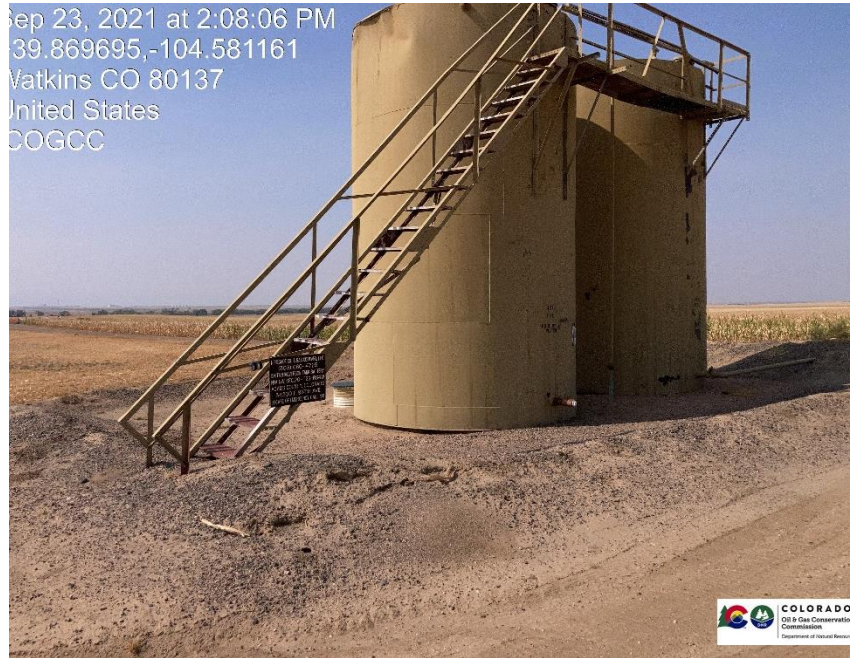
Pic 3 tanks