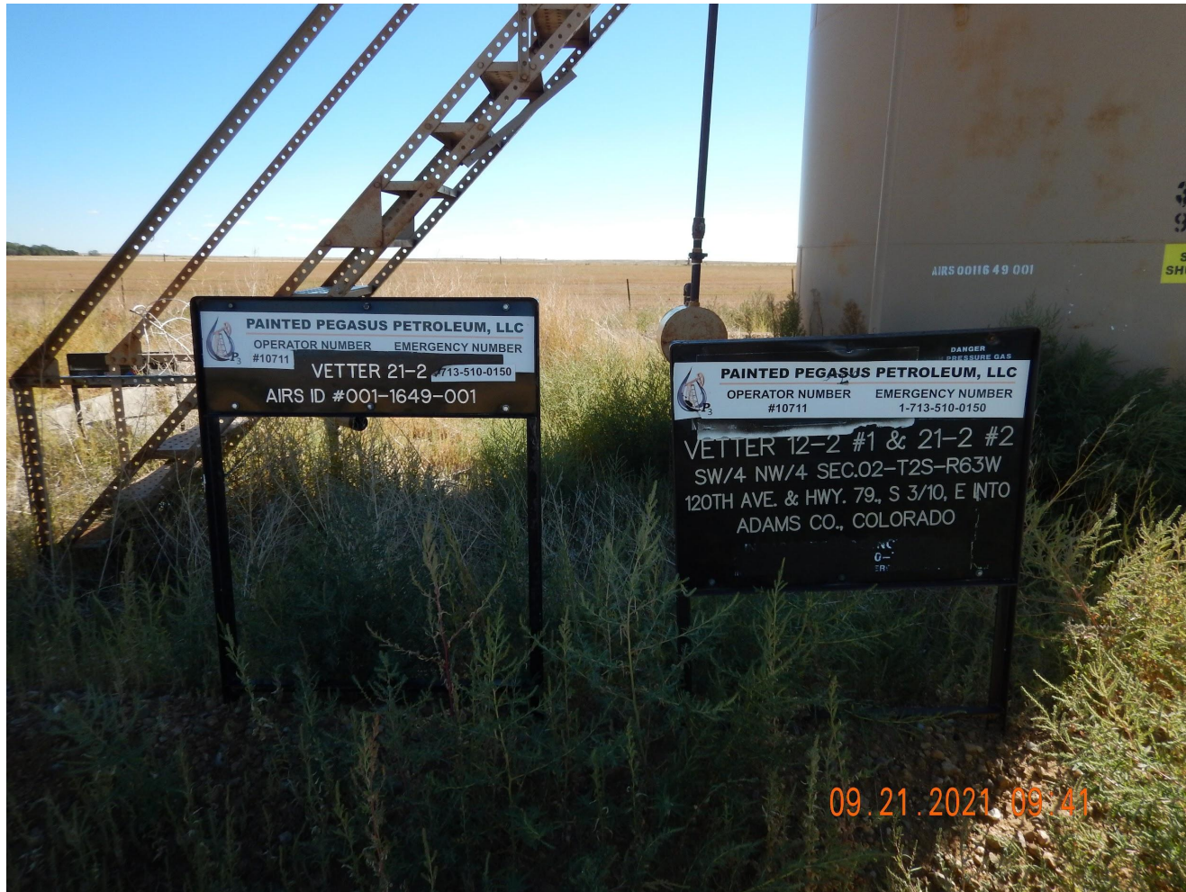
Photo 1. Photo taken from the tank battery. Photo illustrates Operator signs.