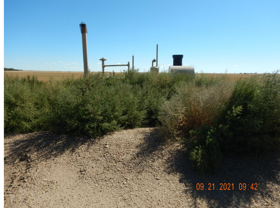
Photo 5. Photo taken from the northern tank battery, facing East. See comments under Photo 2.