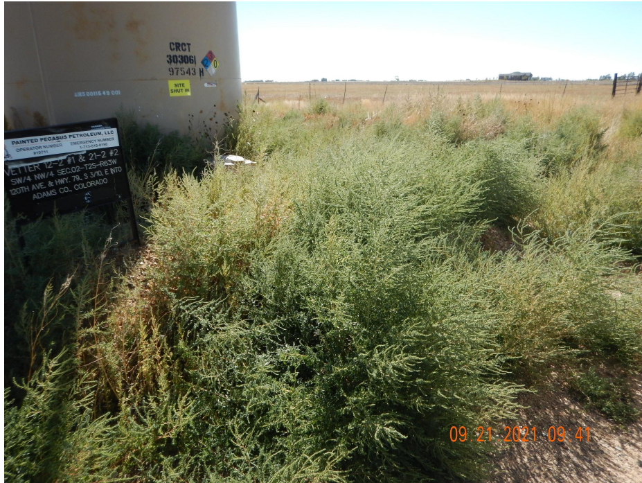
Photo 2. Photo taken from the southern tank battery, facing Southeast. Photo illustrates unmanaged weeds.