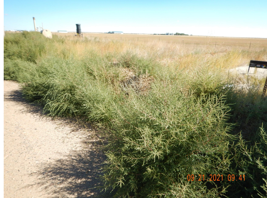
Photo 3. Photo taken from the southern tank battery, facing Northeast. See comments under Photo 2.