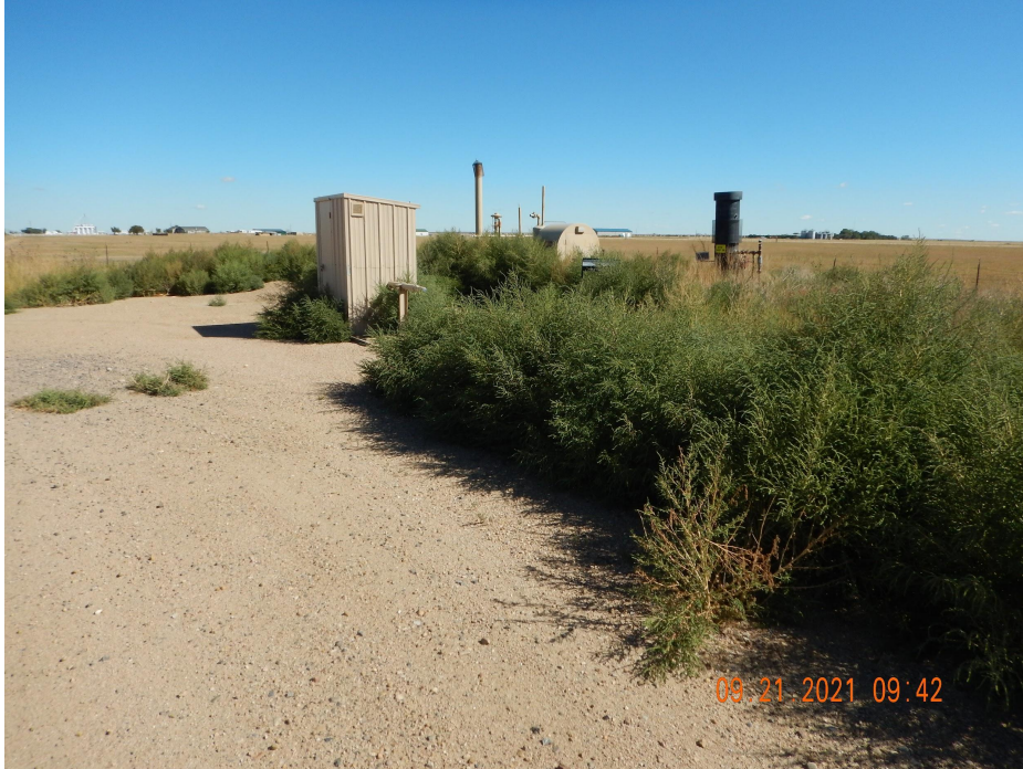
Photo 4. Photo taken from the northern tank battery, facing Northeast. Photo illustrates unmanaged weeds.