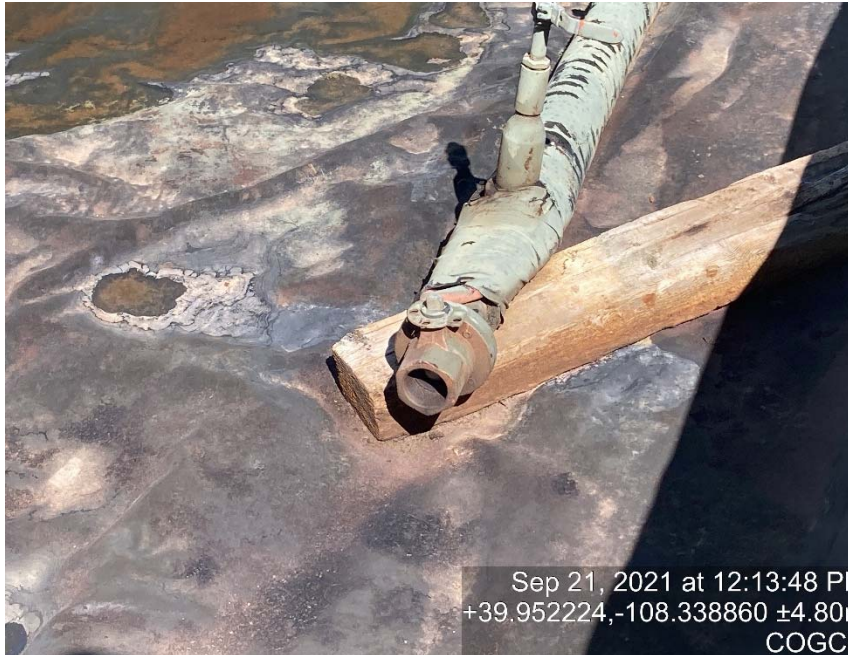
Load out line missing cap/plug