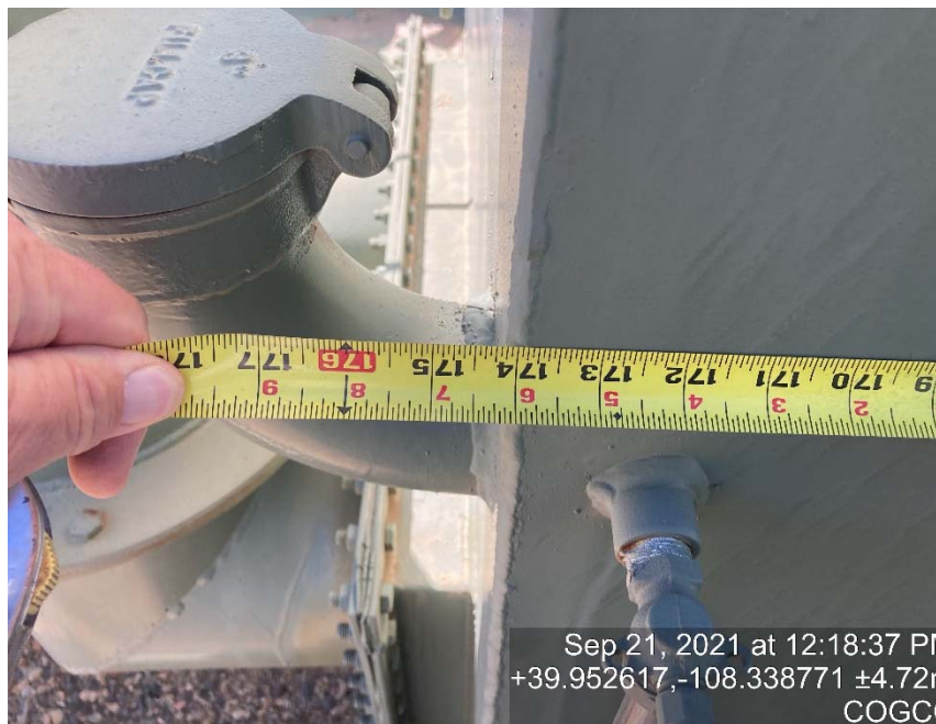
Glycol storage dimensions