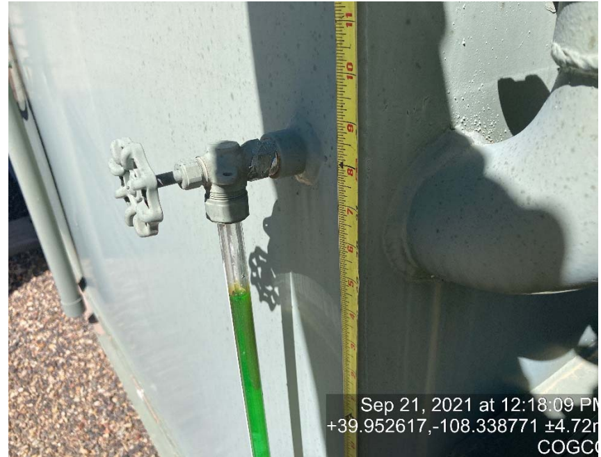
Glycol storage dimensions