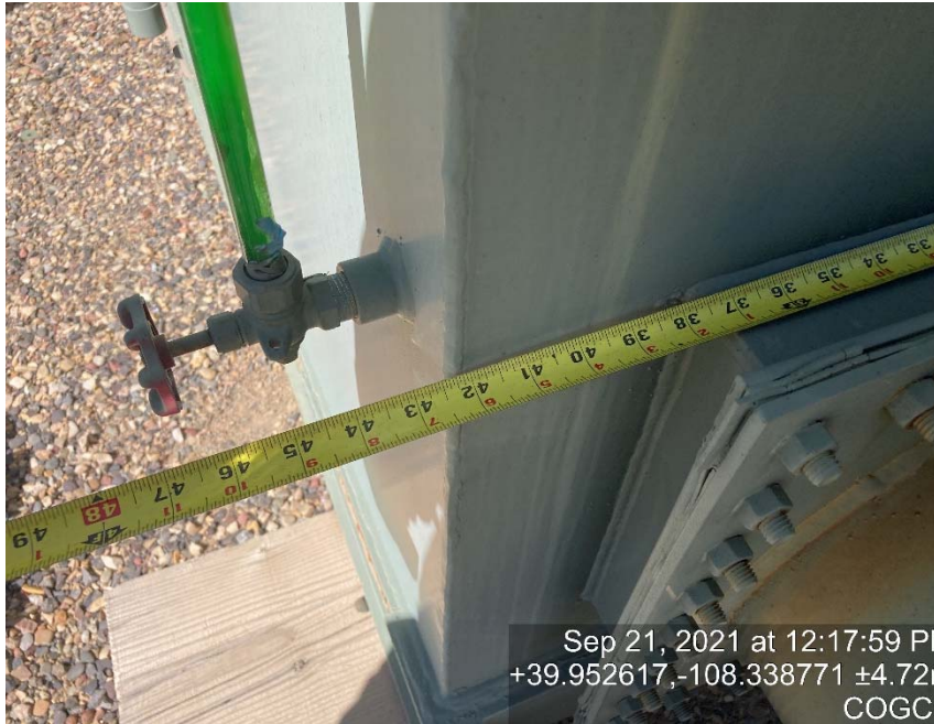
Glycol storage dimensions