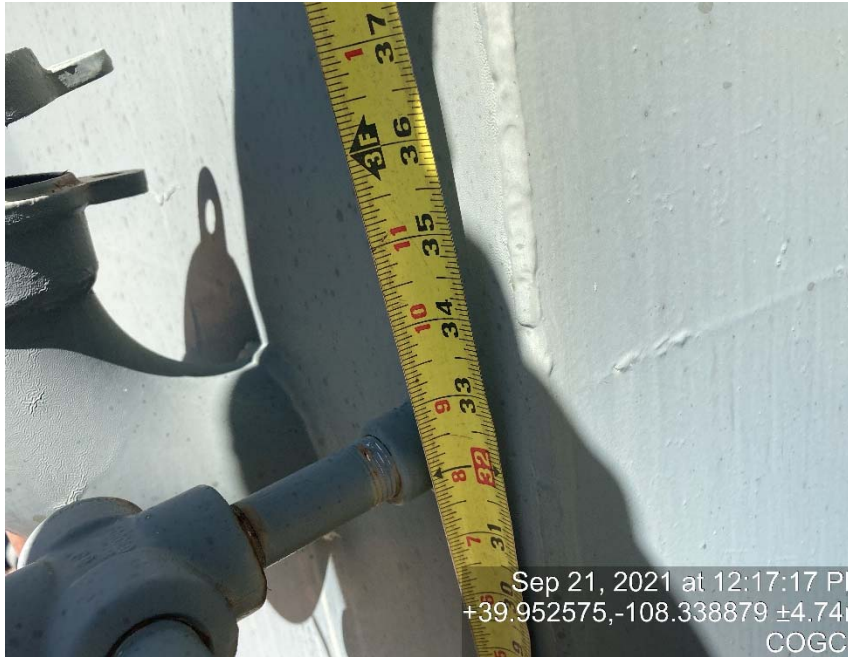
Glycol storage dimensions