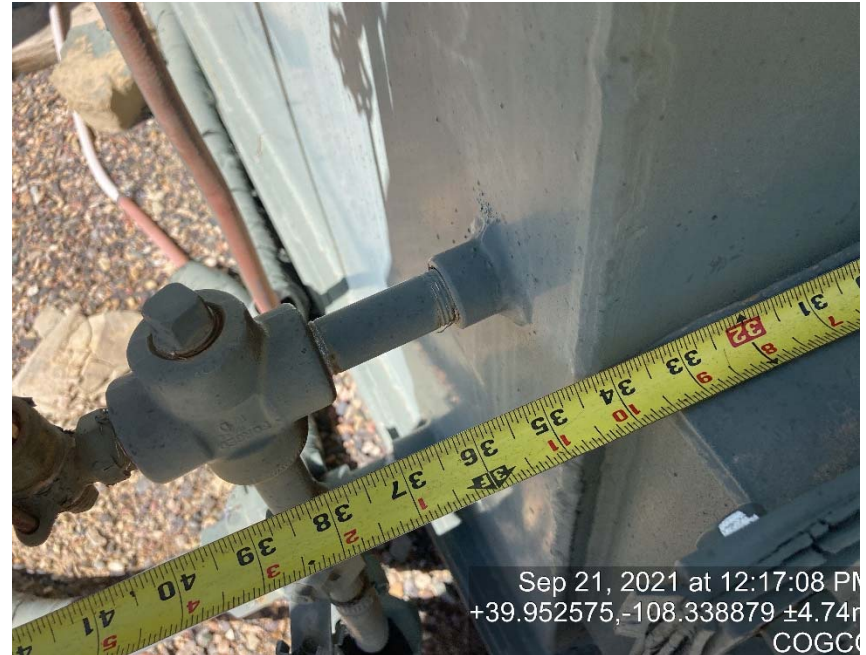
Glycol storage dimensions