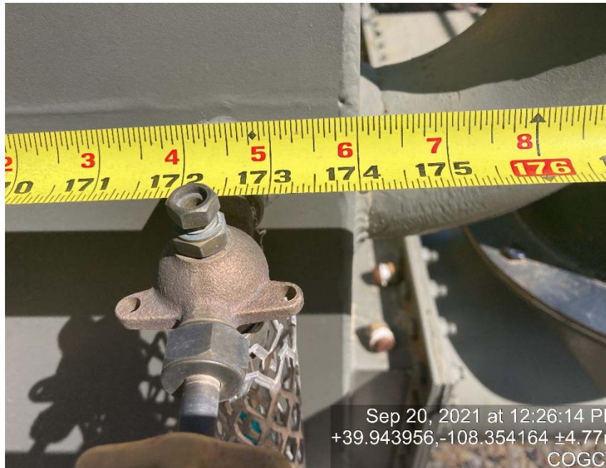
Glycol storage dimensions