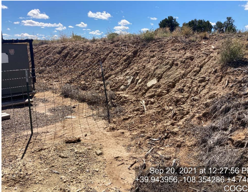
Lack of stabilization/erosion