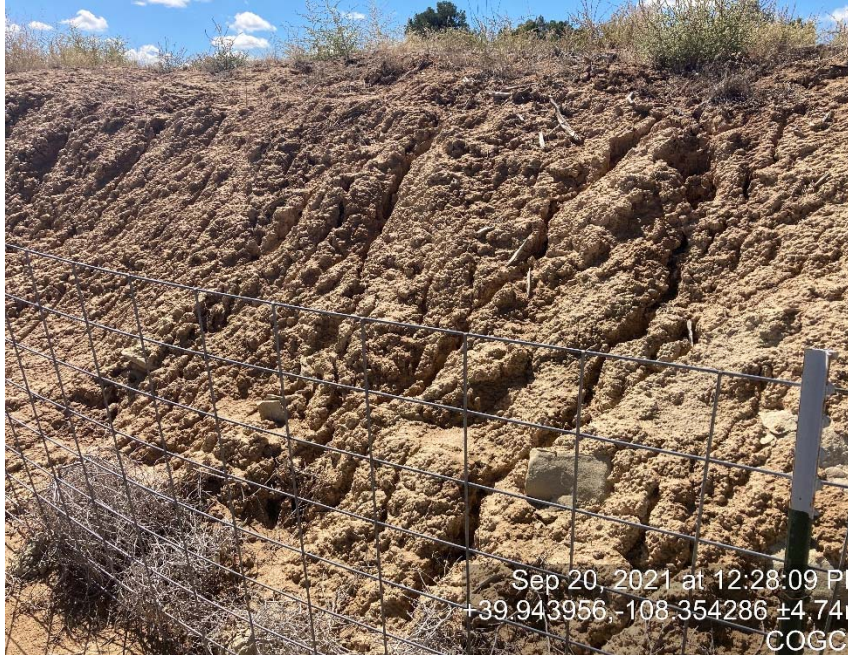
Lack of stabilization/erosion