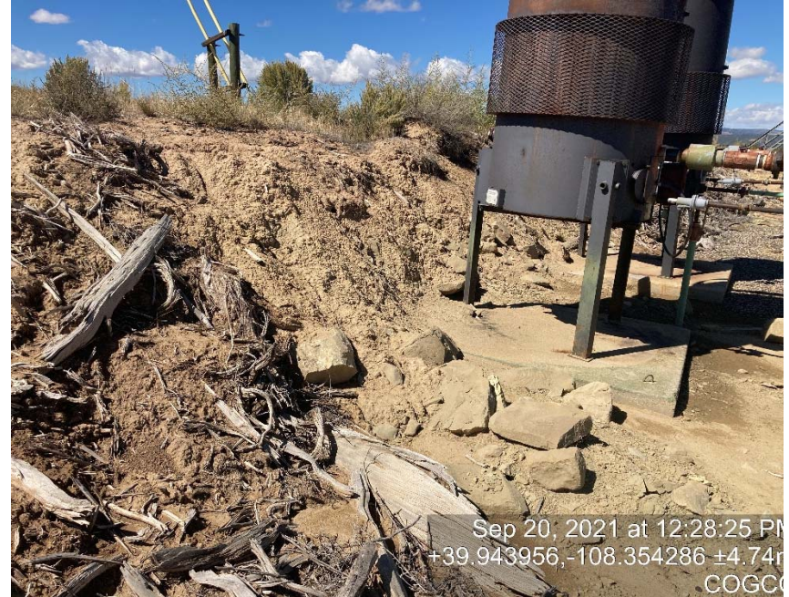
Lack of stabilization/erosion