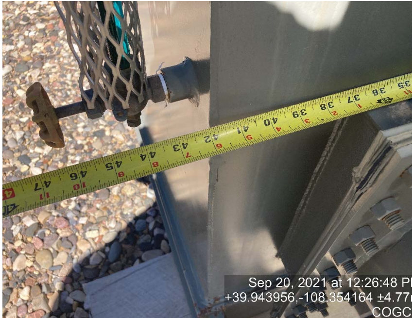
Glycol storage dimensions