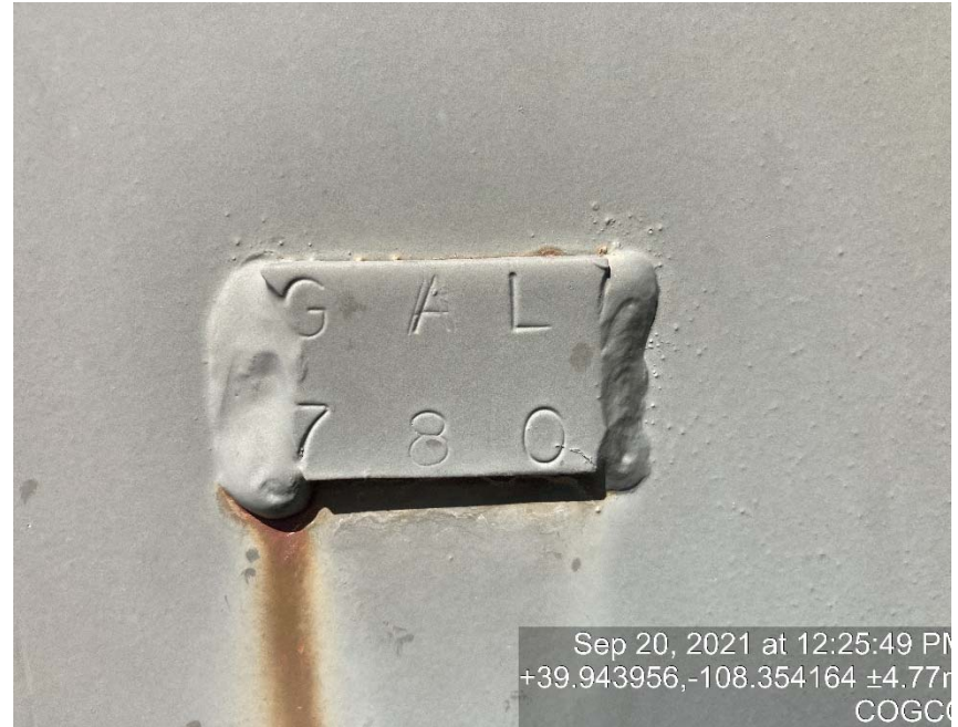
Glycol storage capacity stamp