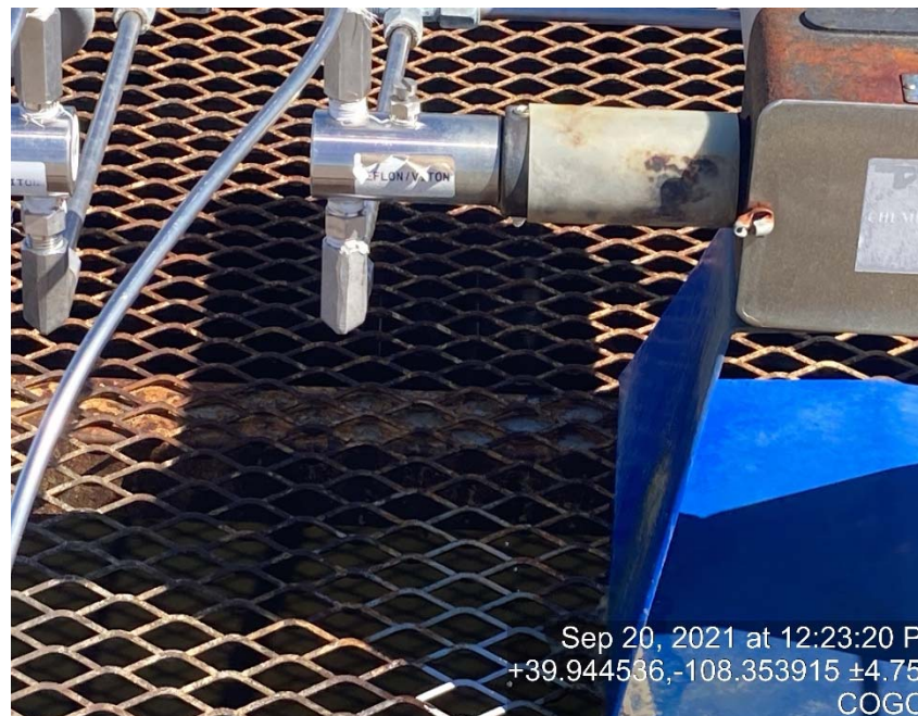
Chemical pump leaking