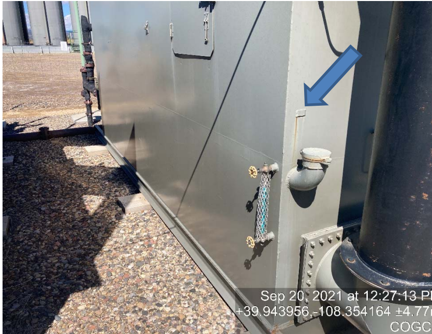
Lack of labeling/ Glycol storage capacity stamp