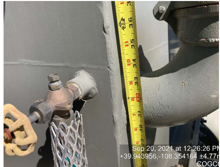
Glycol storage dimensions