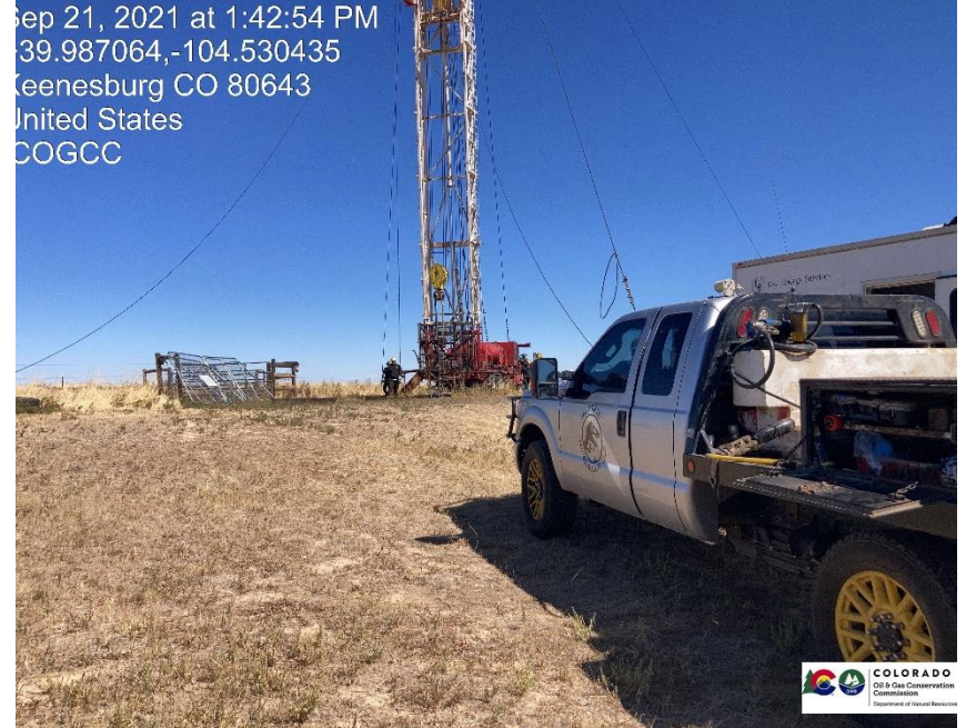
Pic 2 rig crew now wearing FR clothing. Proximity of dog house to wellhead.

Sep 21, 2021 at 1:42:54 PM 39.987064,-104.530435 Keenesburg CO 80643 United States COGCC