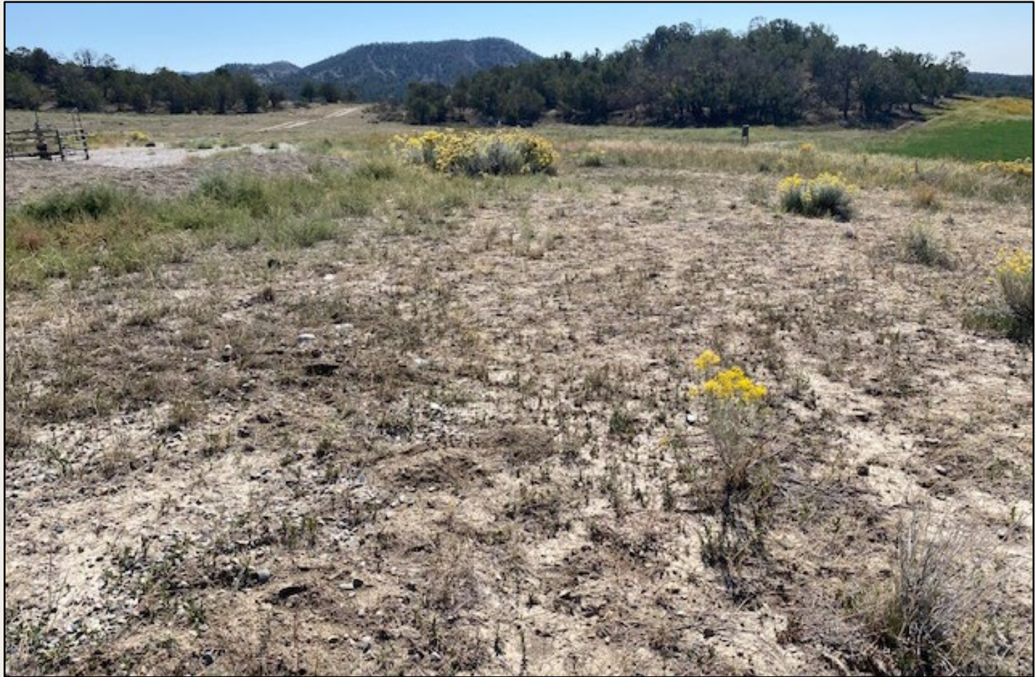
Photo 2. View of the western fill slope from the northwestern corner facing southward. Revegetation is progressing in portions with western wheatgrass, smooth brome, and sand dropseed.