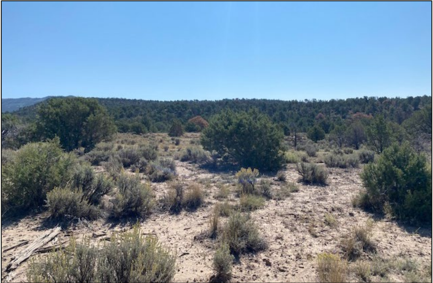
Photo 7. View of pinyon and juniper woodland with understory of sagebrush, prickly pear, and squirreltail.