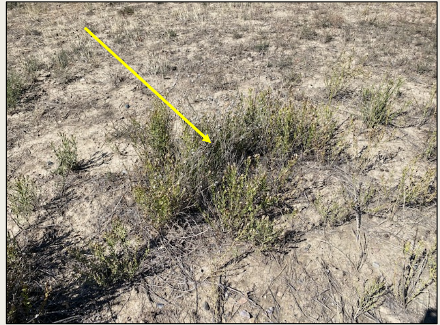
Photos 3-5. View of Russian knapweeds remaining within the interim reclamation areas. Approximately 300 individuals observed.