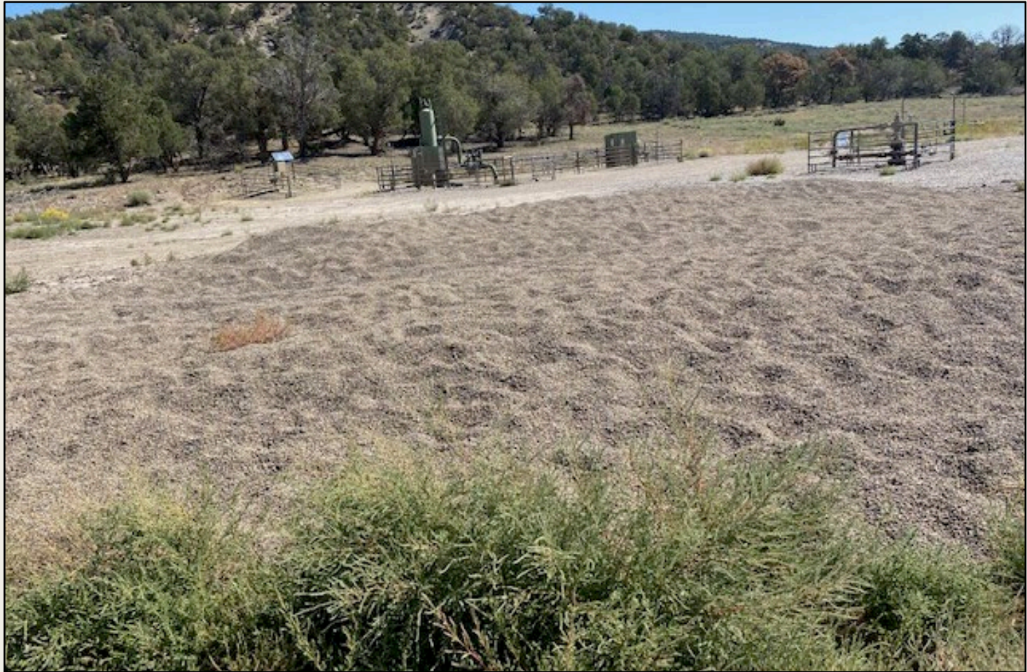
Photo 1. View of the project area from the northwestern corner facing center. Kochia weeds (up to 3ft tall) need to be managed.