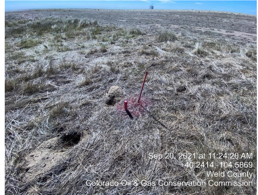
Photo #6 All guy line anchors left buried for future use shall be identified by a marker of bright color not less than four (4) feet in height and not greater than one (1) foot east of the guy line anchor.