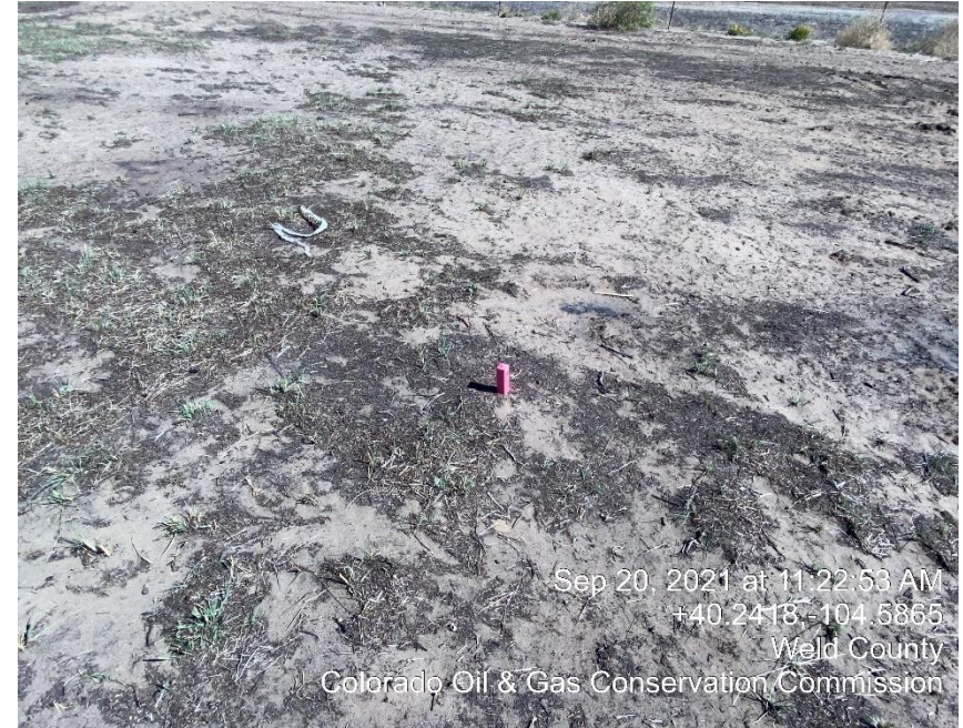
Photo #4 All guy line anchors left buried for future use shall be identified by a marker of bright color not less than four (4) feet in height and not greater than one (1) foot east of the guy line anchor.