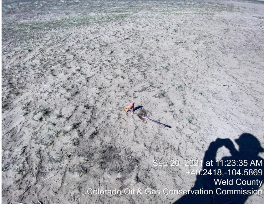
Photo #5 All guy line anchors left buried for future use shall be identified by a marker of bright color not less than four (4) feet in height and not greater than one (1) foot east of the guy line anchor.