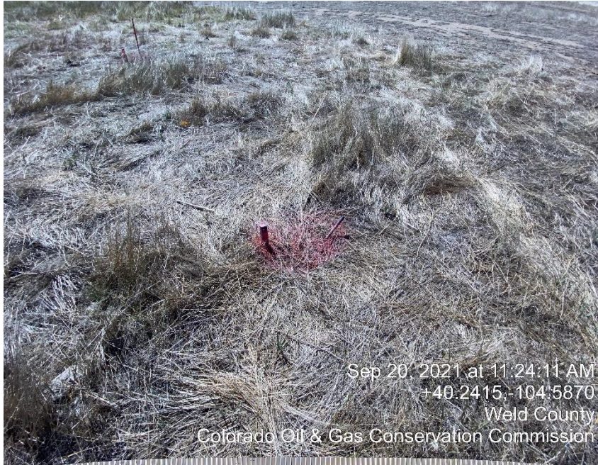
Photo #3 All guy line anchors left buried for future use shall be identified by a marker of bright color not less than four (4) feet in height and not greater than one (1) foot east of the guy line anchor.