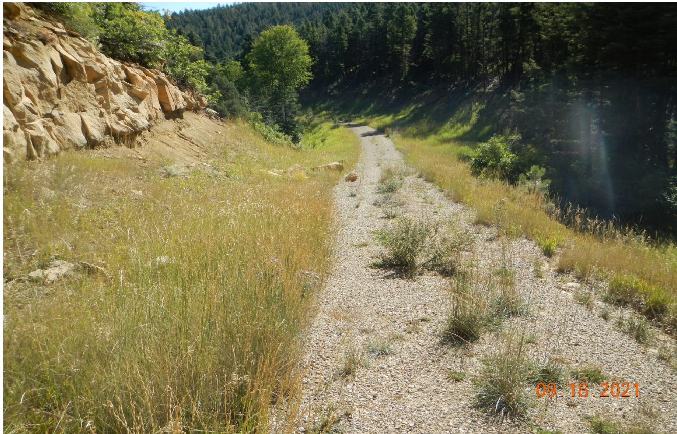
Photo 7. Facing east along the access road toward the location.