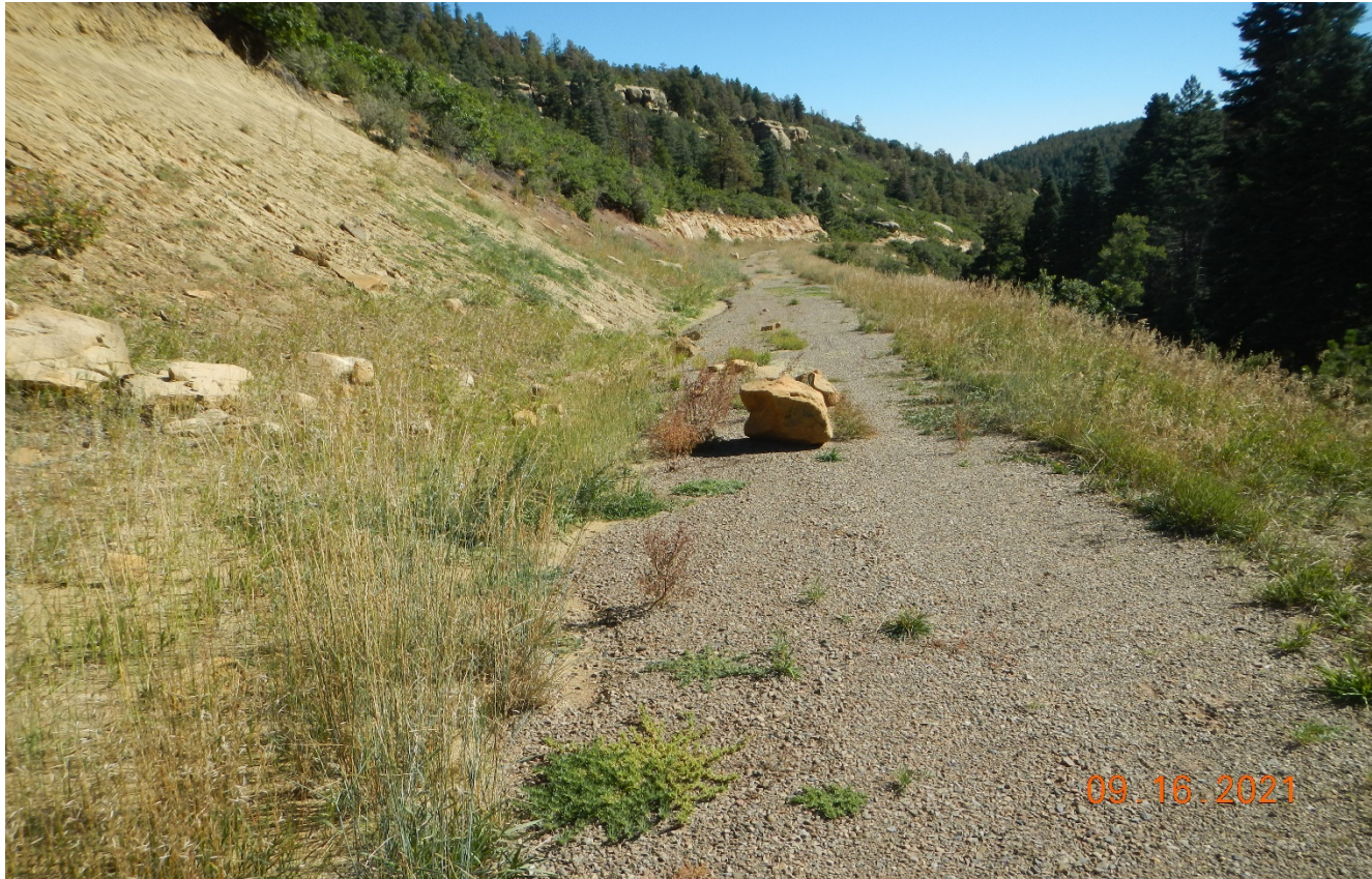
Photo 5. Facing northeast along the access road. The road is not recontoured and rocks have fallen onto the road.