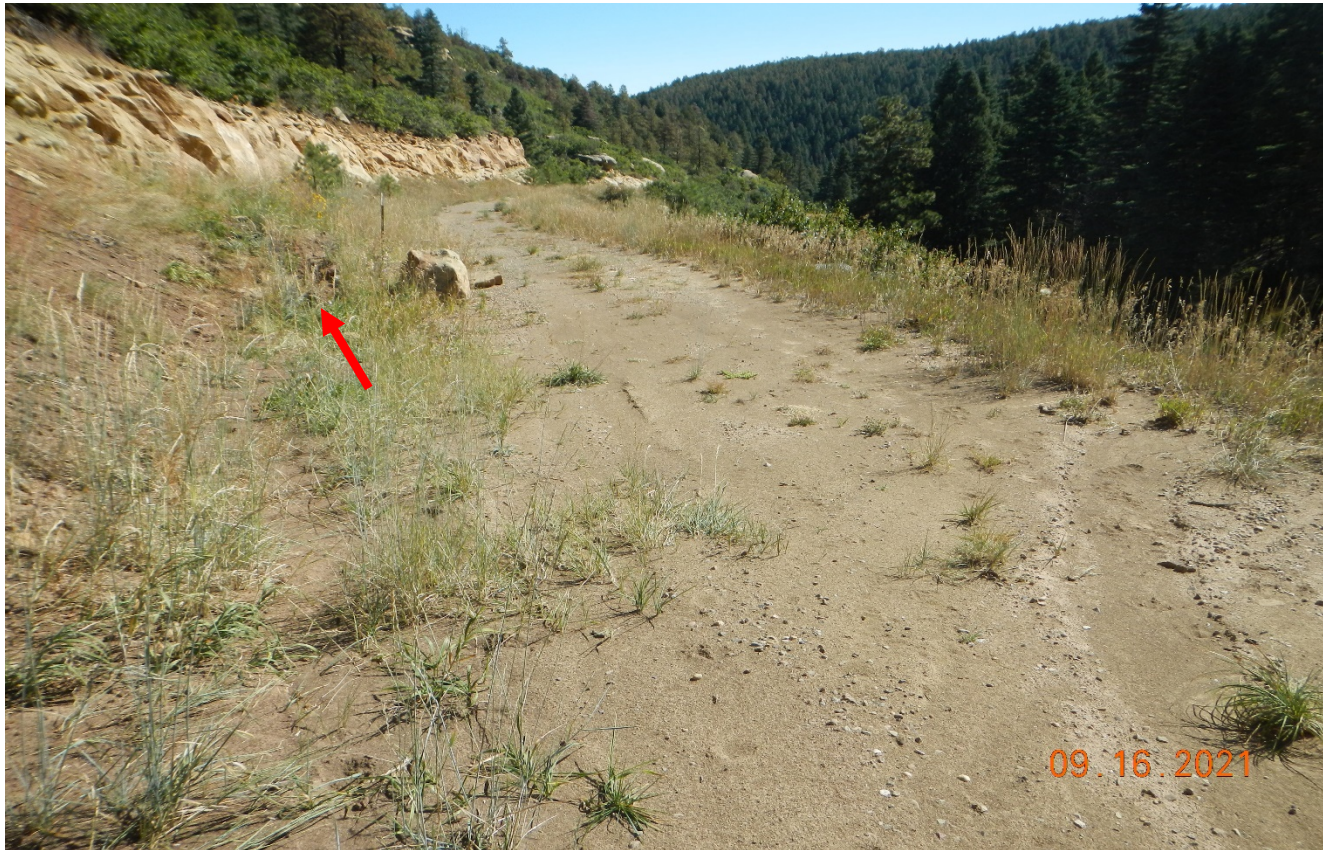
Photo 6. Facing northeast along the access road. The culvert is filled in with sediment shown at red arrow. Rocks have fallen on the road.