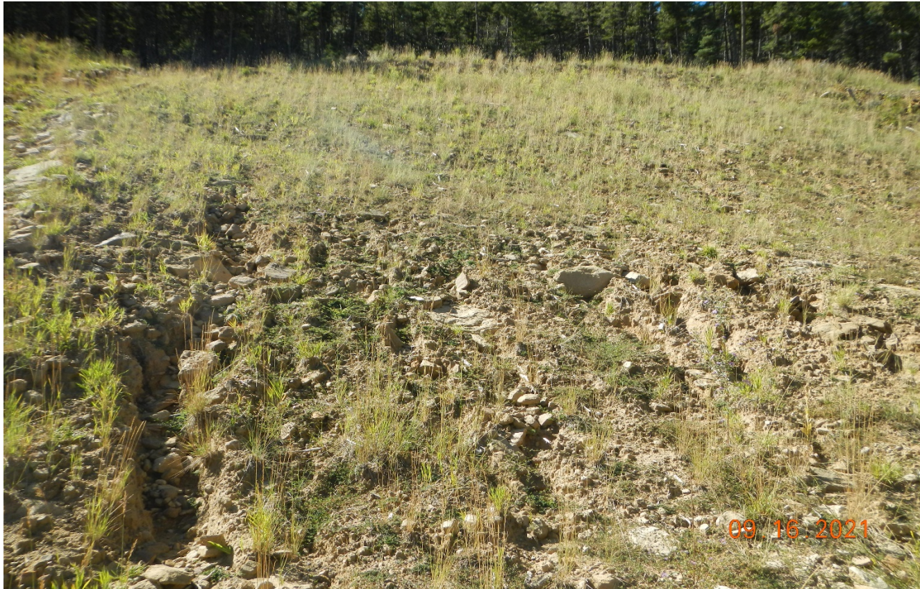
Photo 11. There are area of erosion along the reclaimed location that need to be repaired and stabilized.