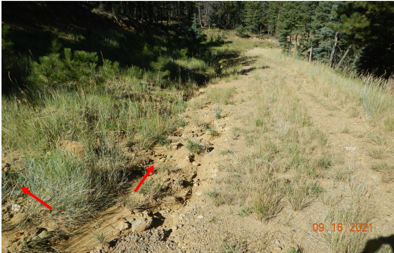
Photo 2. The culvert along the access road is filled in with sediment causing erosion down the road side.