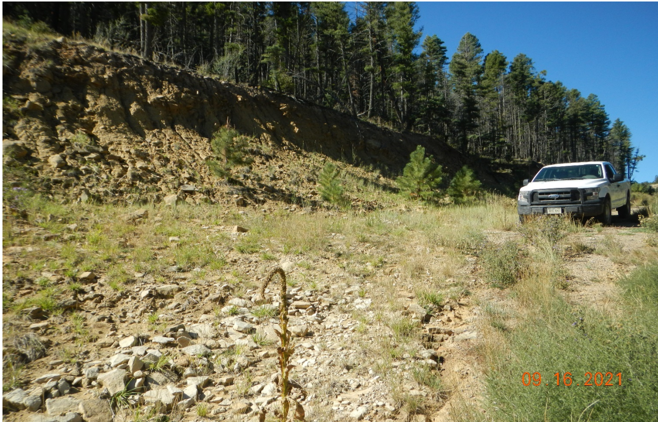
Photo 8. There is a steep cut slope at the end of the access road that is not stabilized.