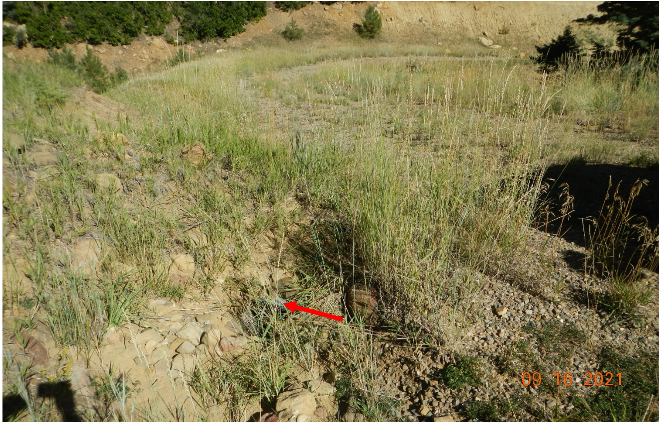
Photo 4. The road crosses the canyon bottom which creates a dam across the canyon. The culvert is filled in with sediment shown at red arrow.