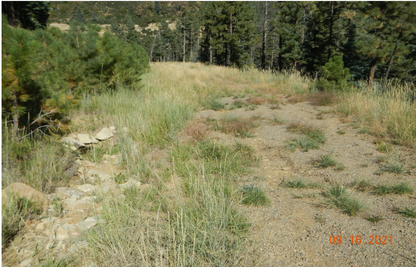
Photo 1. Facing northwest toward the beginning portion of the access road.