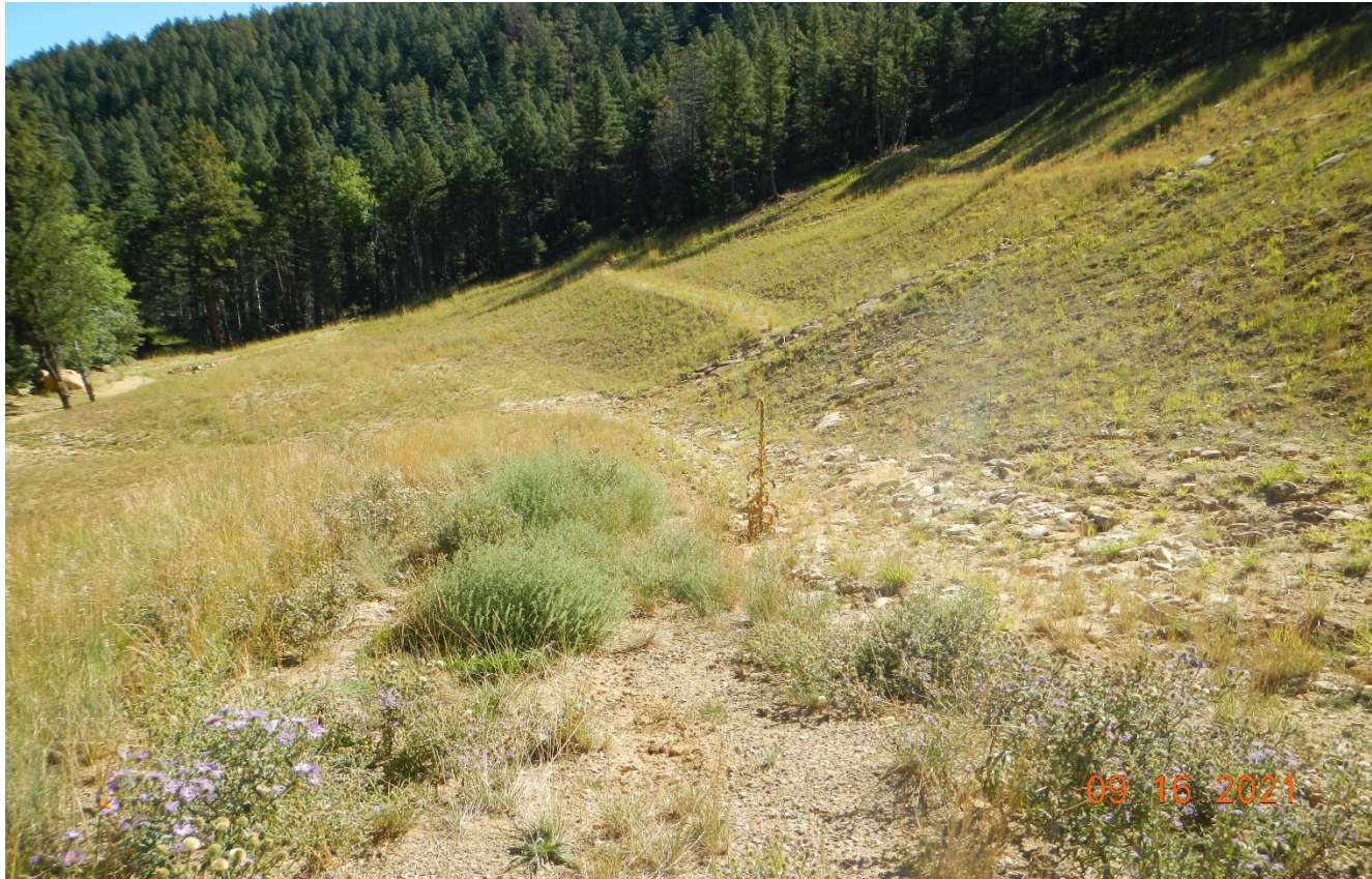
Photo 9. Facing east toward the location. The location has been recontoured and reclaimed.