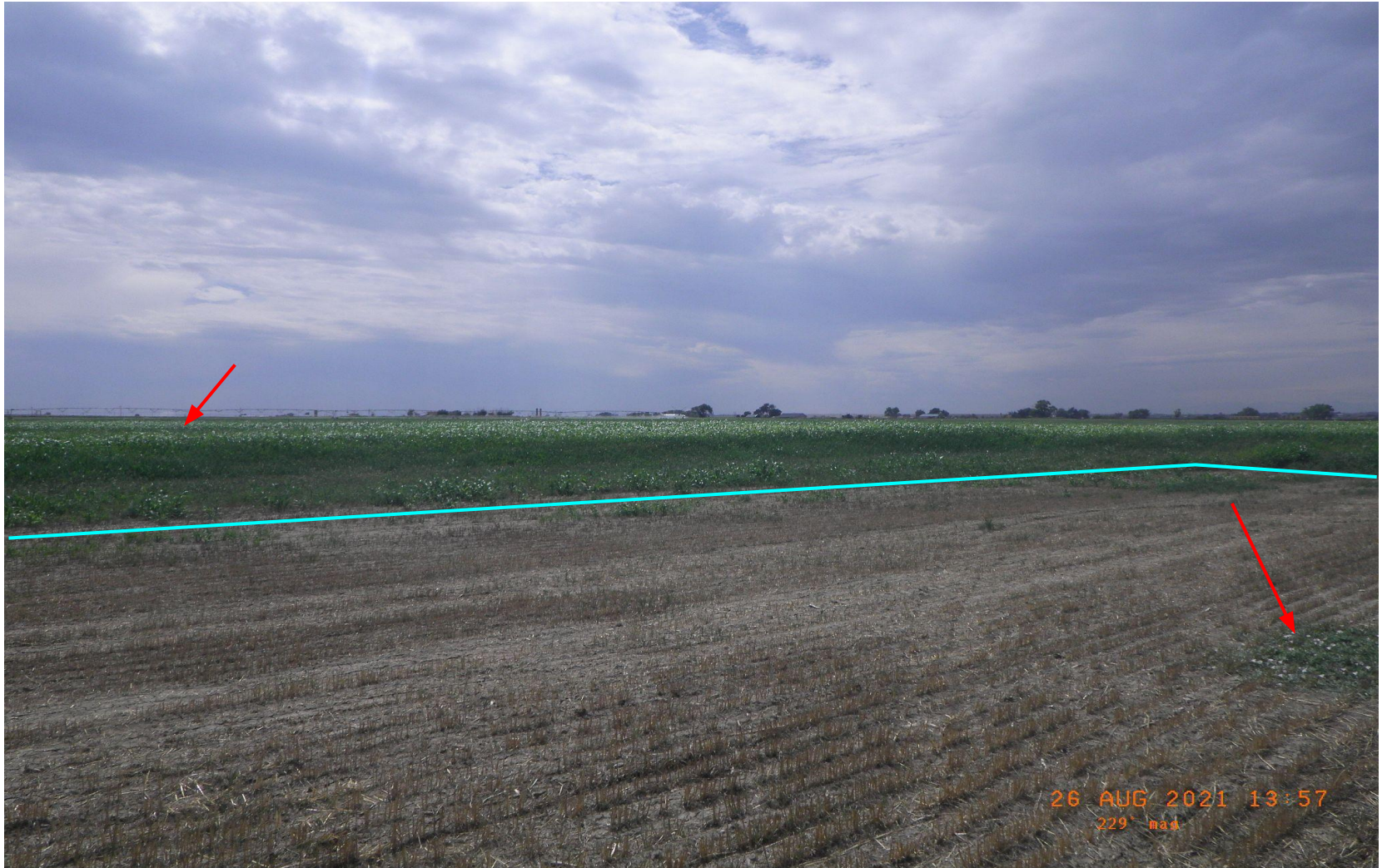
Photo 6. Reference photo taken from middle of tank battery looking southwest down well pad access road. Note wheat crop heights just outside of tank battery disturbance pad and field bindweed (both designated with red arrows). Southern edge of tank battery highlighted in light blue