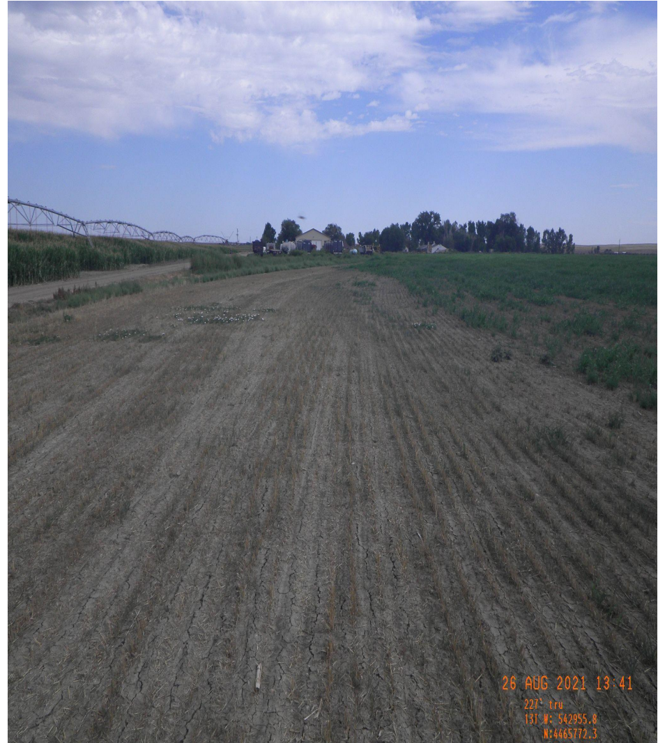
Photo 4. Ground photos taken from the middle of the tank battery. Left photo facing north, right photo facing east.