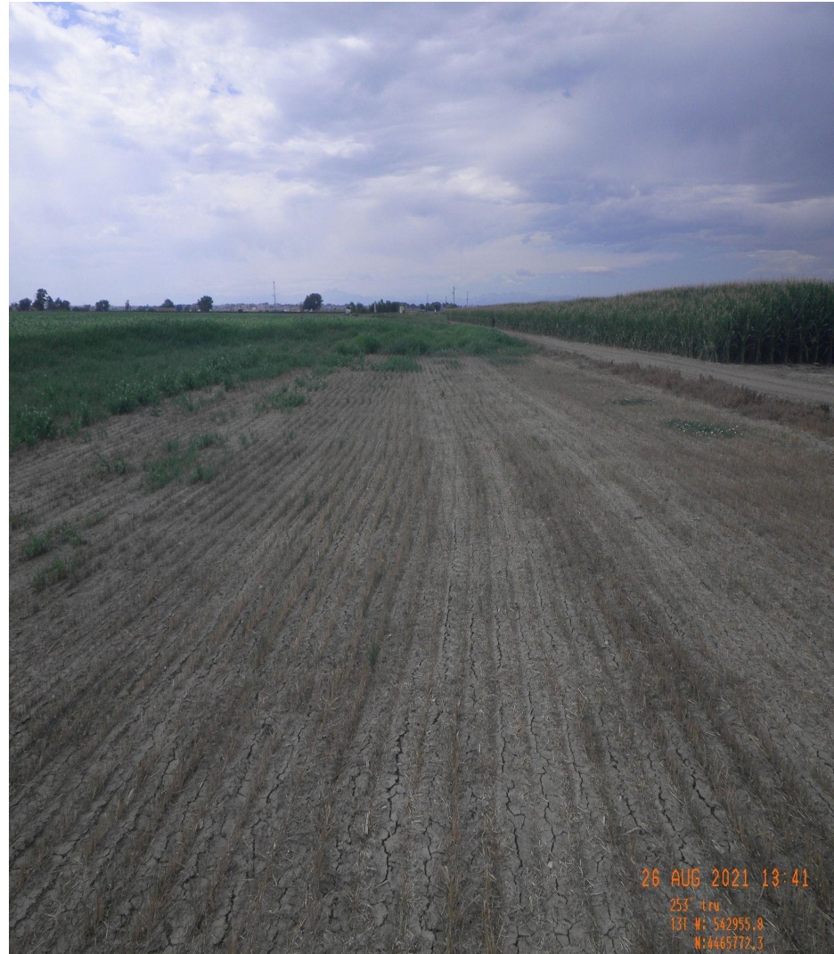
Photo 5. Ground photos taken from the middle of the tank battery. Left photo facing south, right photo facing west.