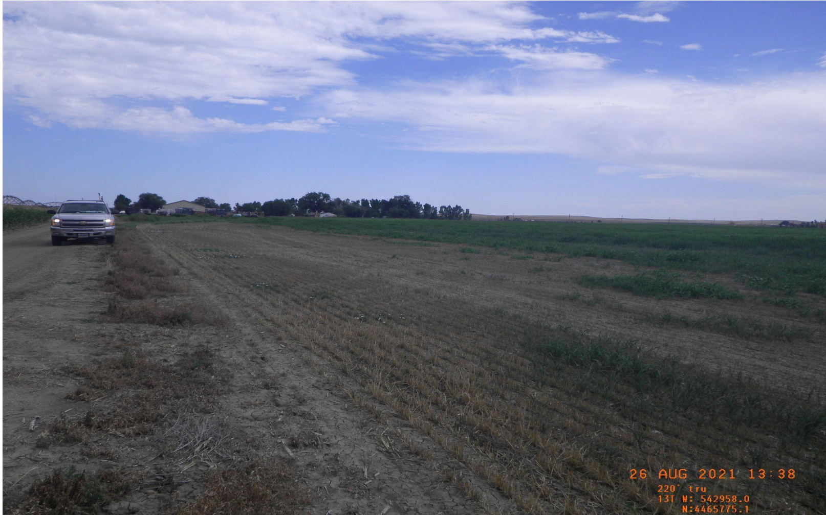
Photo 3. Tank battery overview photo taken at ground level from eastern edge of tank battery, looking west. Note: wheat crop appears to be processed and dead as opposed to just stunted. Significant bare batches throughout disturbance pad and patches of field bindweed present. Not representative of reference area.