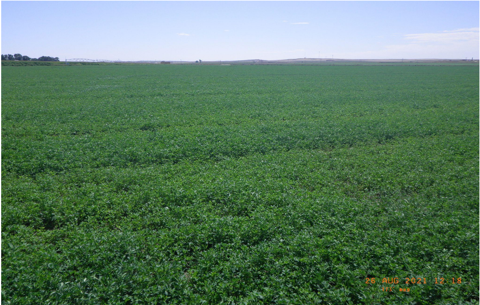
Photo 2. Well Pad overview photo taken at ground level from northern edge of tank battery looking south down access road. Photo shows alfalfa crop within well head disturbance pad appears consistent with the rest of the crop field.