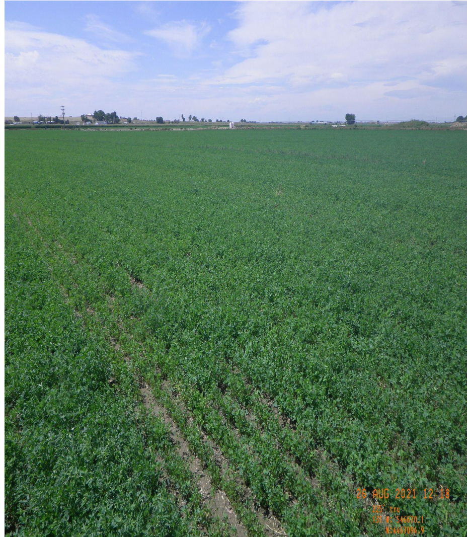
Photo 4. Ground photos taken from the middle of the well head. Left photo facing south, right photo facing west.