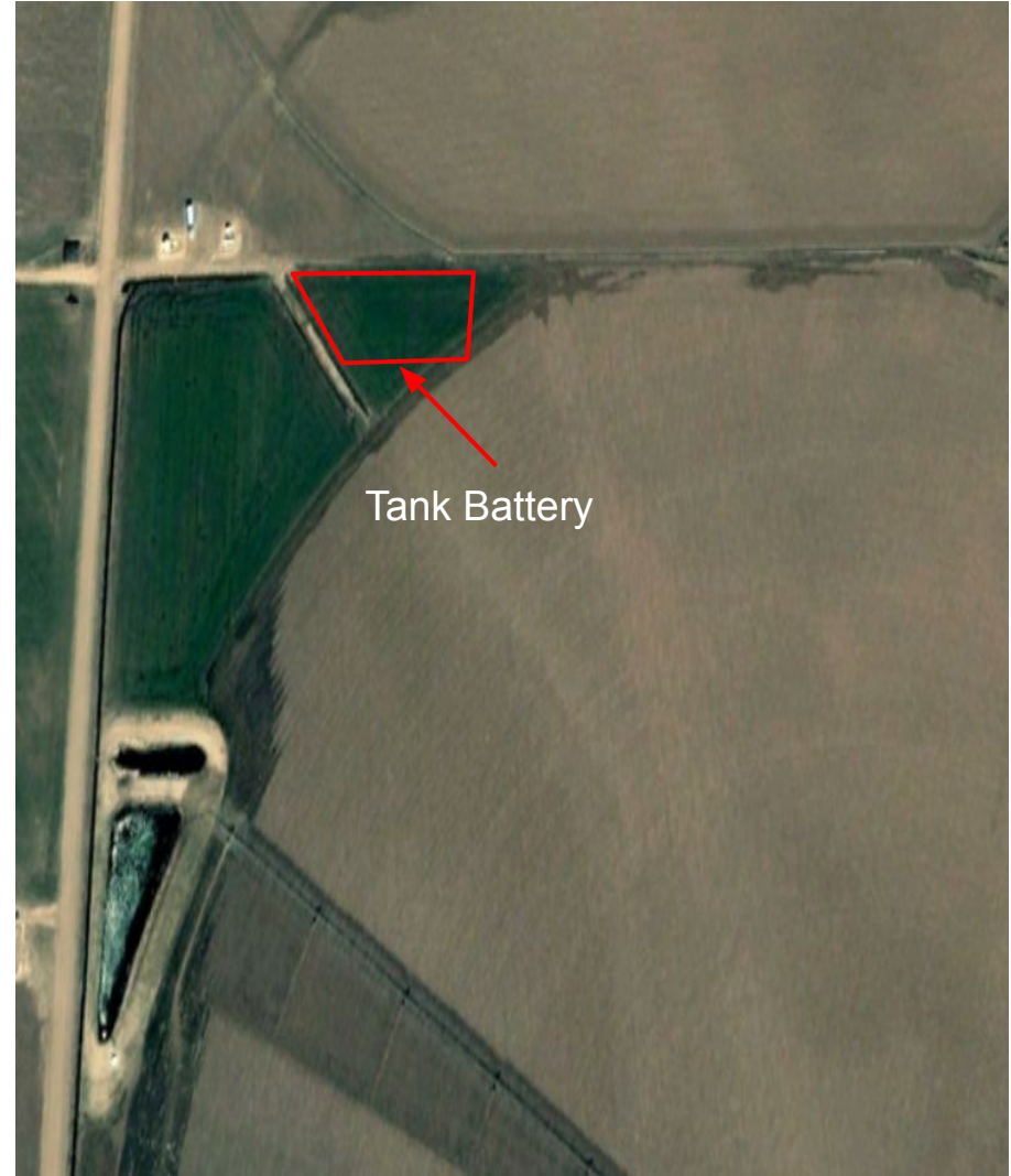
Photo 6. 2016 aerial imagery on the left and 2006 imagery on the right (tank battery highlighted in red). Photo shows tank battery was used to harvest hay crop pre disturbance.