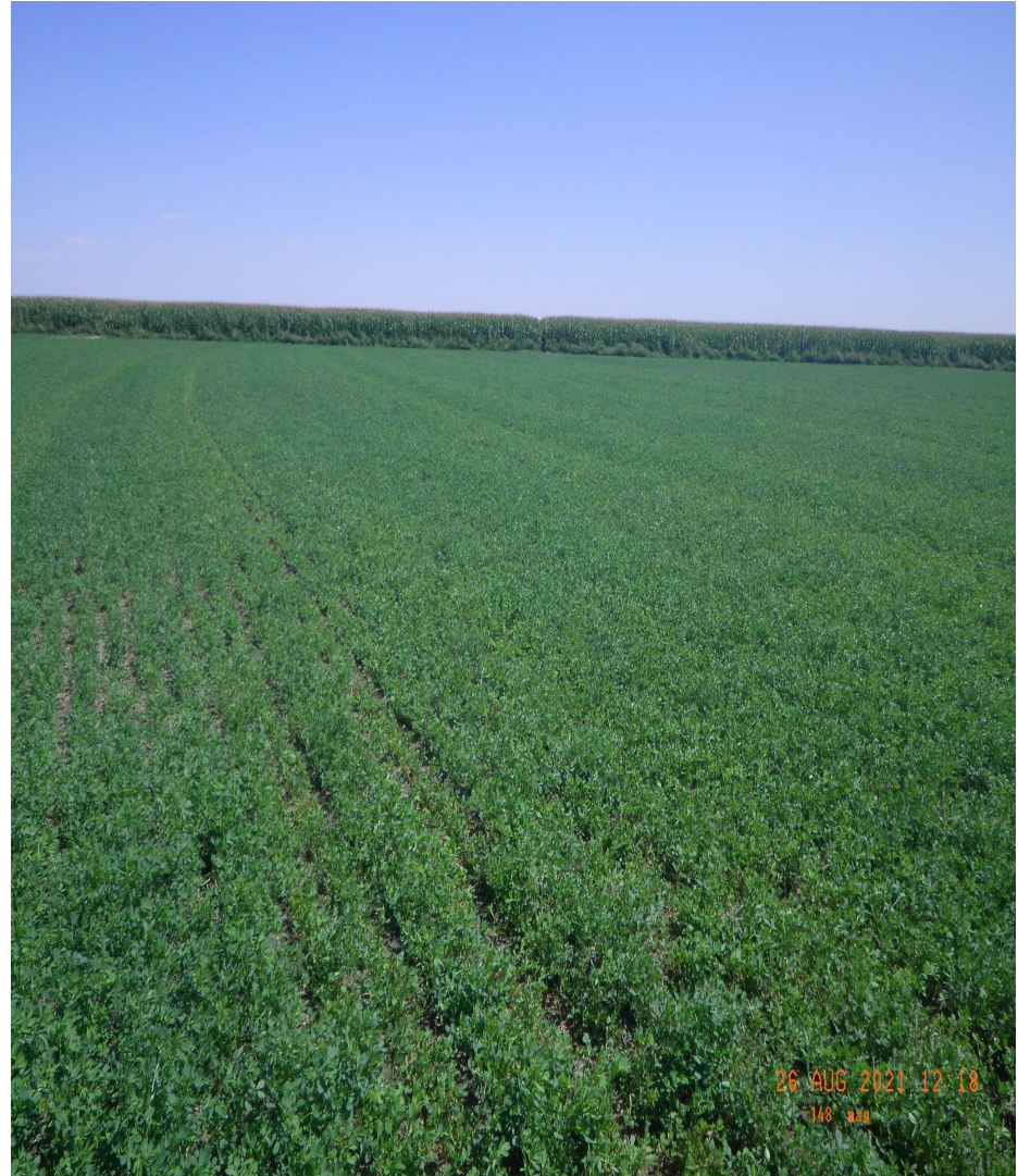
Photo 3. Ground photos taken from the middle of the well head. Left photo facing north, right photo facing east.