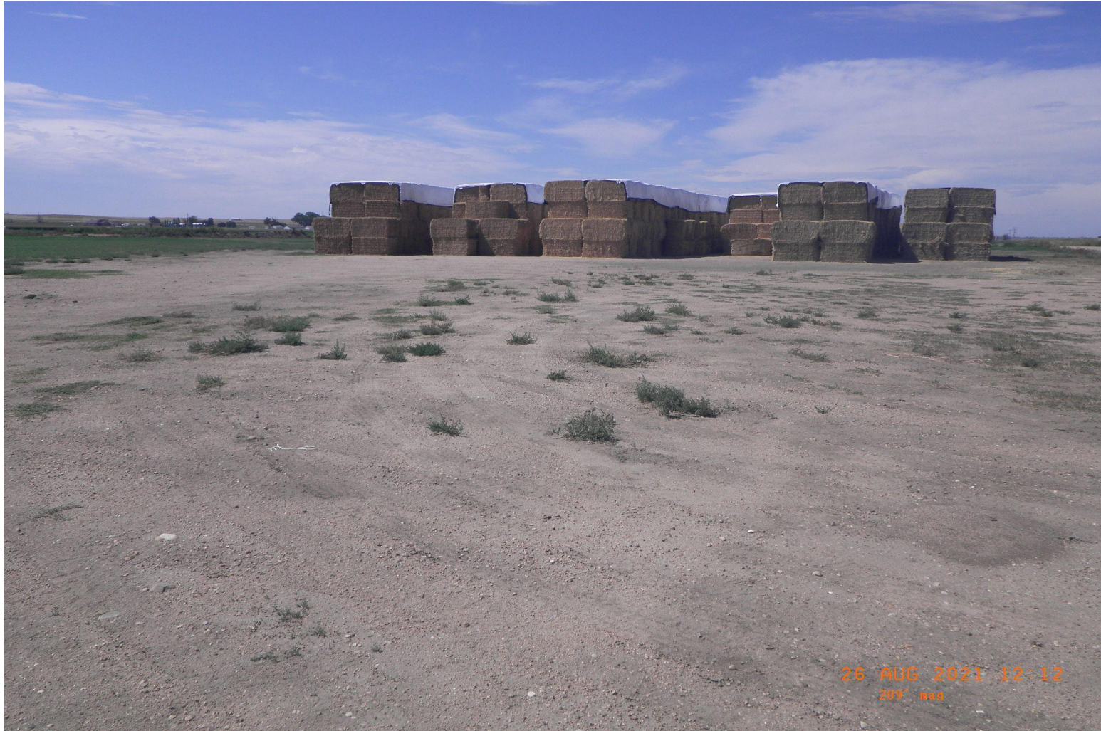
Photo 5. Overview photo of tank battery taken at ground level from the eastern edge of the disturbance pad, looking west. Photo shows Gravel remains on site with dispersed kohia and puncture vine growth. Historical imagery shows that the pre disturbance area was used to grow hay crop (see photo 6). Note: staged hay is just outside of the tank battery disturbance area.