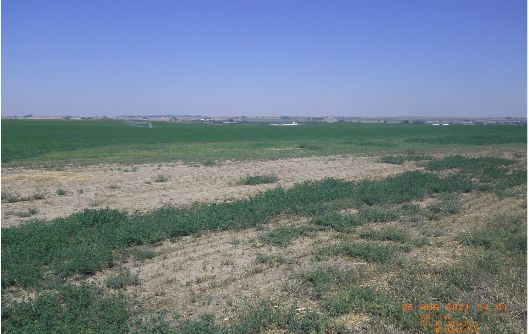
Photo 3. Tank battery overview photo taken at ground level from the western edge of the tank battery looking east. Note: majority of tank battery shows stunted alfalfa crop growth and more bare ground than adjacent reference area.