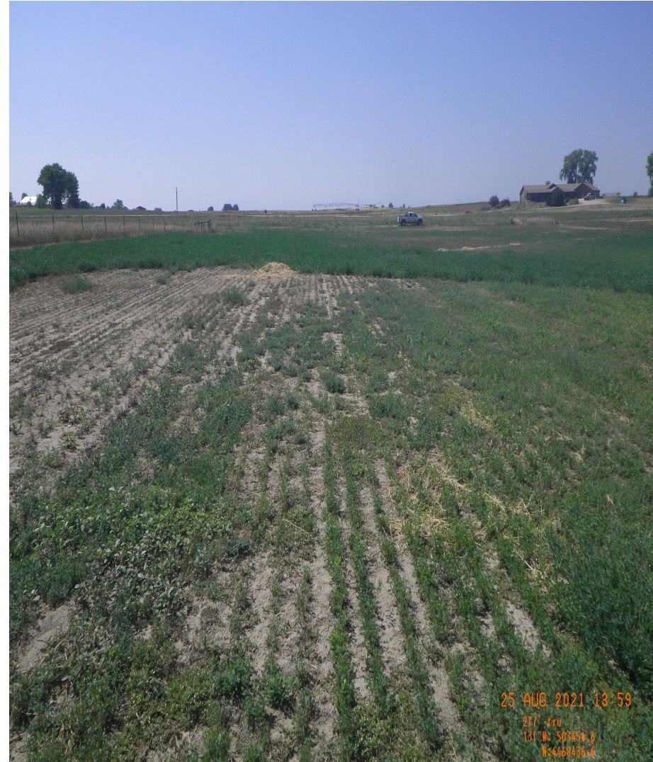
Photo 5. Ground photo taken from the middle of the tank battery. Left photo is facing south, right photo is facing west.