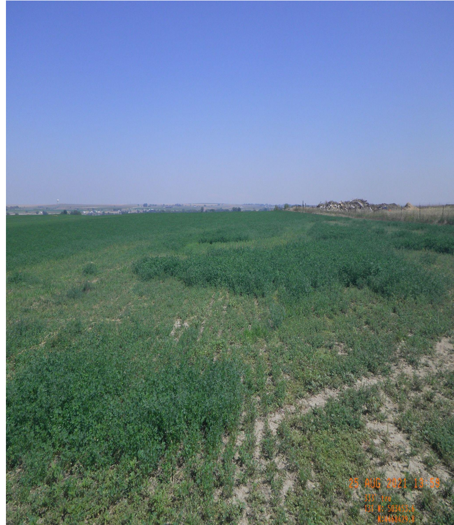
Photo 4. Ground photos taken from the middle of the tank battery. Left photo is facing north, right photo is facing east.