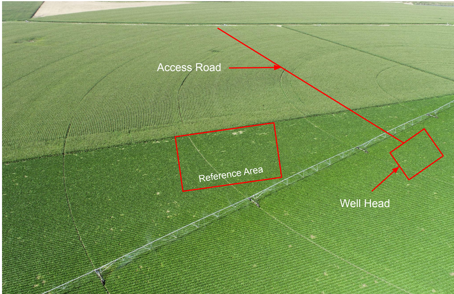
Photo 2. Overview photo of well head, access road and reference area taken east of well head using a drone (north is right). Photo shows crop within the well head and along access road appear consistent with adjacent reference area.