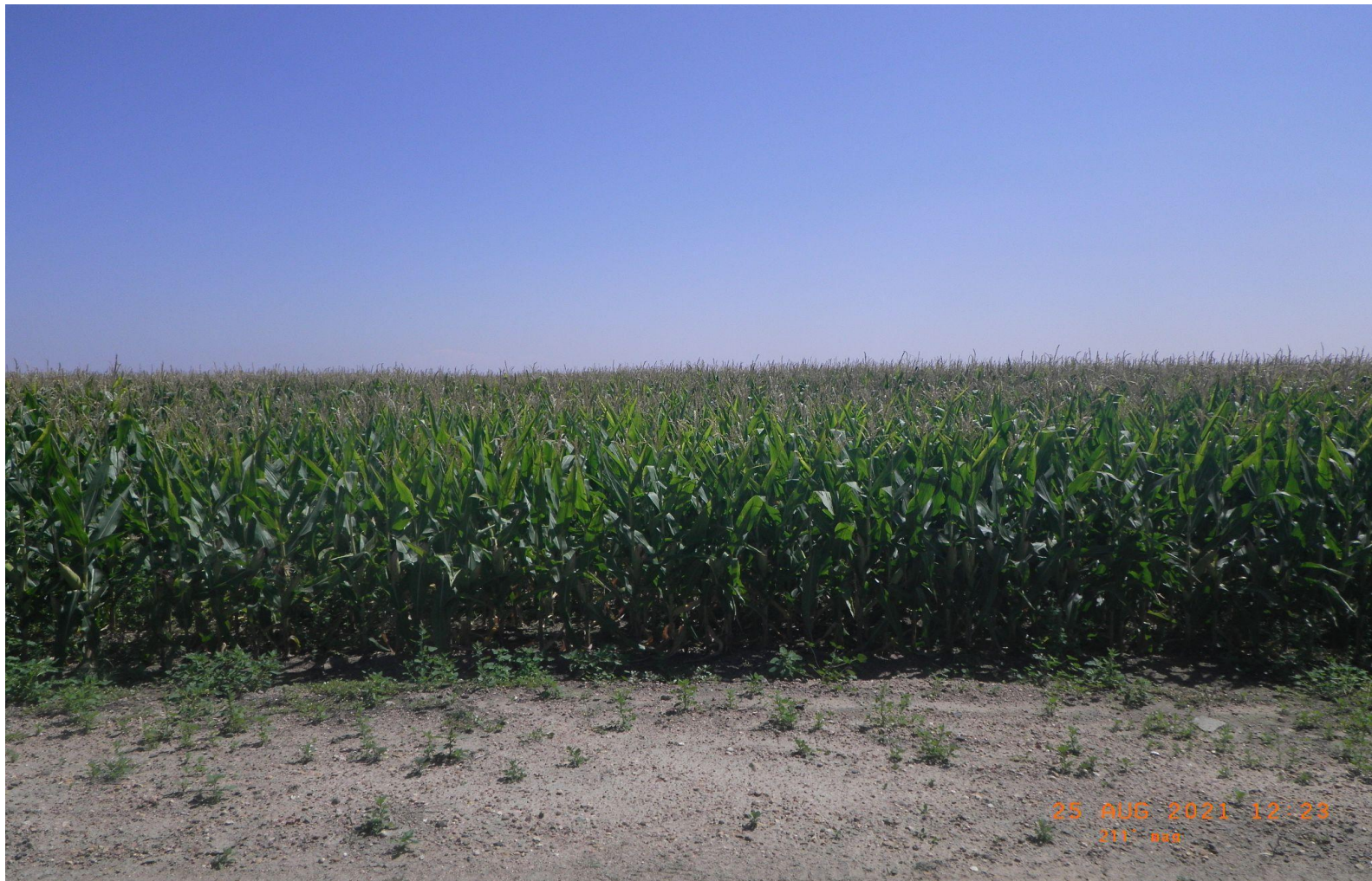
Photo 3. Ground photo taken west of well pad looking east down access road.