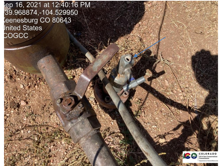
Pic 4 bradenhead unaccusable due to broken threads in needle valve