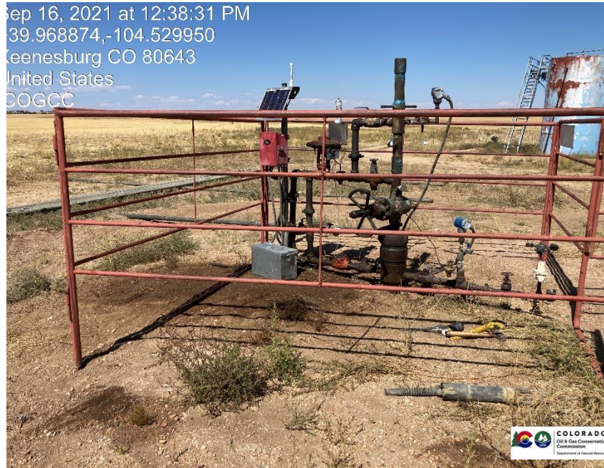
Pic 1 stained soil from recent workover