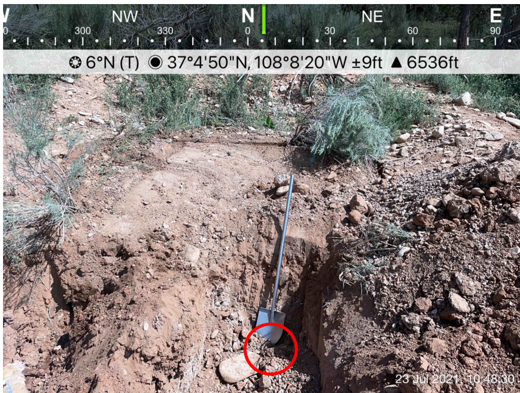
Photo 2: SS02 collected at former AST location at the Jumbo (OWP) #1A, 7/23/2021.