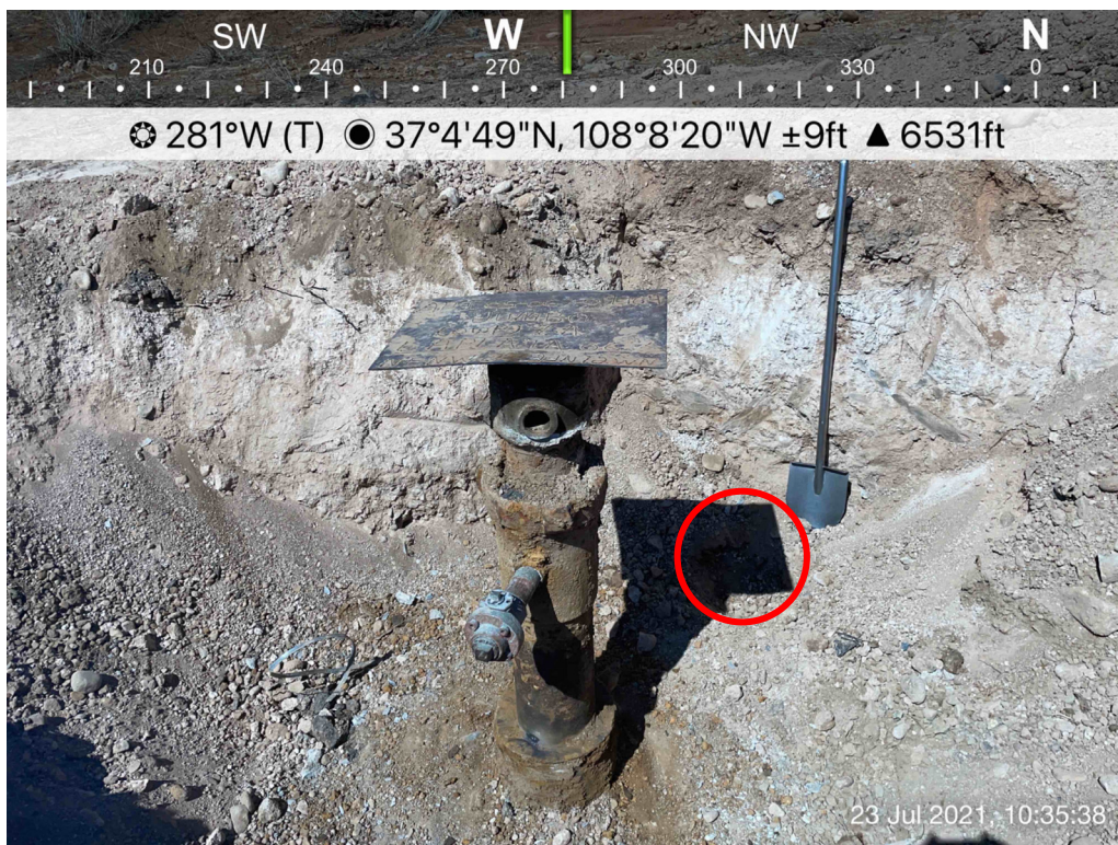
Photo 1: SS01 collected adjacent to Jumbo (OWP) #1A wellhead, 7/23/2021.