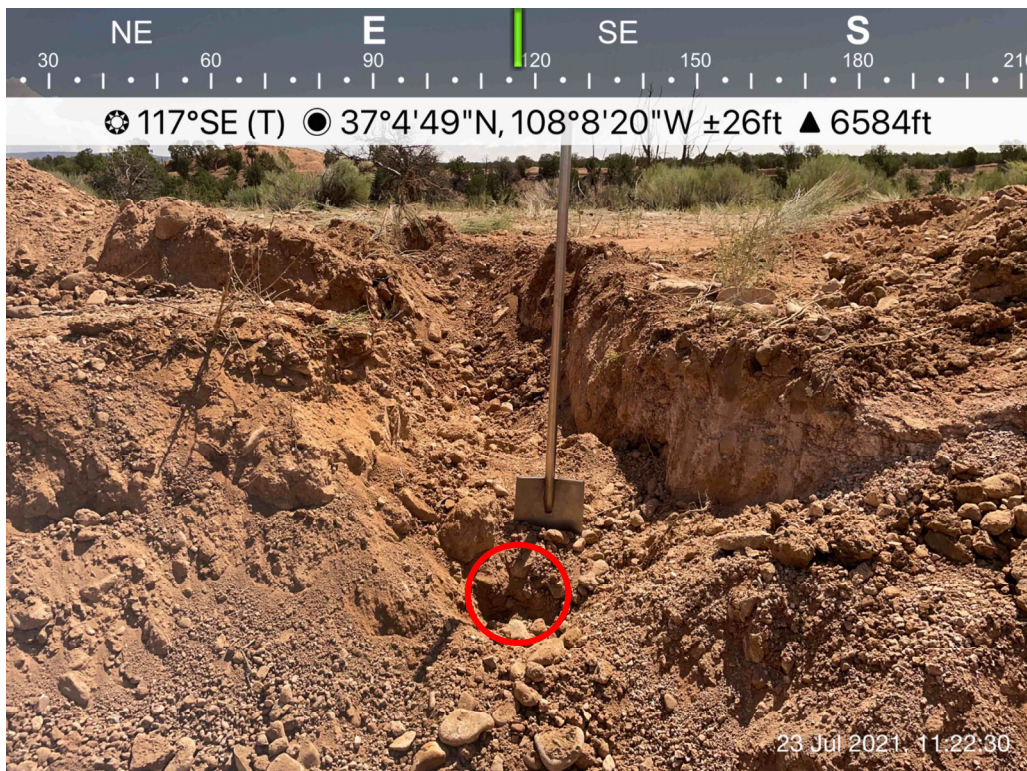
Photo 4: SS04 collected from a flowline segment at Jumbo (OWP) #1A, 7/23/2021.