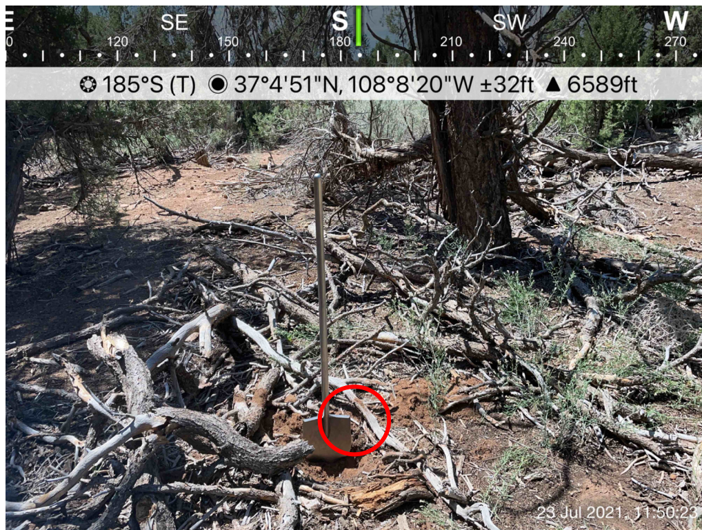
Photo 6: SS06 collected as a background sample from an undisturbed area off-location at the Jumbo (OWP) #1A, 7/23/2021.