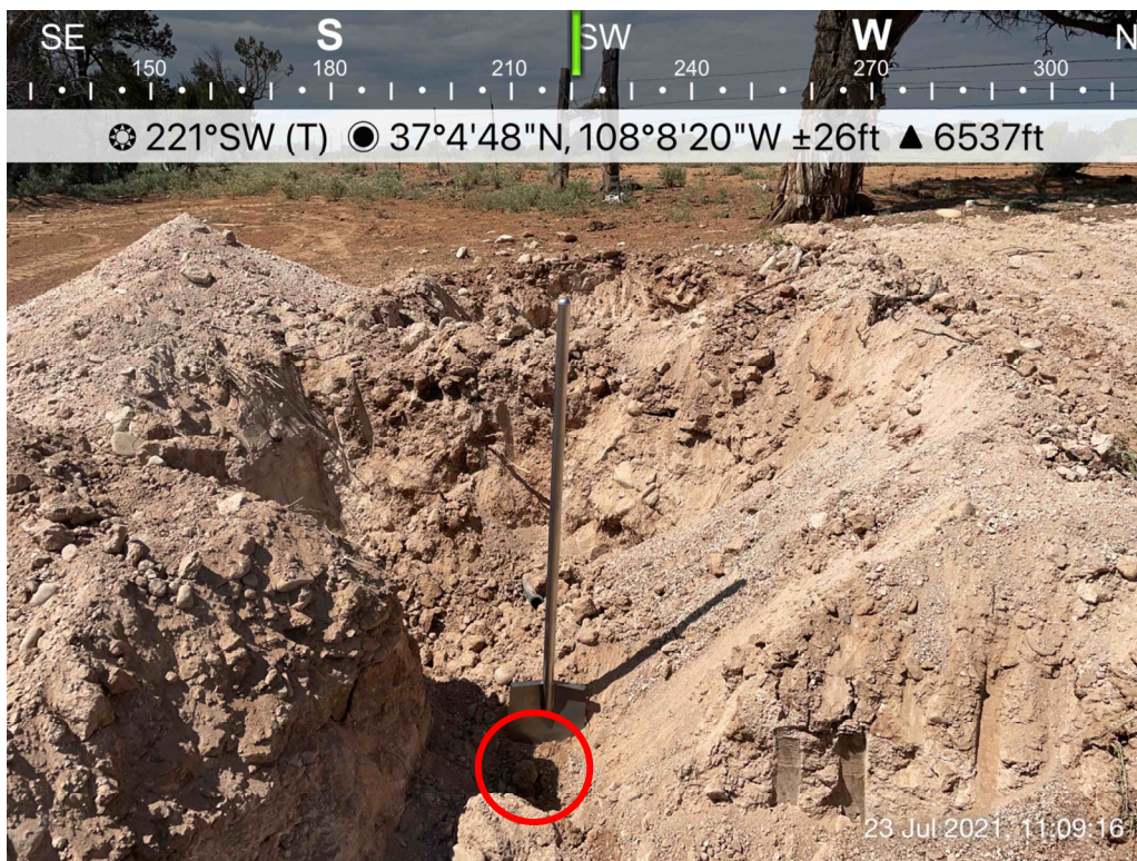
Photo 3: SS03 collected from a flowline segment at Jumbo (OWP) #1A, 7/23/2021.