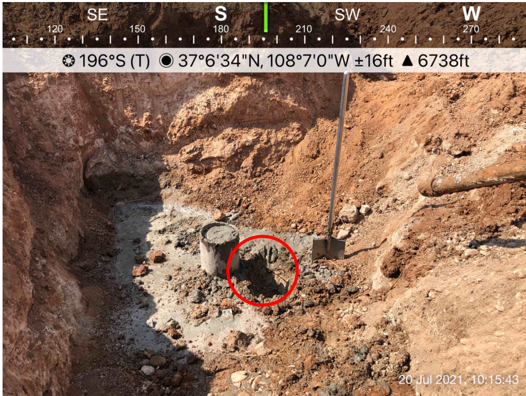
Photo 1: SS01 collected adjacent to Haun-Delaney (OWP) #1 wellhead, 7/20/2021.