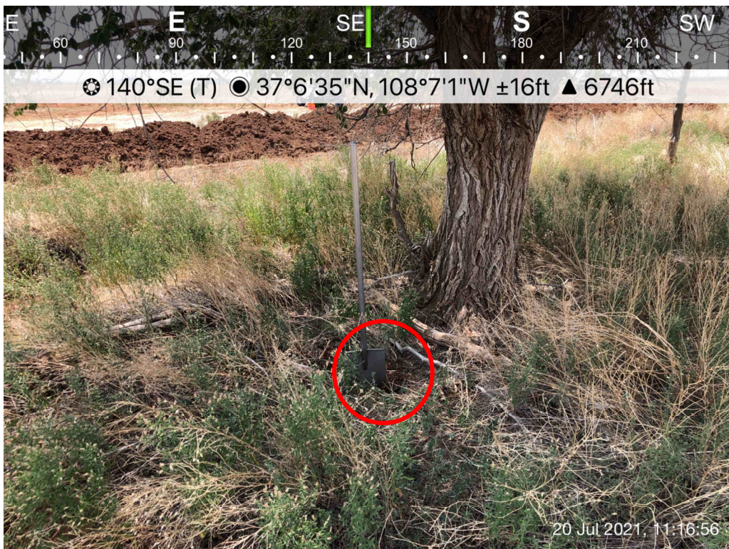
Photo 4: SS04 collected as a background sample from an undisturbed area off-location at the Haun-Delaney (OWP) #1, 7/20/2021.