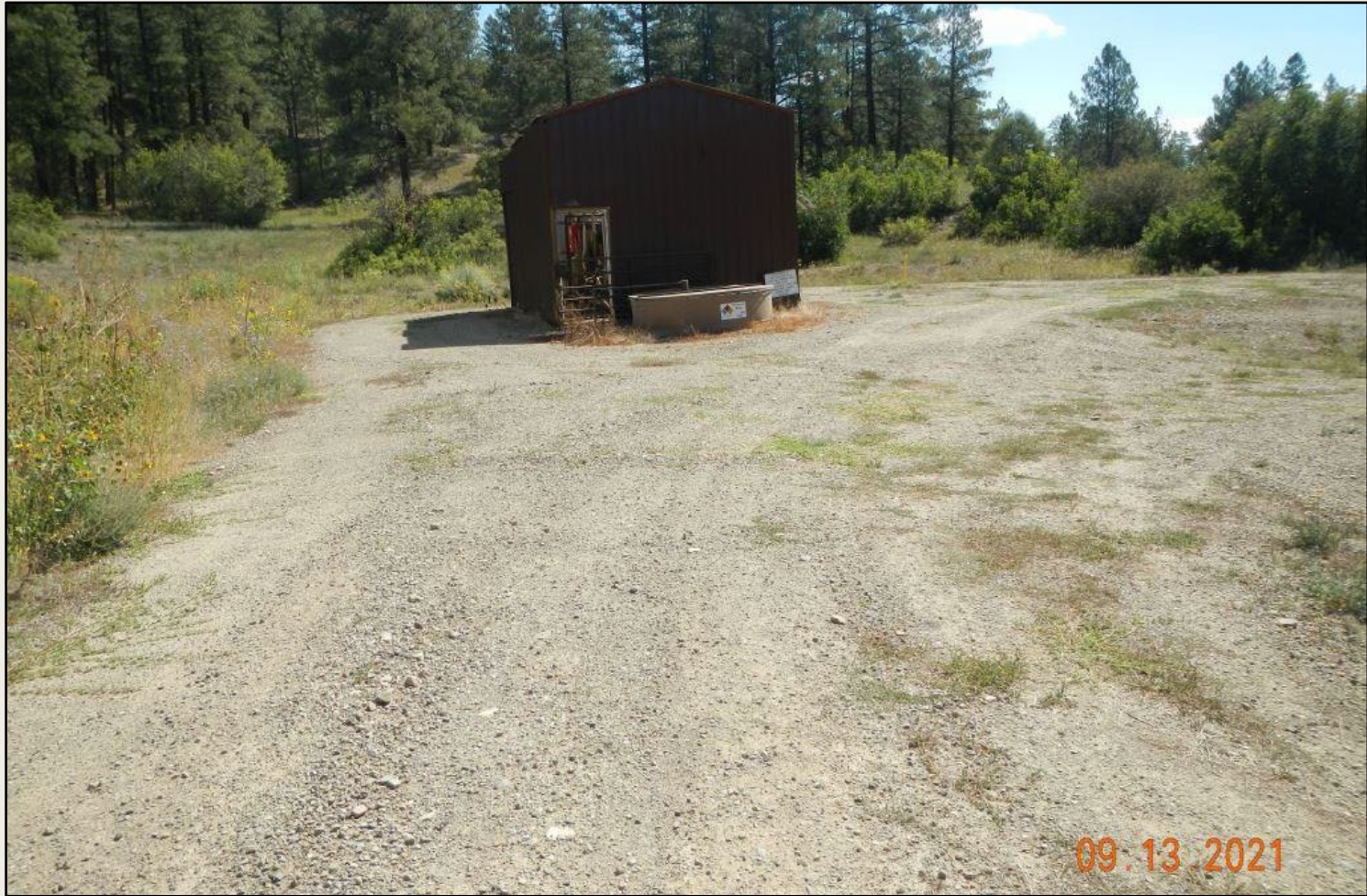
Photo 1. View of the project area from the facility entrance facing center.