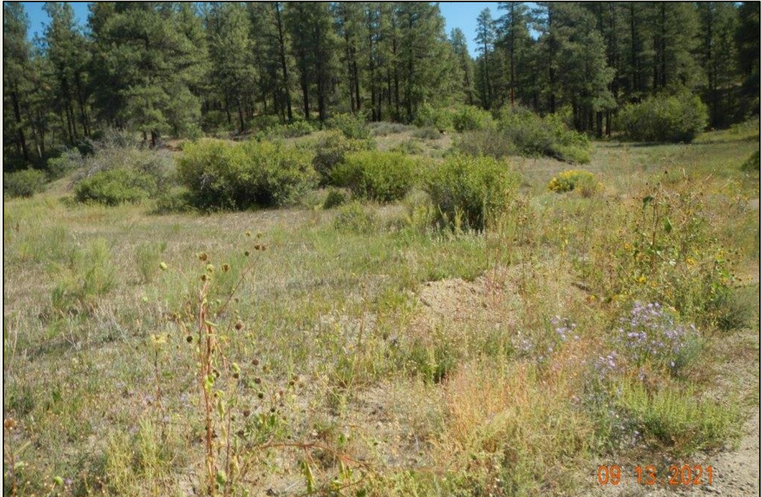
Photo 3. View of the northern project area from the northwestern edge facing eastward. Revegetation is progressing in non-weedy areas with smooth brome.