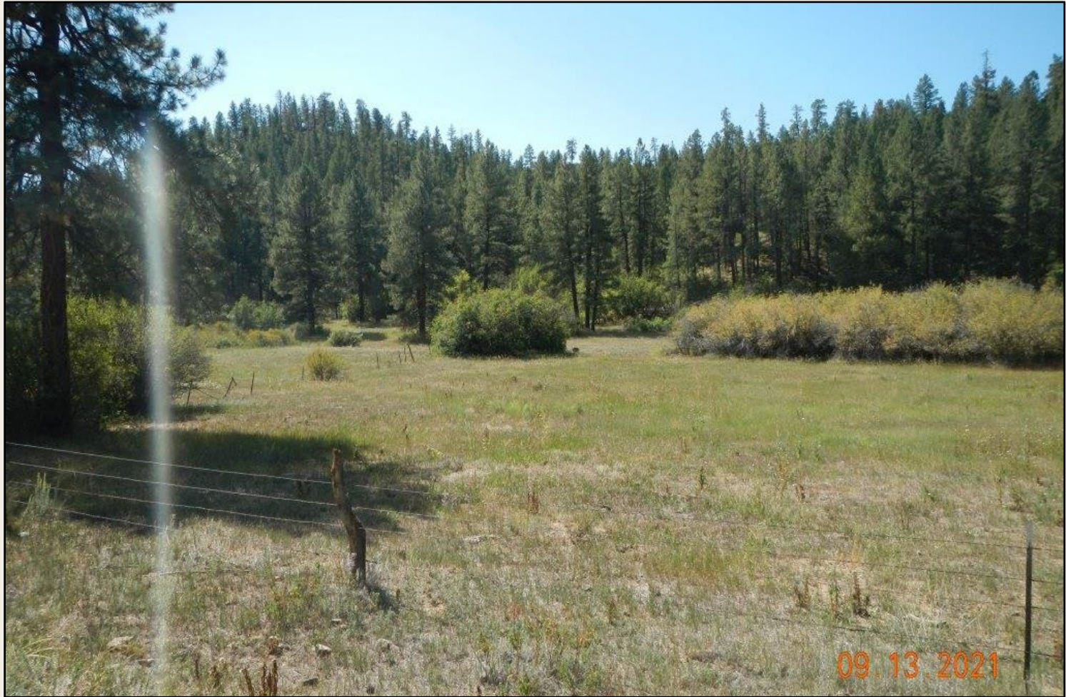
Photo 5. View of the reference area comprised of mixed grass field, with ponderosa pine forest, and western wheatgrass, smooth brome, serviceberry, and gambel oak in the understory.