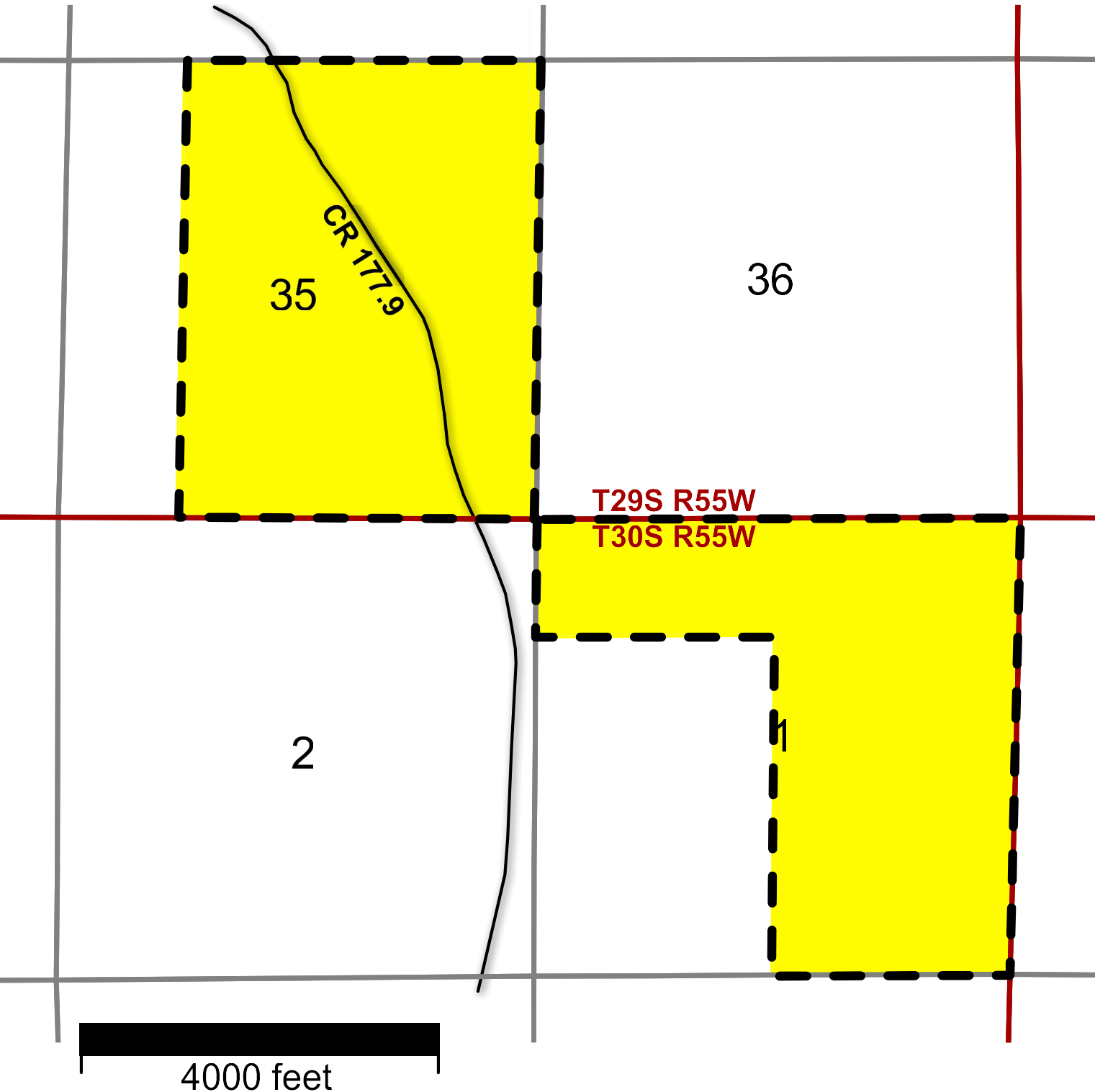
Exhibit 2- Surface Ownership