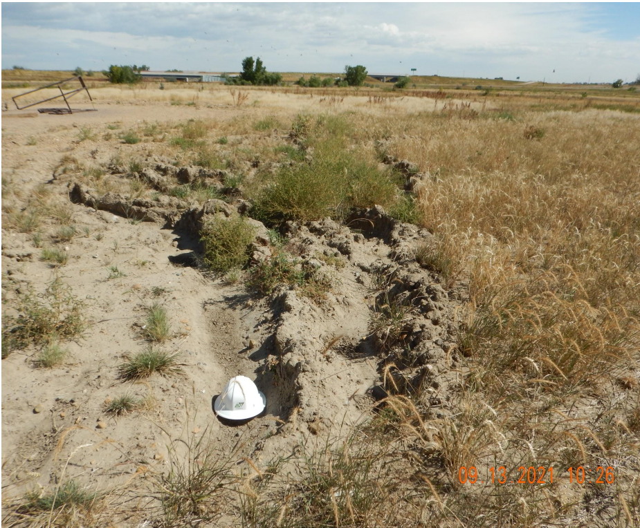
Photo 5. Photo taken from the southeastern rutted area, facing North. Ruts have damaged areas where it appears City of Thornton has recently conducted seeding on much of the area adjacent to the well location.