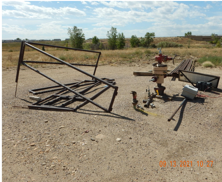
Photo 7. Photo taken from the well location, facing South. Photo illustrates unused equipment.