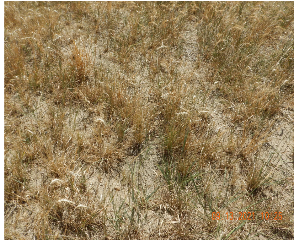
Photo 6. Reference photo taken from an adjacent area illustrating new vegetative growth from a recent seeding.