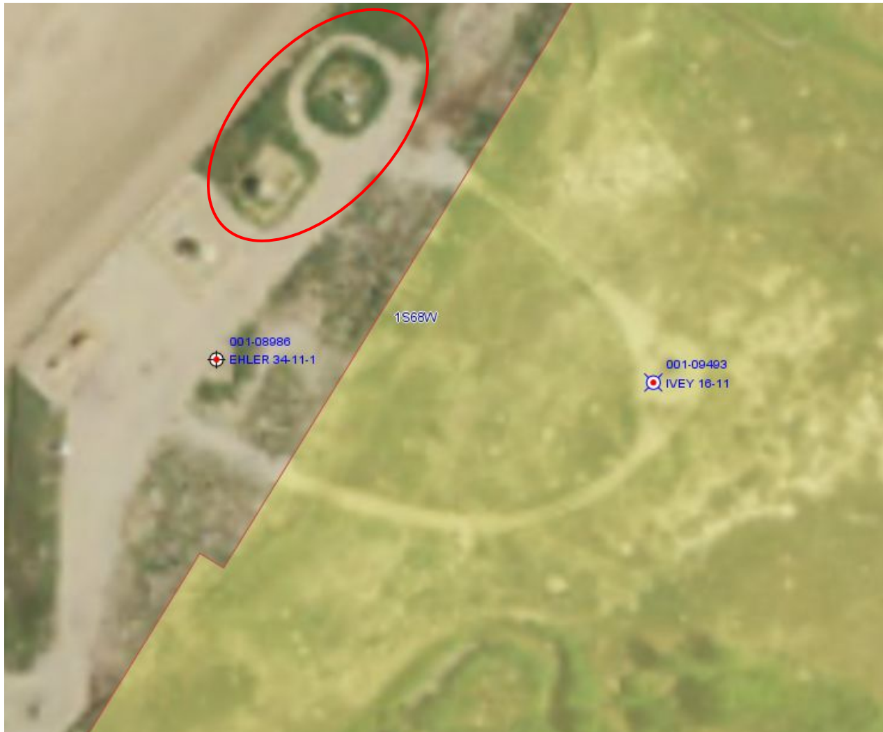
Photo 1. 2019 aerial imagery illustrates the well location (Ivey 16-11), well access roads and the associated tank battery (red circle). The yellow shaded area illustrates City of Thornton as the land owner. All property damage was observed on City of Thornton land.