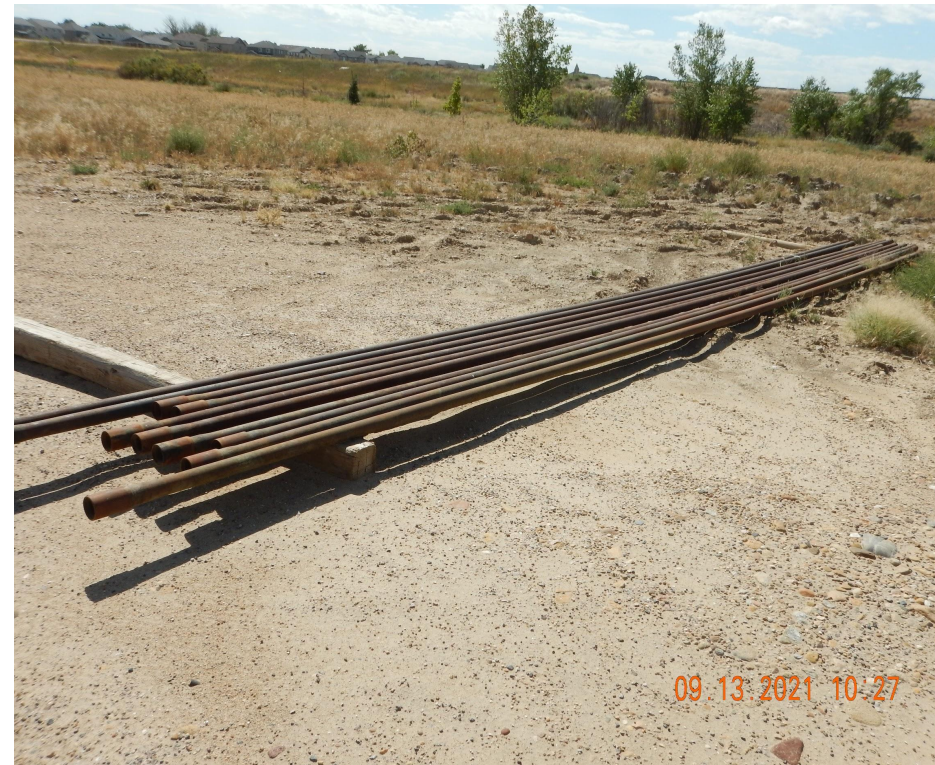
Photo 8. Photo taken from the well location, facing South. See comments under Photo 7.