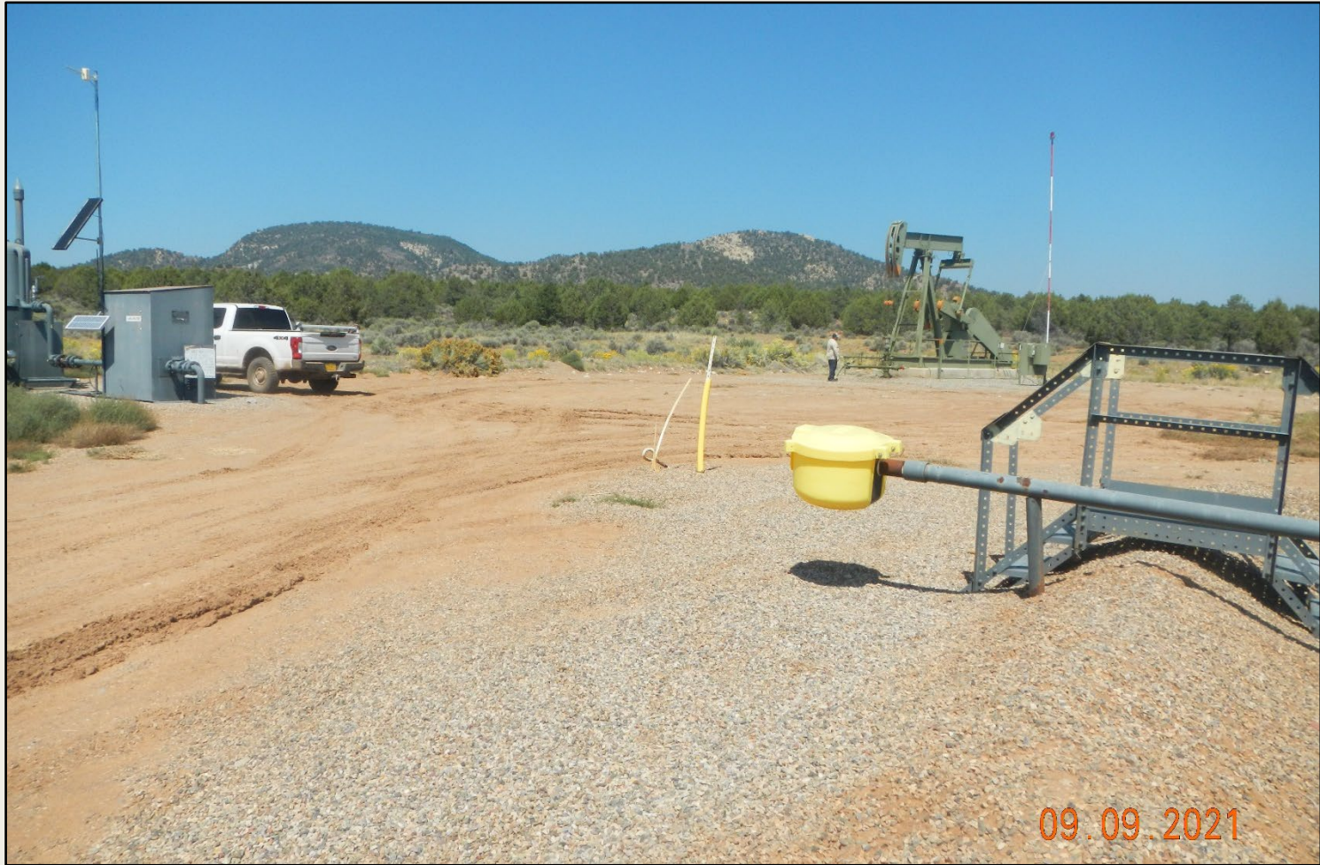
Photo 1. View of the project area from the southeastern corner facing center.