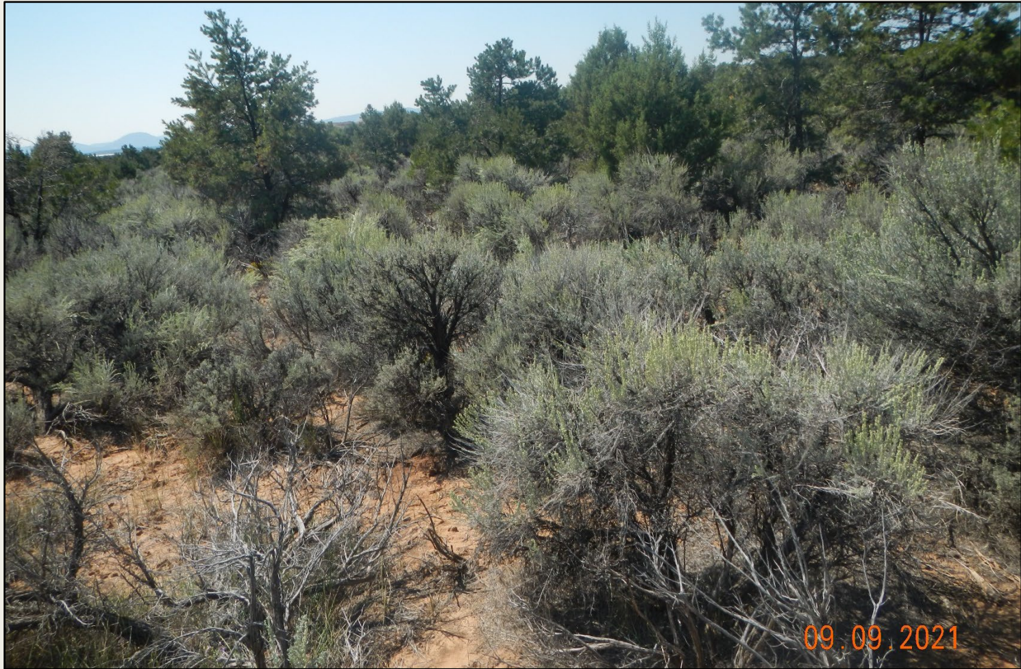
Photo 4. View of reference area comprised of sagebrush shrubland and pinyon/juniper woodland with understory of blue grama, western wheatgrass, snakeweed, and prickly pear.