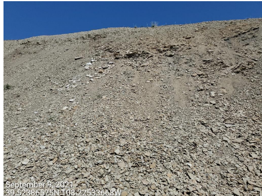
Photo 3: Photos shows example of the cut slopes, where BMPs to protect and stabilize the slopes are missing or insufficient on the Location.