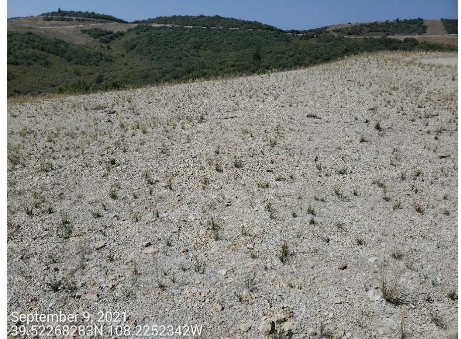
Photo 1: Photos show example of the interim areas of the Locaiton. At least 4 growing seasons have passed since interim work was performed. Photos show reclamation is not progressing towards an 80% uniform, desirable perennial vegetative establishment to that of the reference are. Photo also shows soils on the interim areas are subsoils; topsoil has not been placed onto the majority of interim areas.