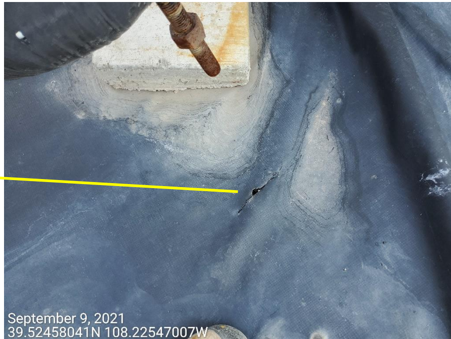
Photo 5: Photos show tear observed in the liner on the north side of the tank battery