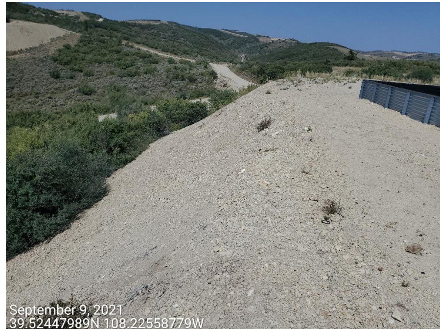
Photo 6: Photos shows control measures are missing or insufficient to protect and stabilize the fill slopes, and manage runoff on the northwest end of the Location.