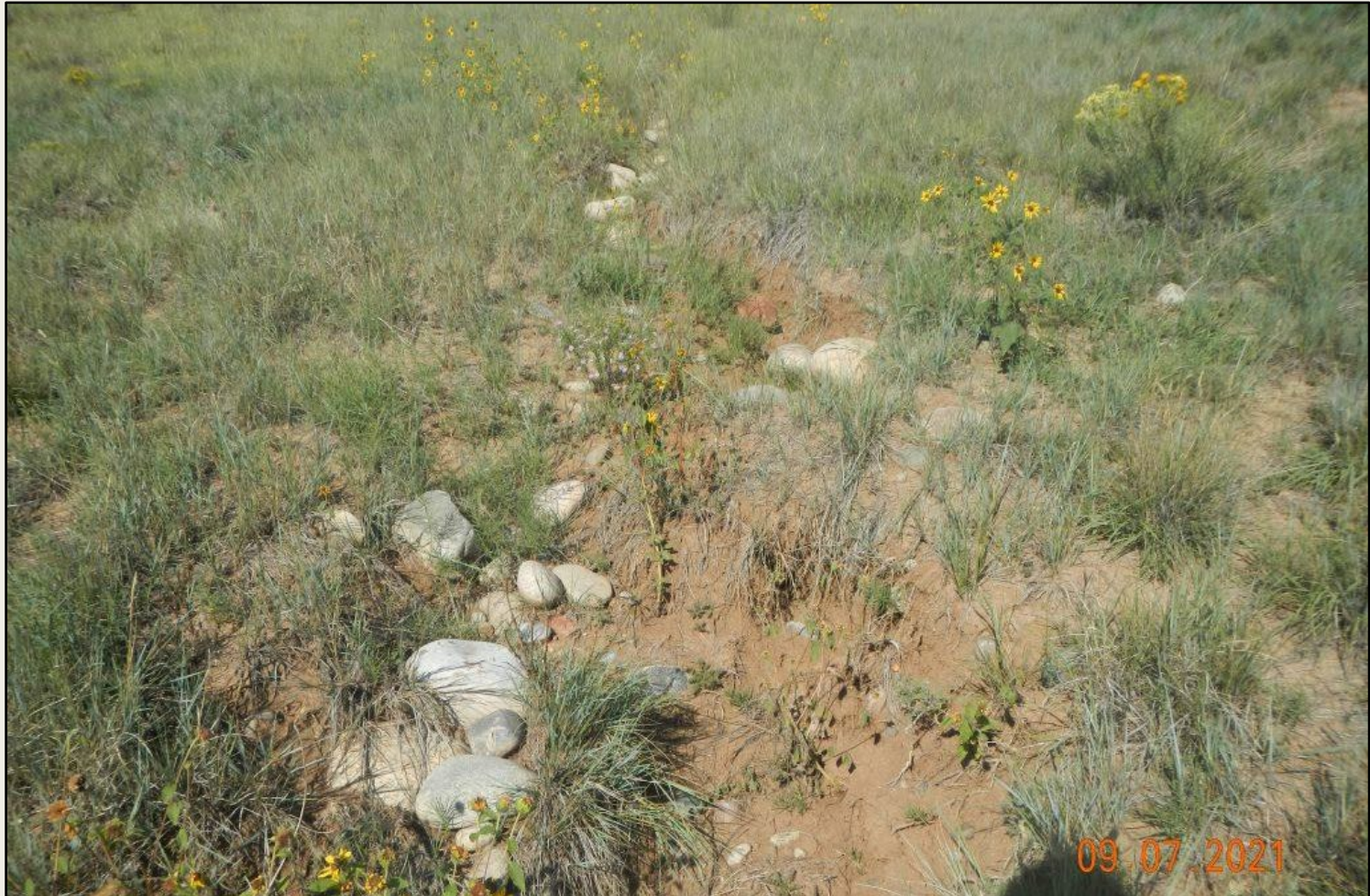
Photo 4. View of erosional channel in the southern project area where stormwater flows around cobbles and continues to erode channel.