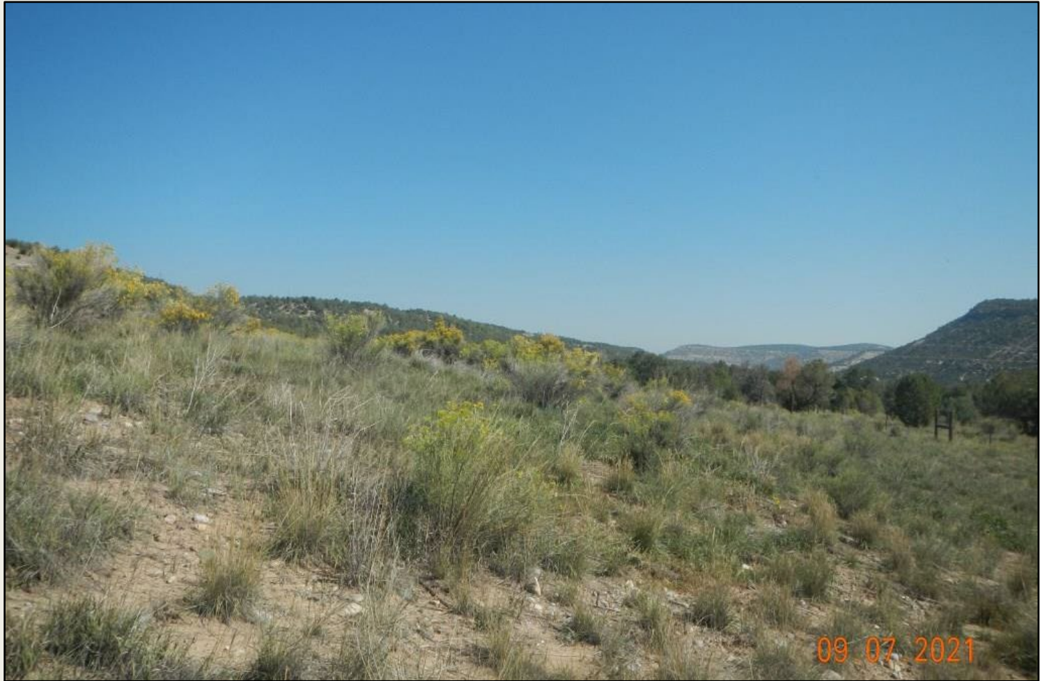
Photo 3. View of the eastern project area from the southeastern corner facing northward.