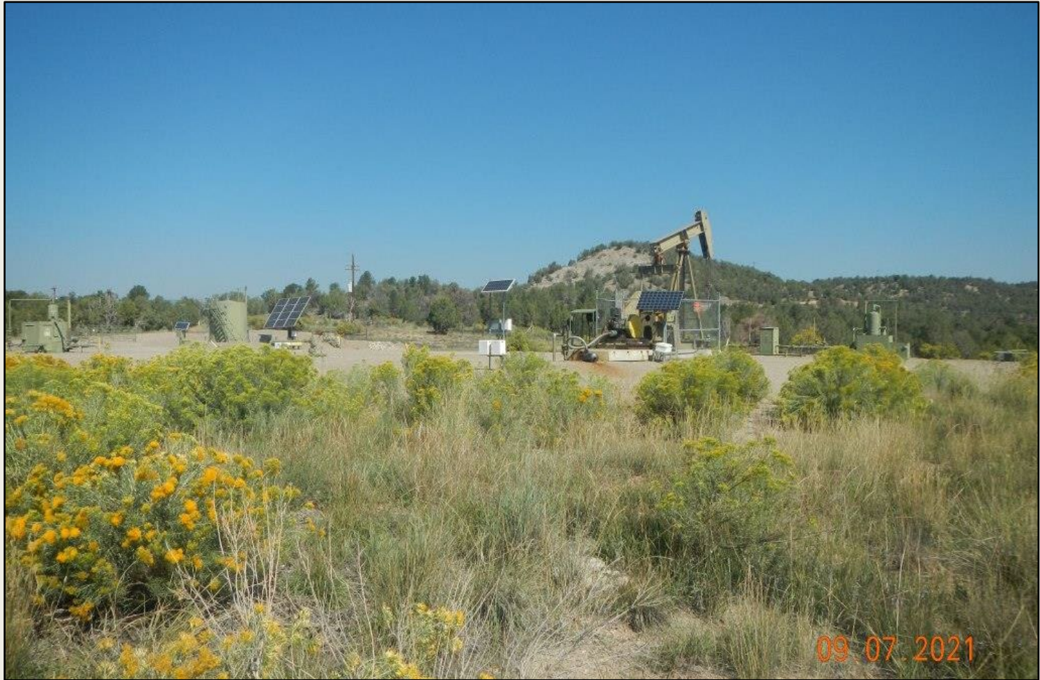
Photo 1. View of the project area from the southeastern corner facing center.