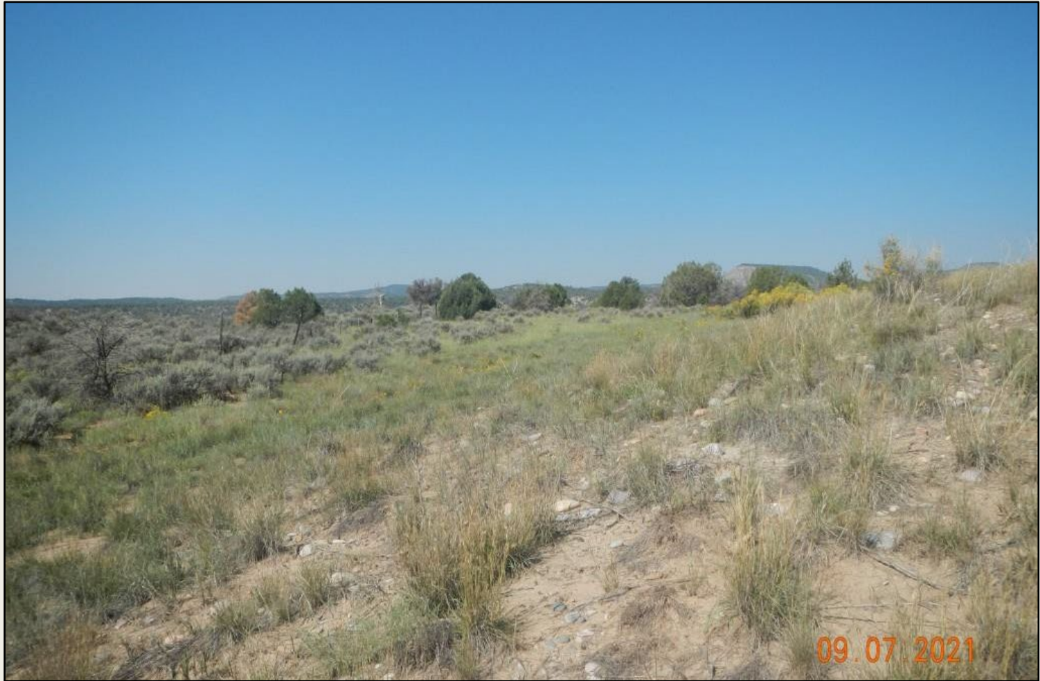
Photo 2. View of the southern project area from the southeastern corner facing westward. Revegetation is comprised of blue grama, western wheatgrass, crested wheatgrass, and rubber rabbitbrush.