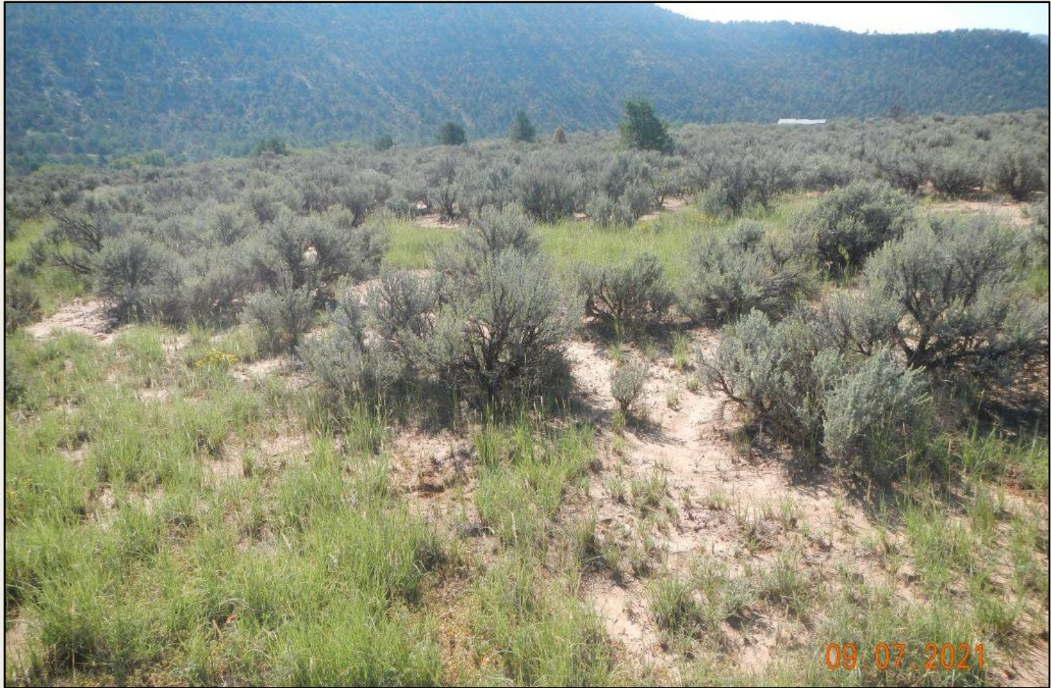
Photo 6. View of reference area comprised of sagebrush shrubland with understory of James galleta, blue grama, and snakeweed.