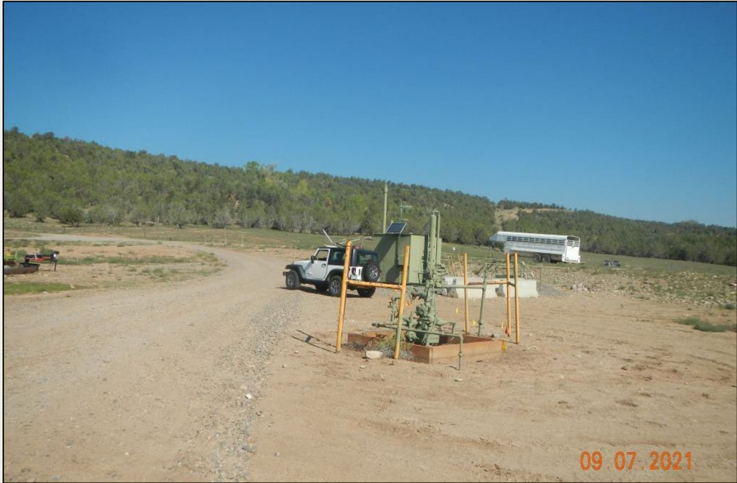
Photo 1. View of the project area from the eastern edge facing center.