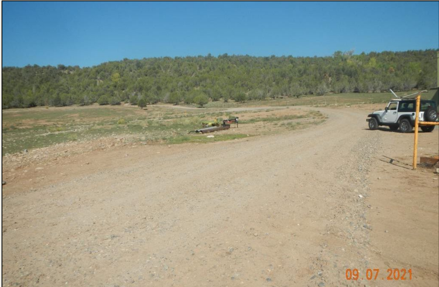
Photo 2. View of the southern project area from the southeastern corner facing westward. Vegetation is largely kochia, similar to surrounding grazed pasture. Surface owner storage in southwestern corner of well pad.