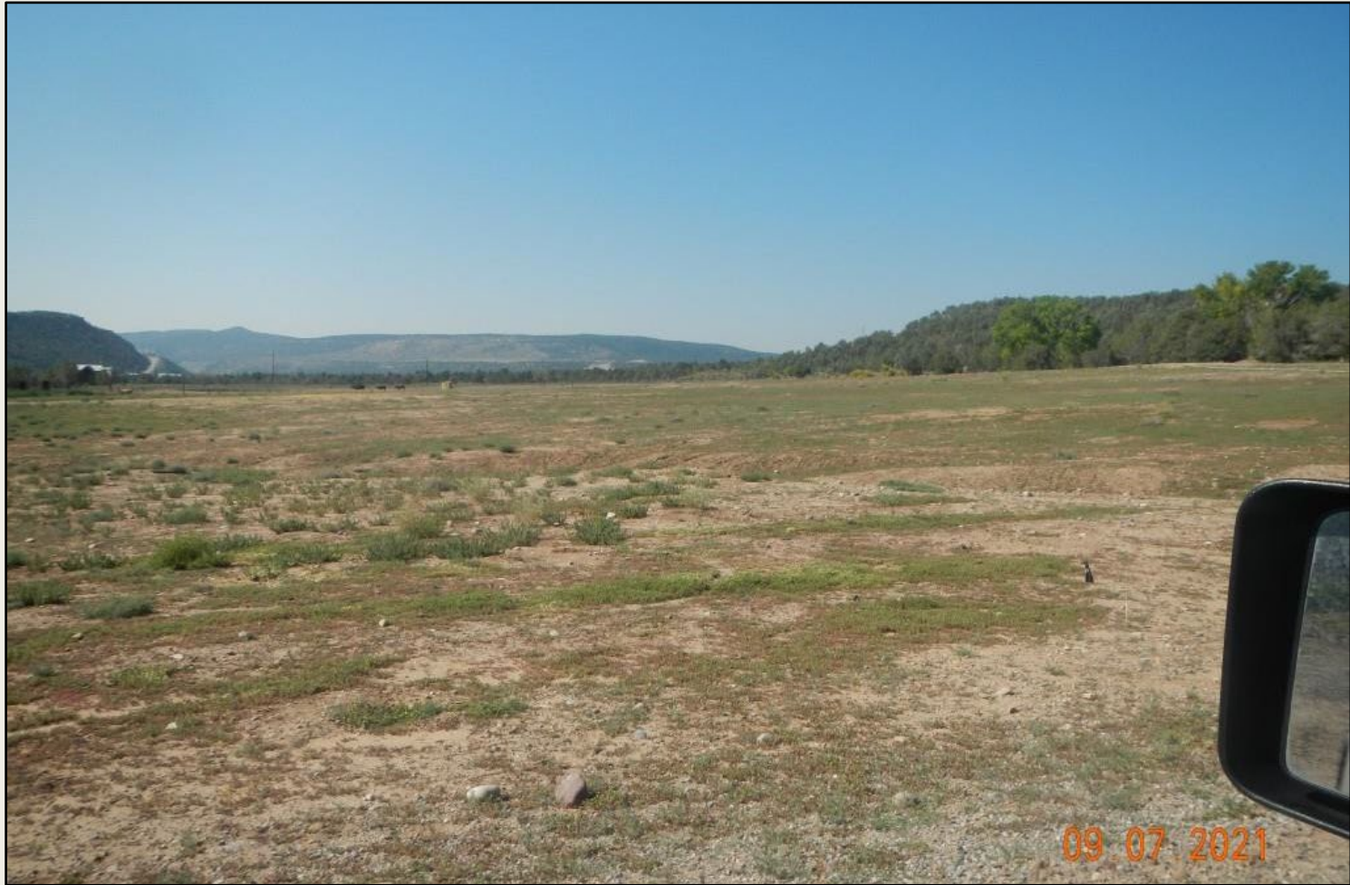
Photo 4. View of reference area comprised of grazed pasture.