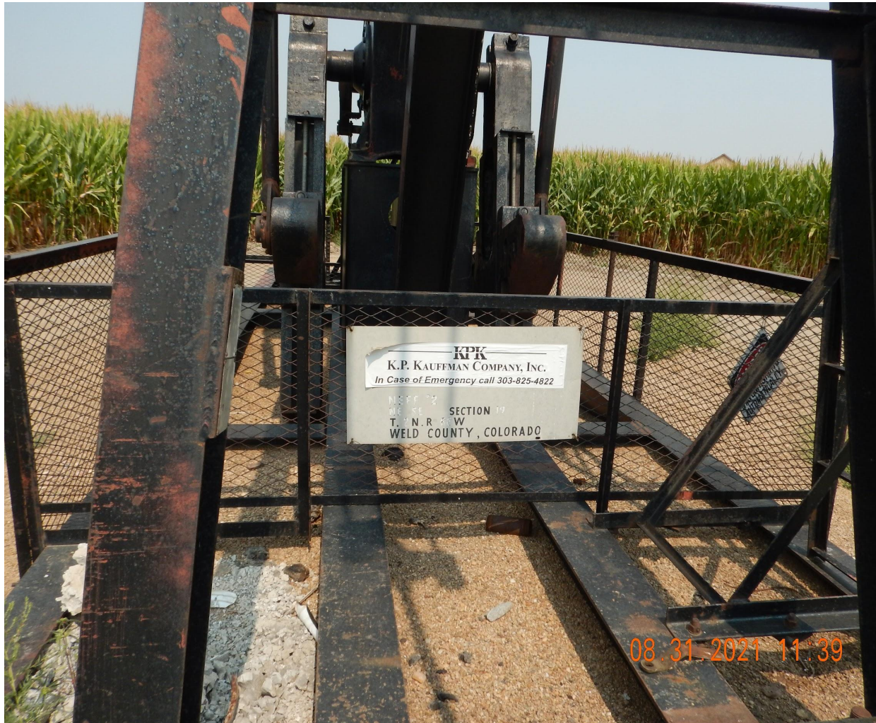
Photo 1. Photo illustrates Operator sign, which is starting to fade.