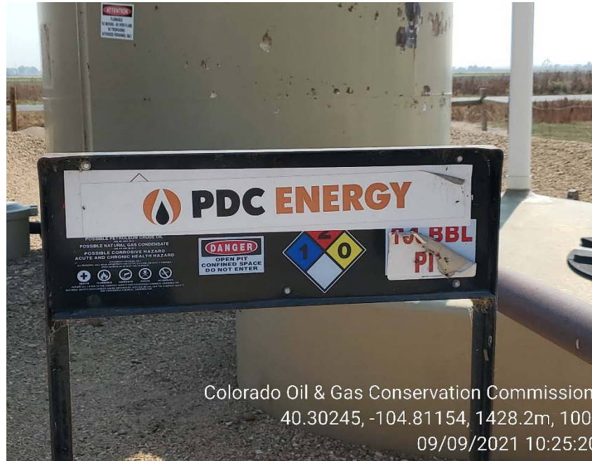
Produced water tank capacity placard